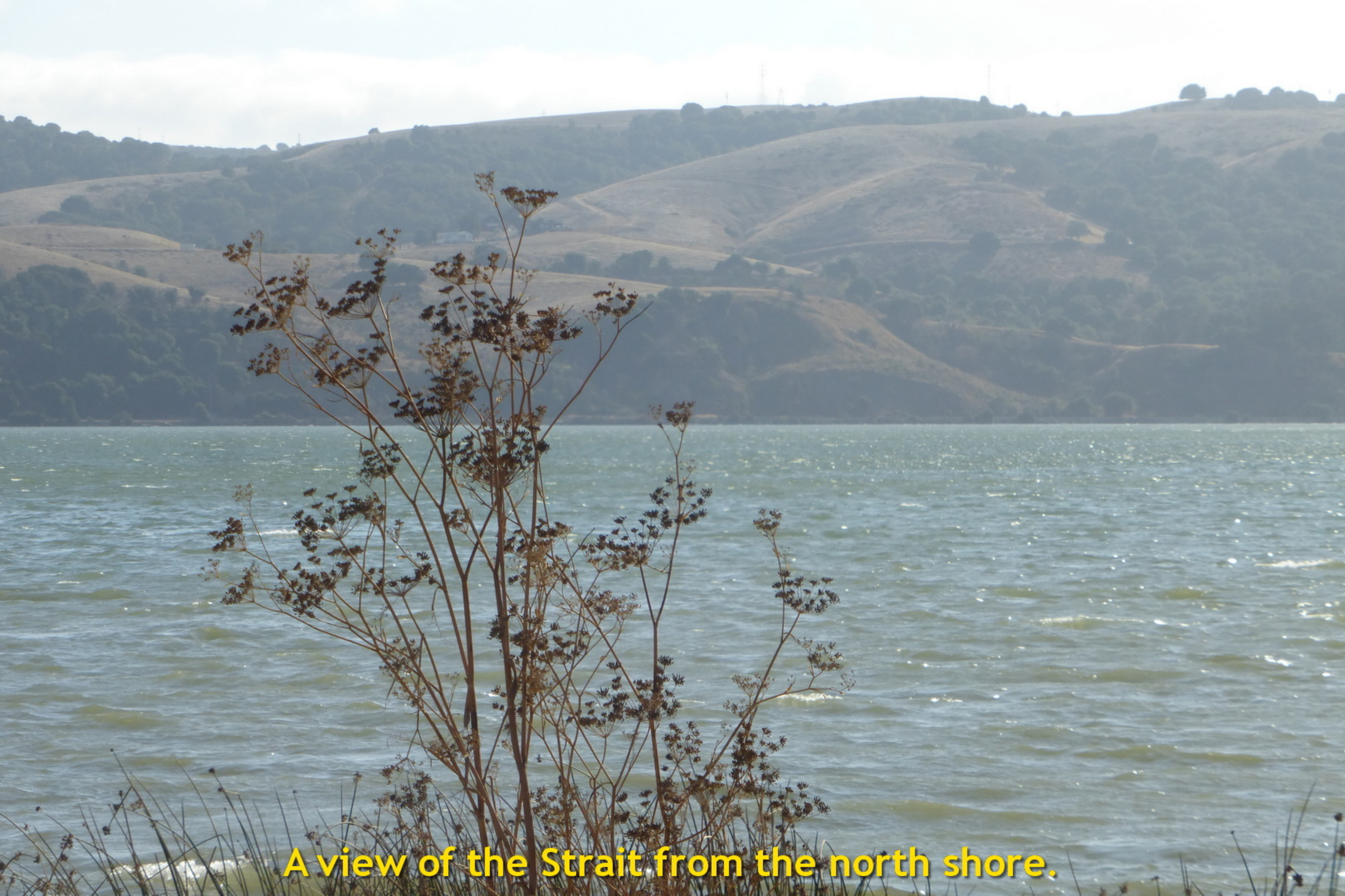
A view of the Strait from the north shore.