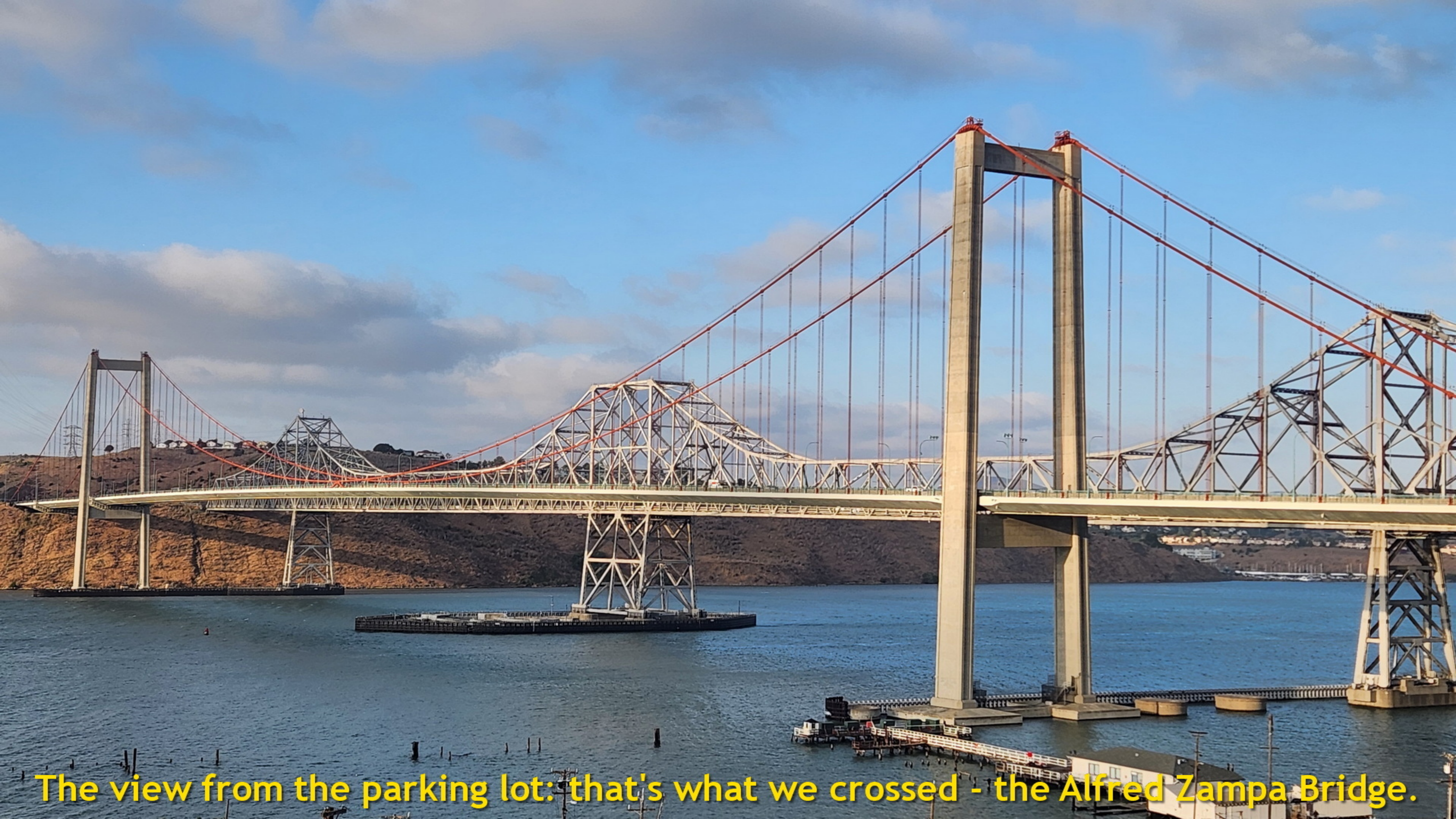
The view from the parking lot: that's what we crossed - the Alfred Zampa Bridge.