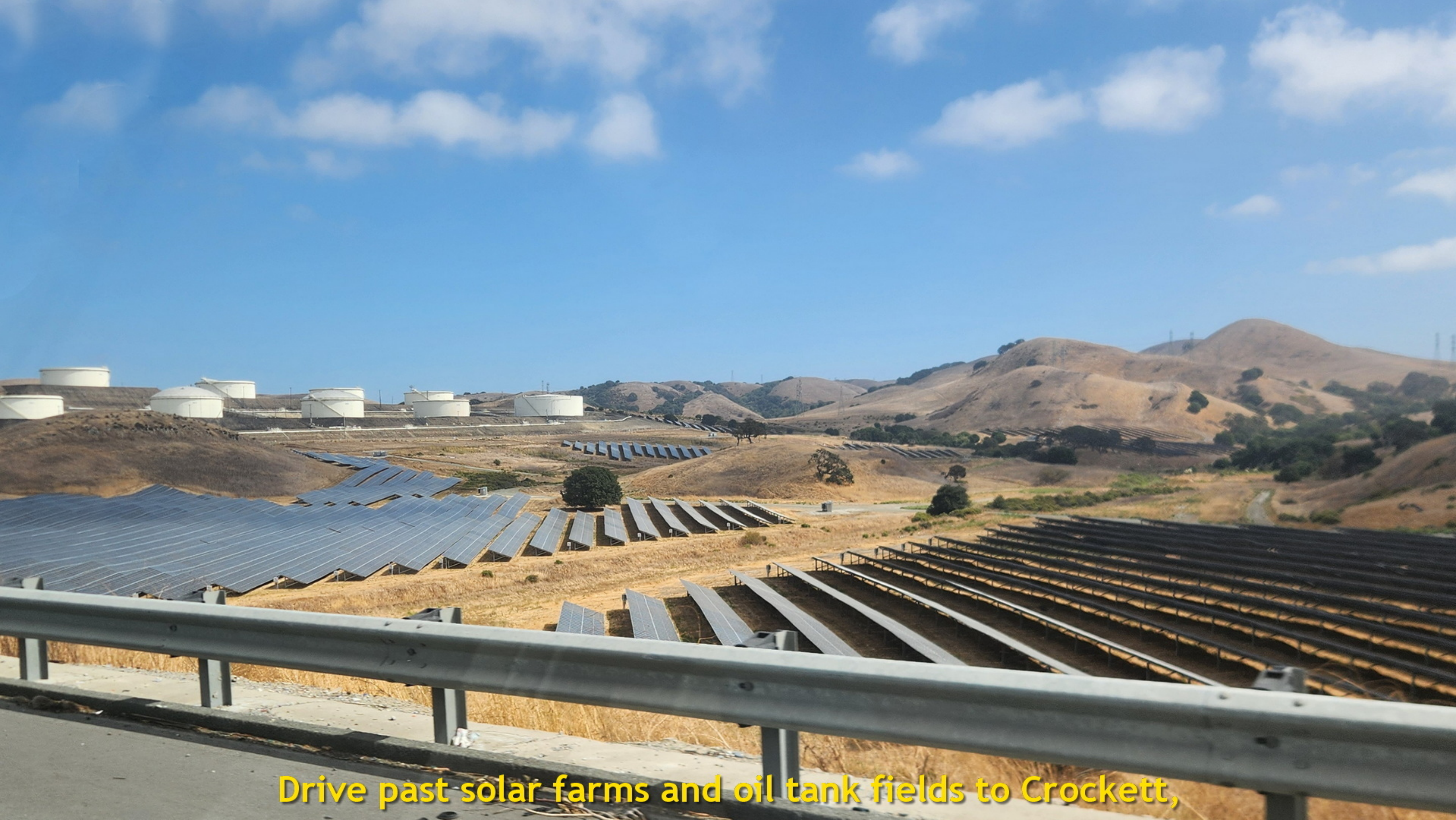
Drive past solar farms and oil tank fields to Crockett,