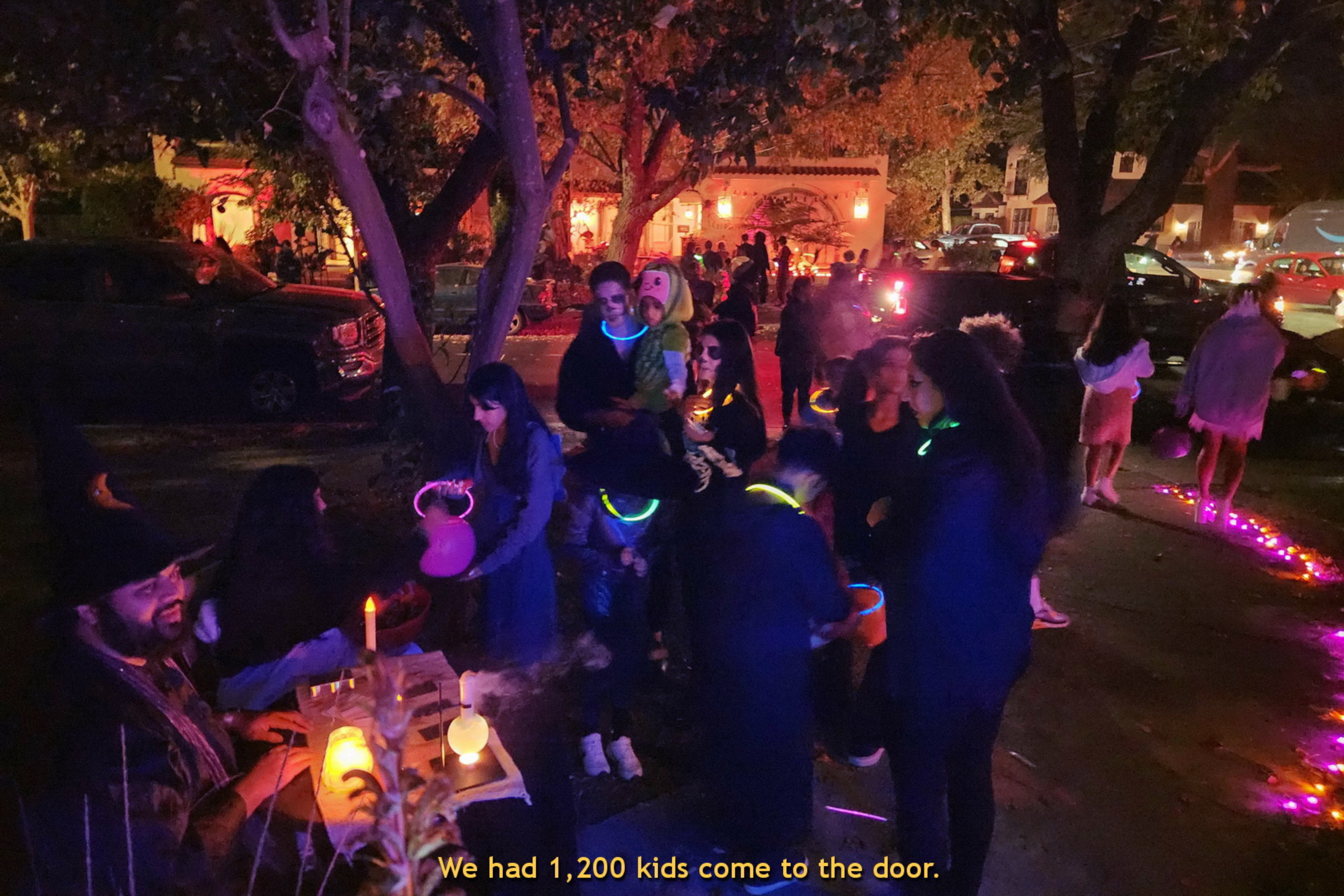
We had 1,200 kids come to the door.