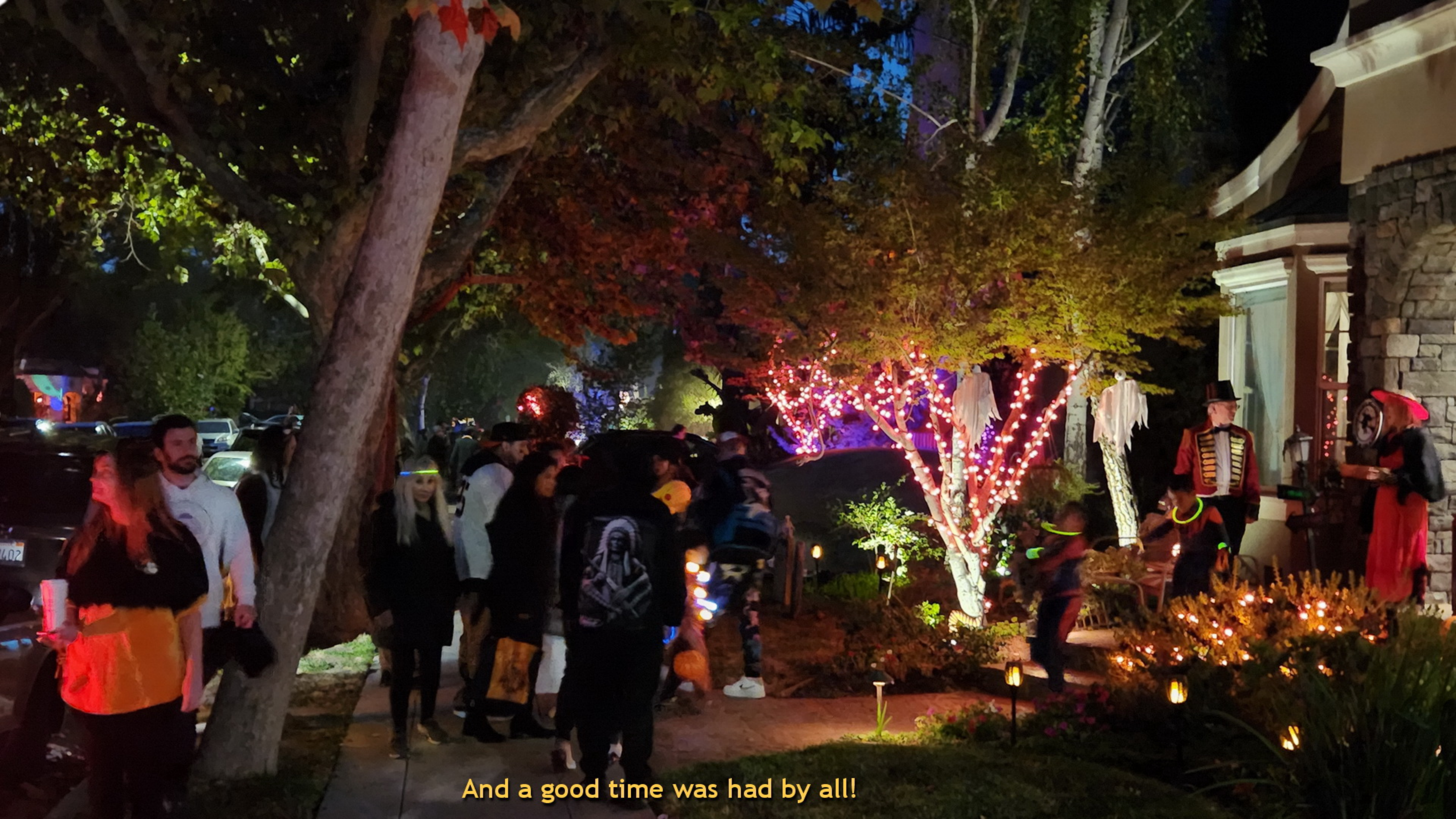
And a good time was had by all!