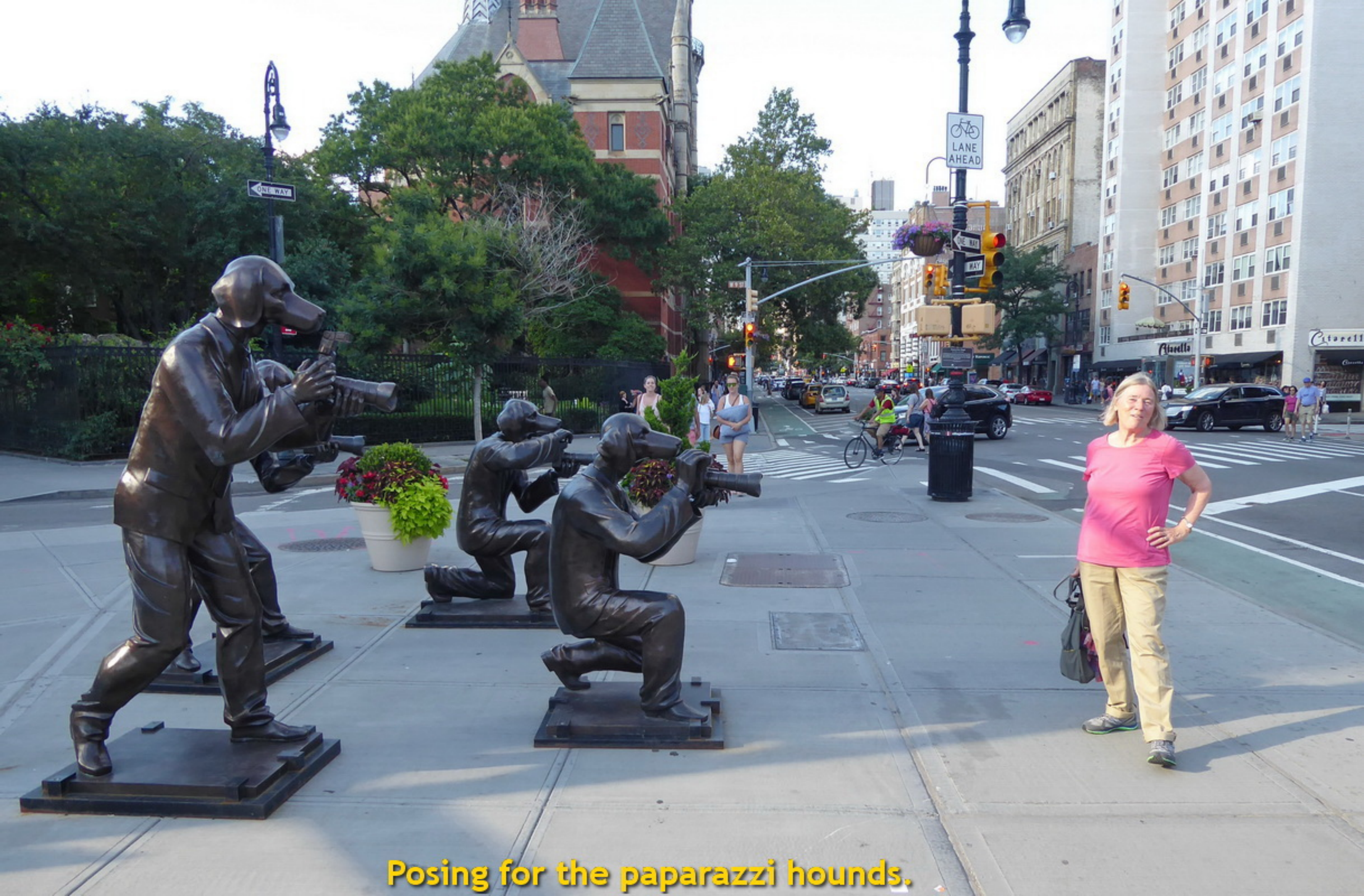
Posing for the paparazzi hounds.