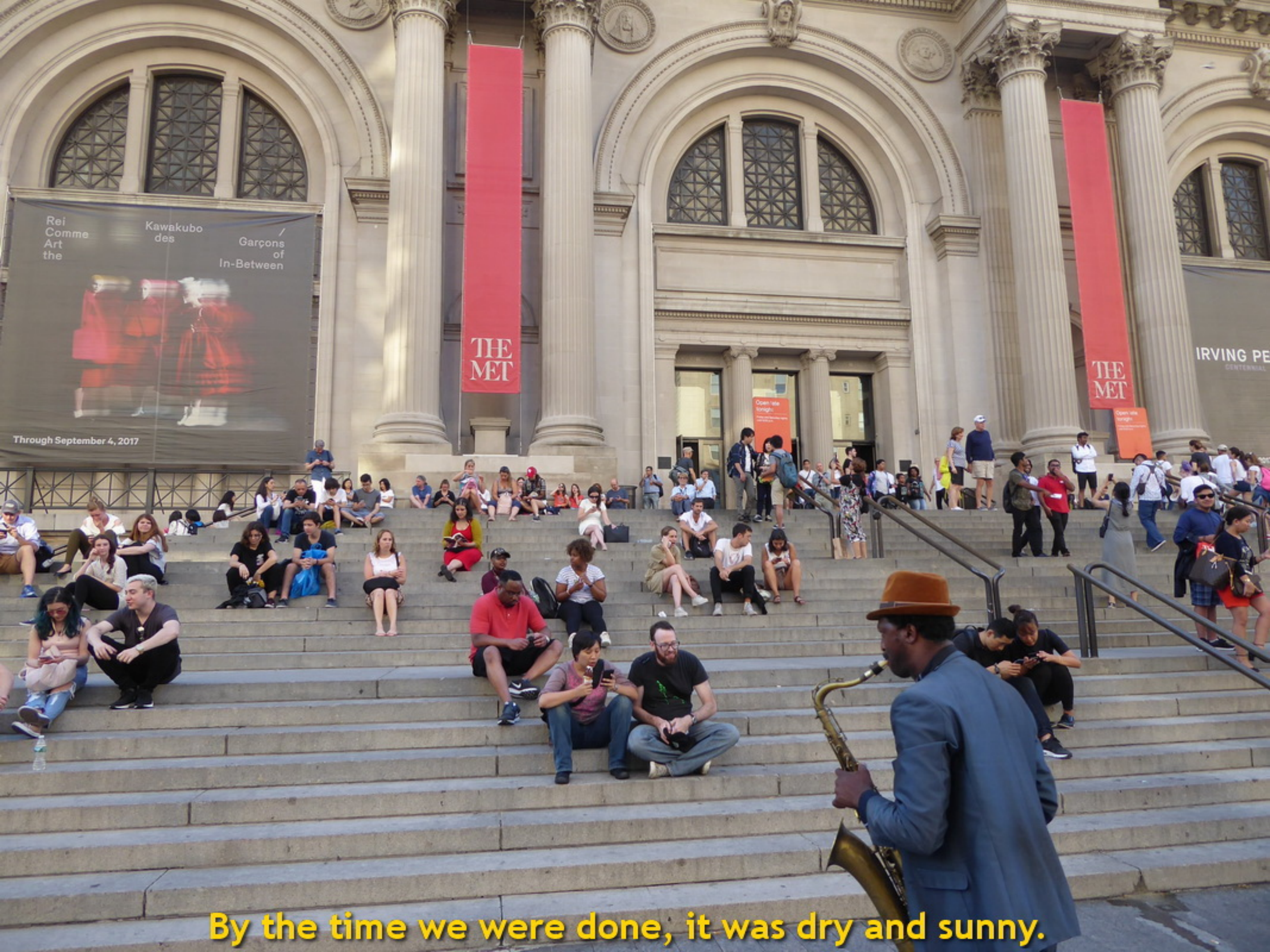
By the time we were done, it was dry and sunny.