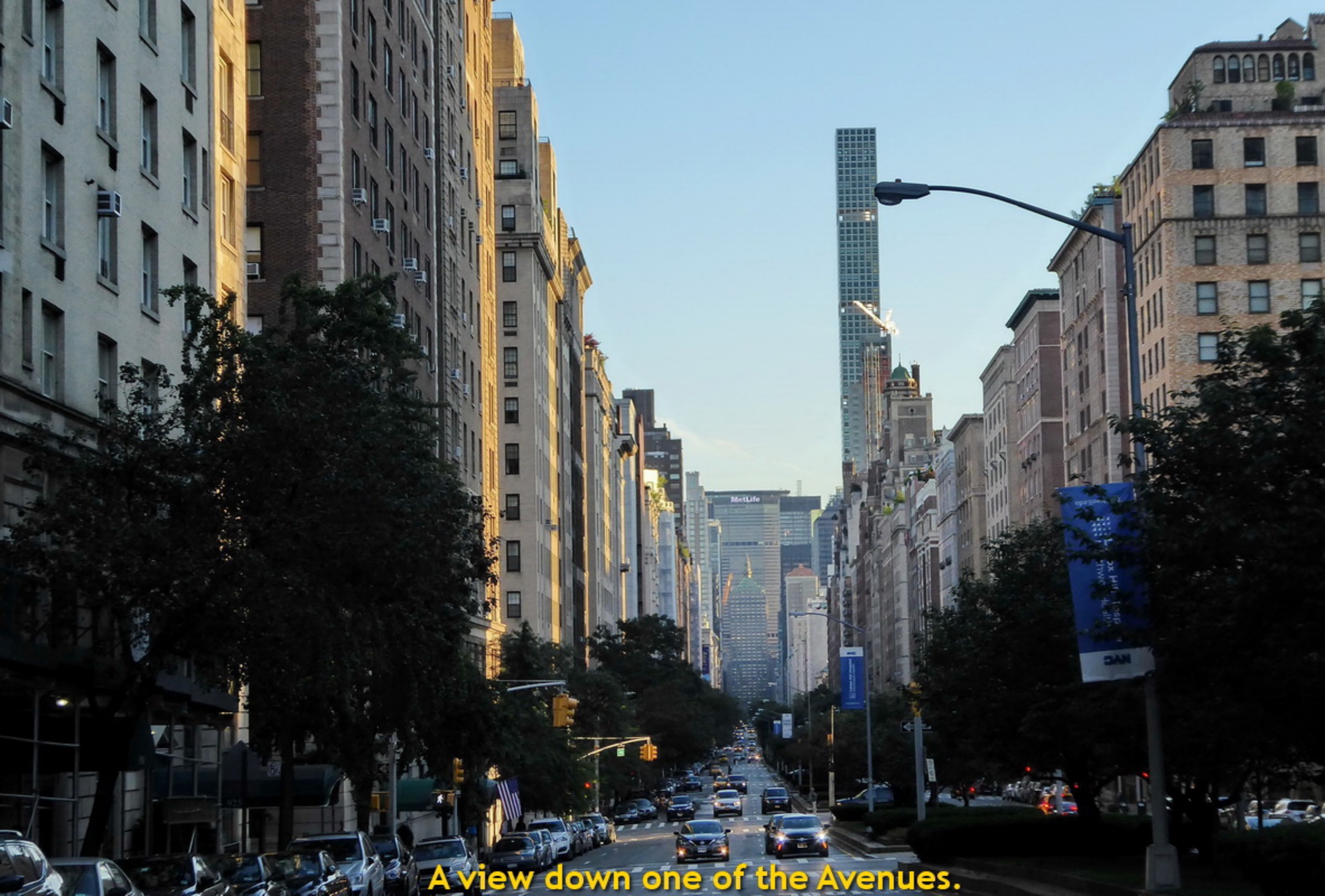
A view down one of the Avenues.