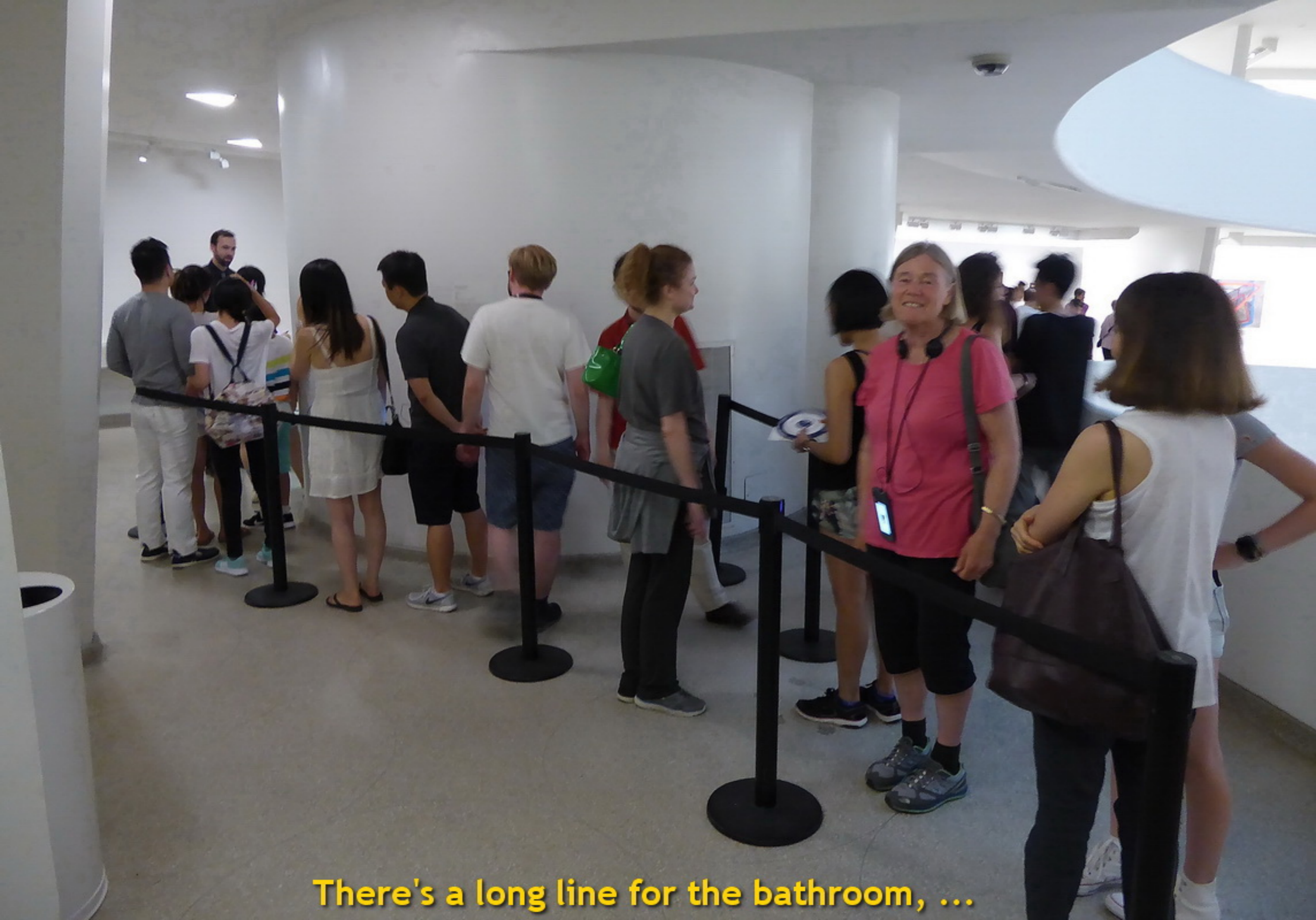
There's a long line for the bathroom, ...