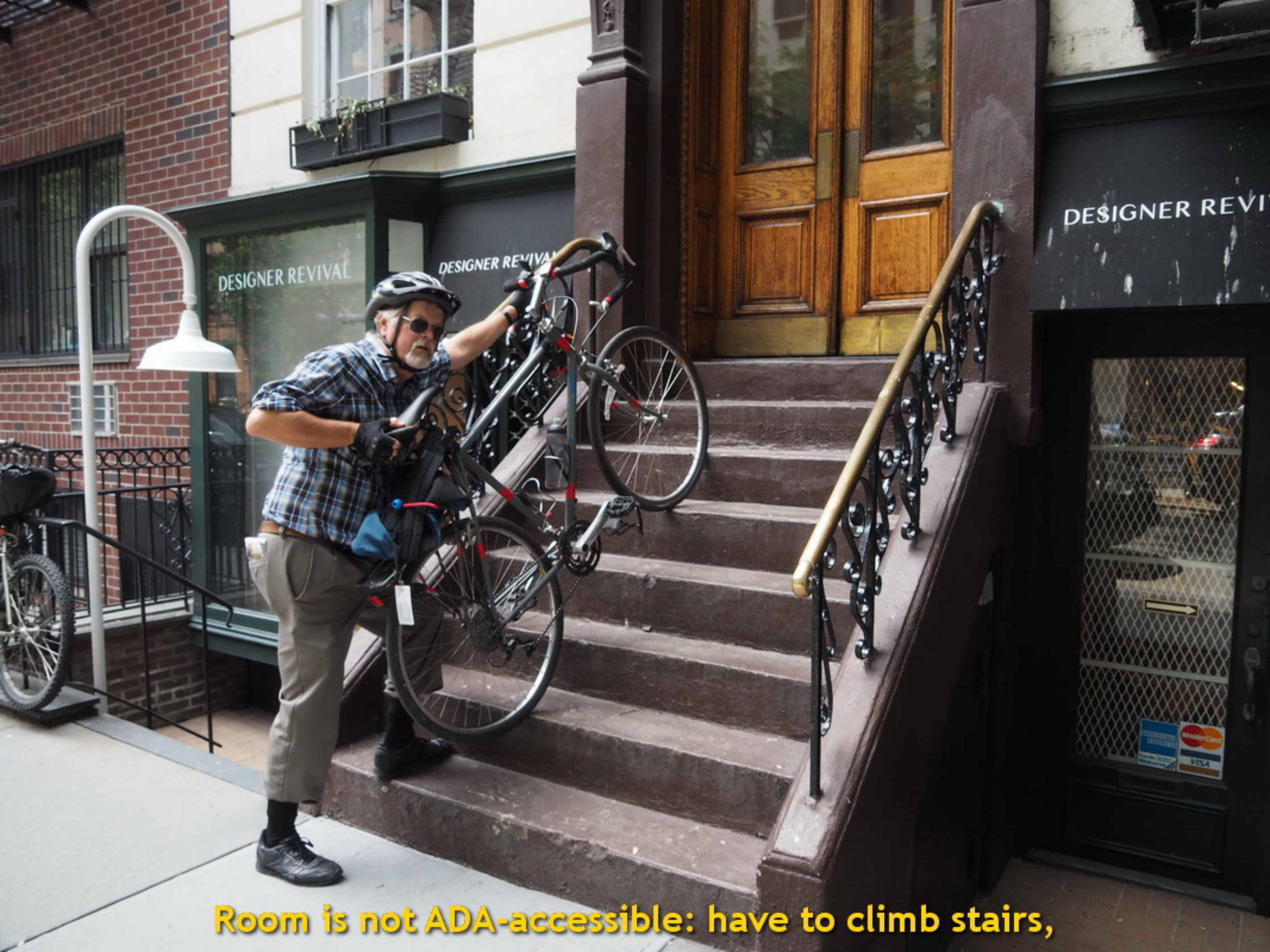
Room is not ADA-accessible: have to climb stairs,