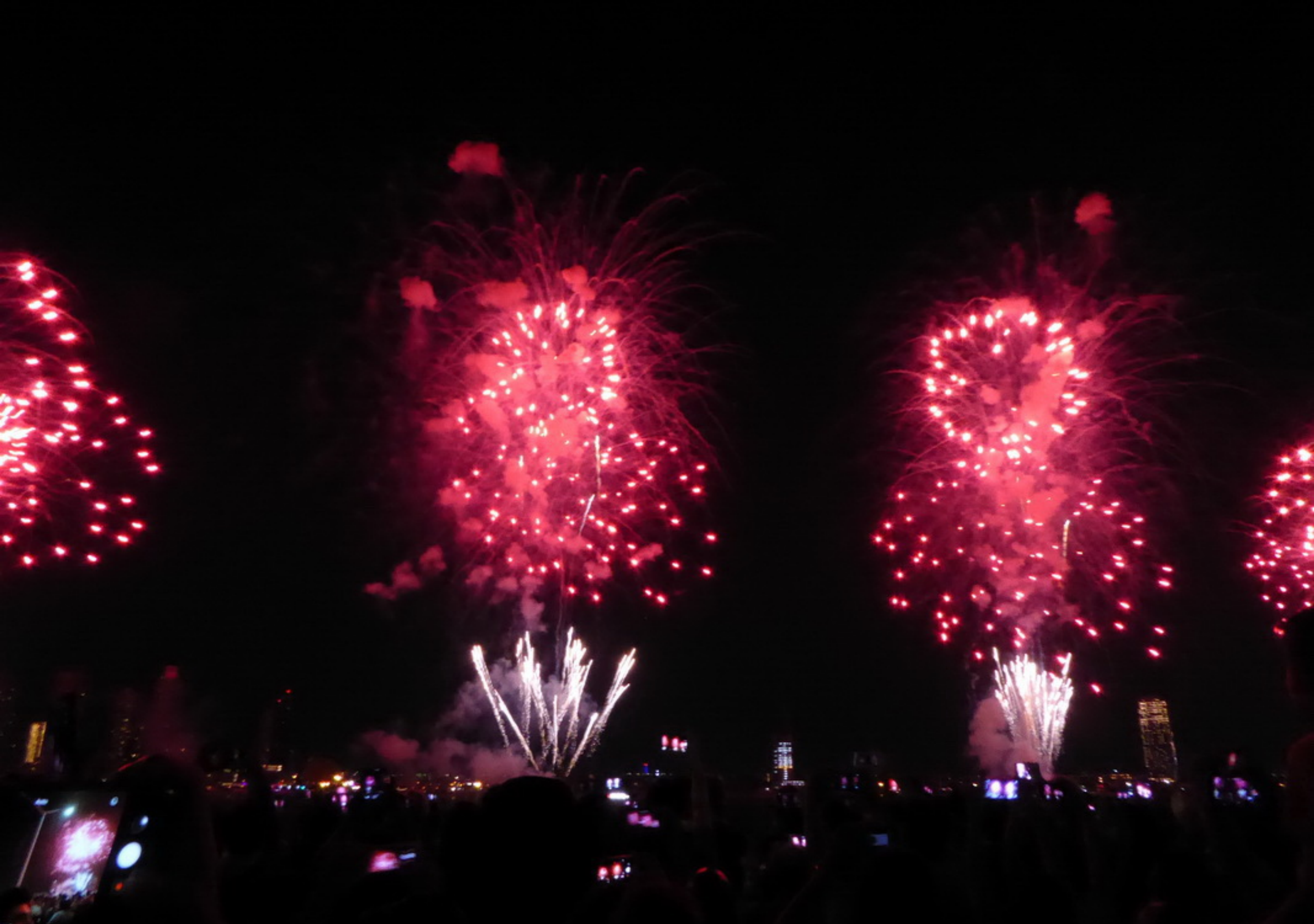
Fireworks! 5 identical displays from 5 barges in the East River.