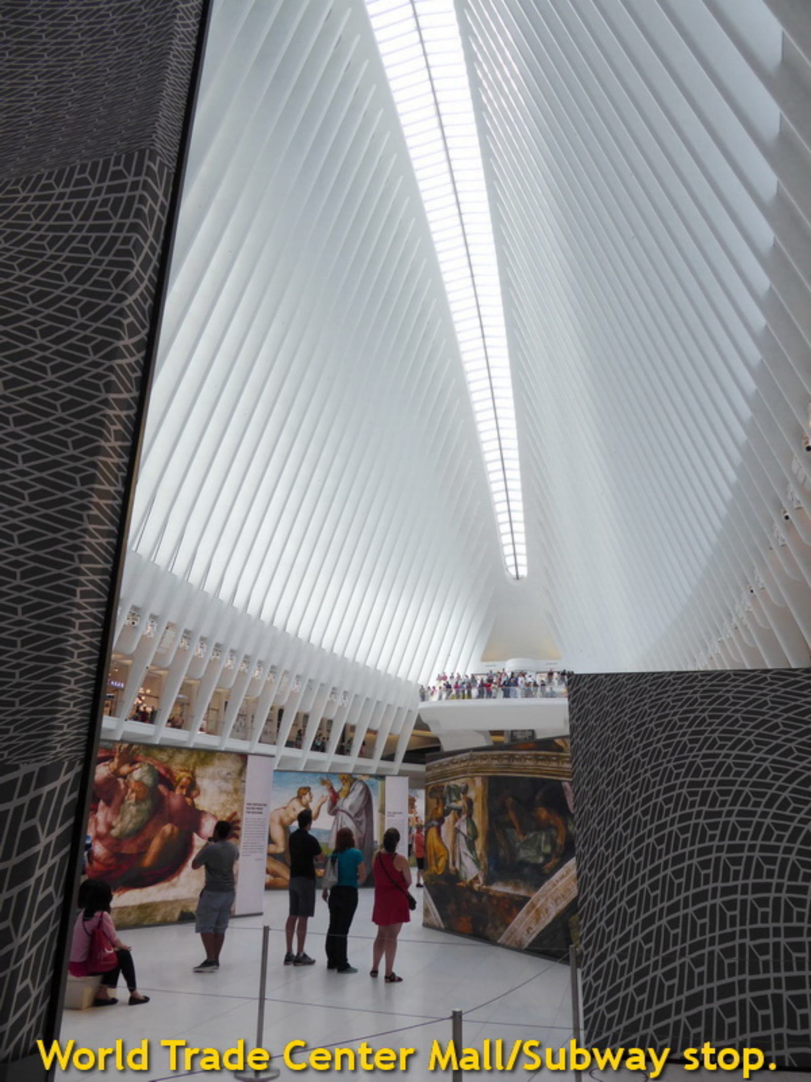
World Trade Center Mall/Subway stop.