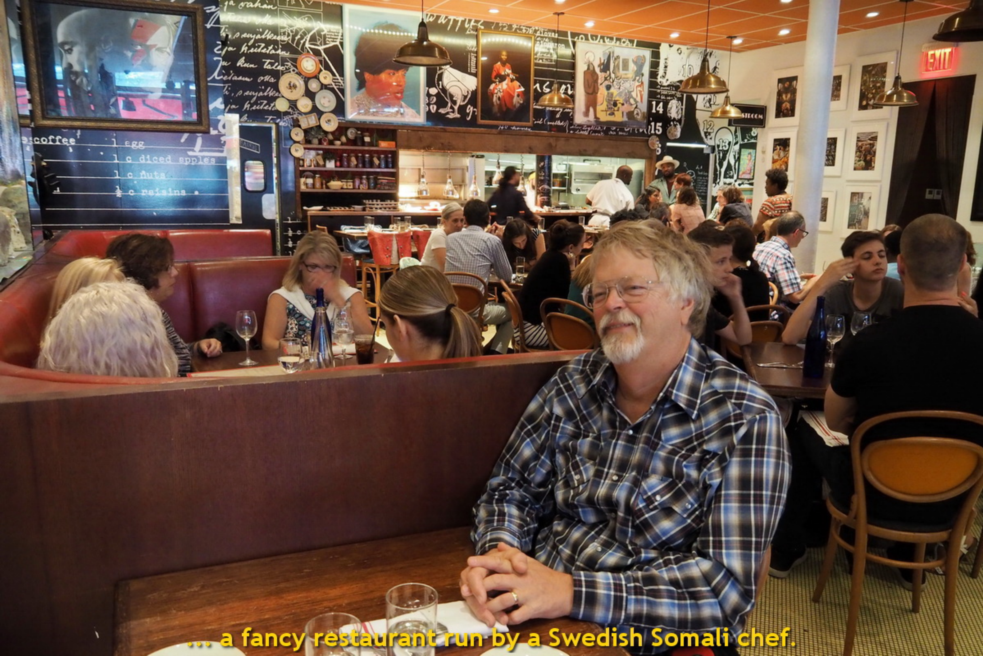
... a fancy restaurant run by a Swedish Somali chef.