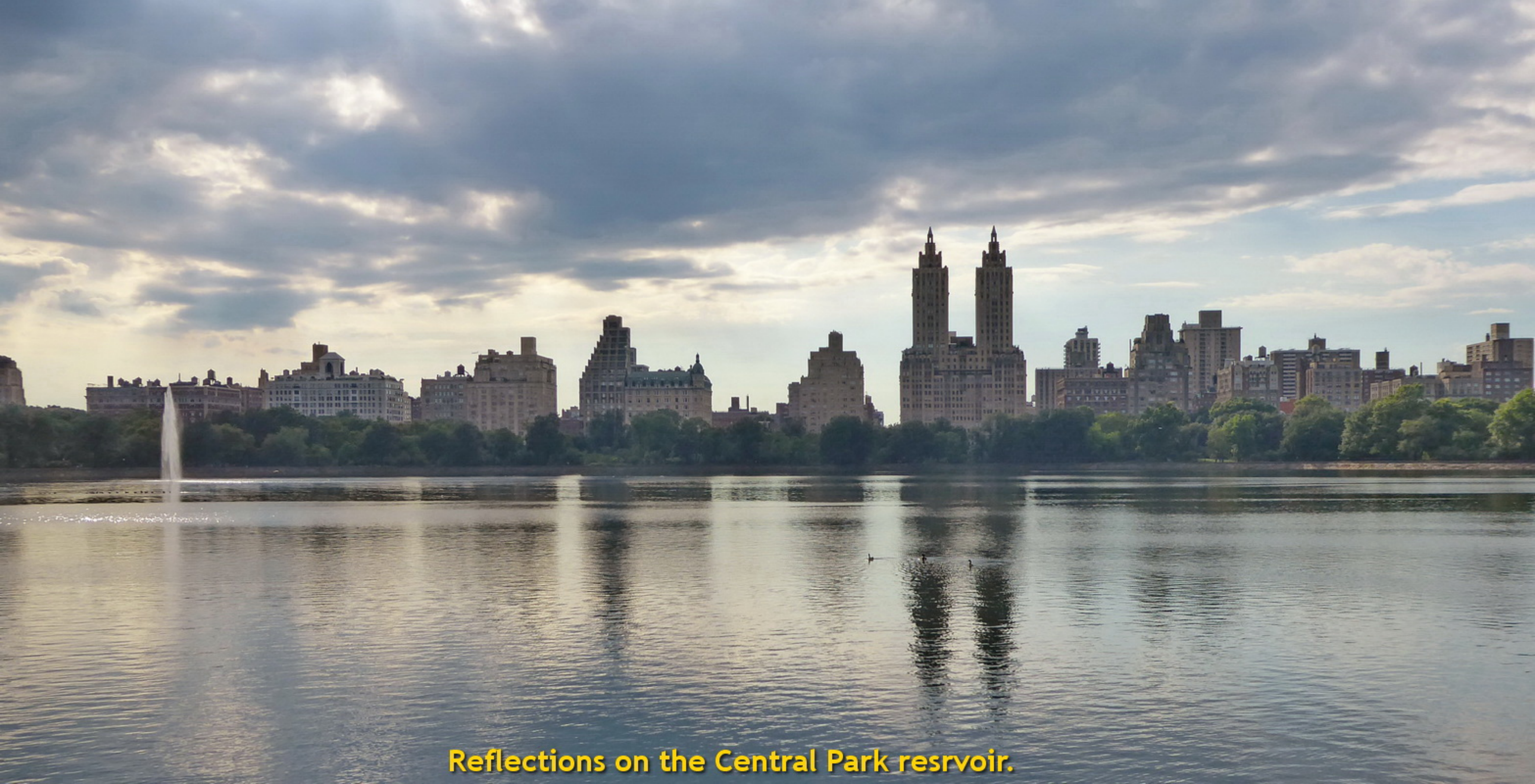
Reflections on the Central Park reservoir.