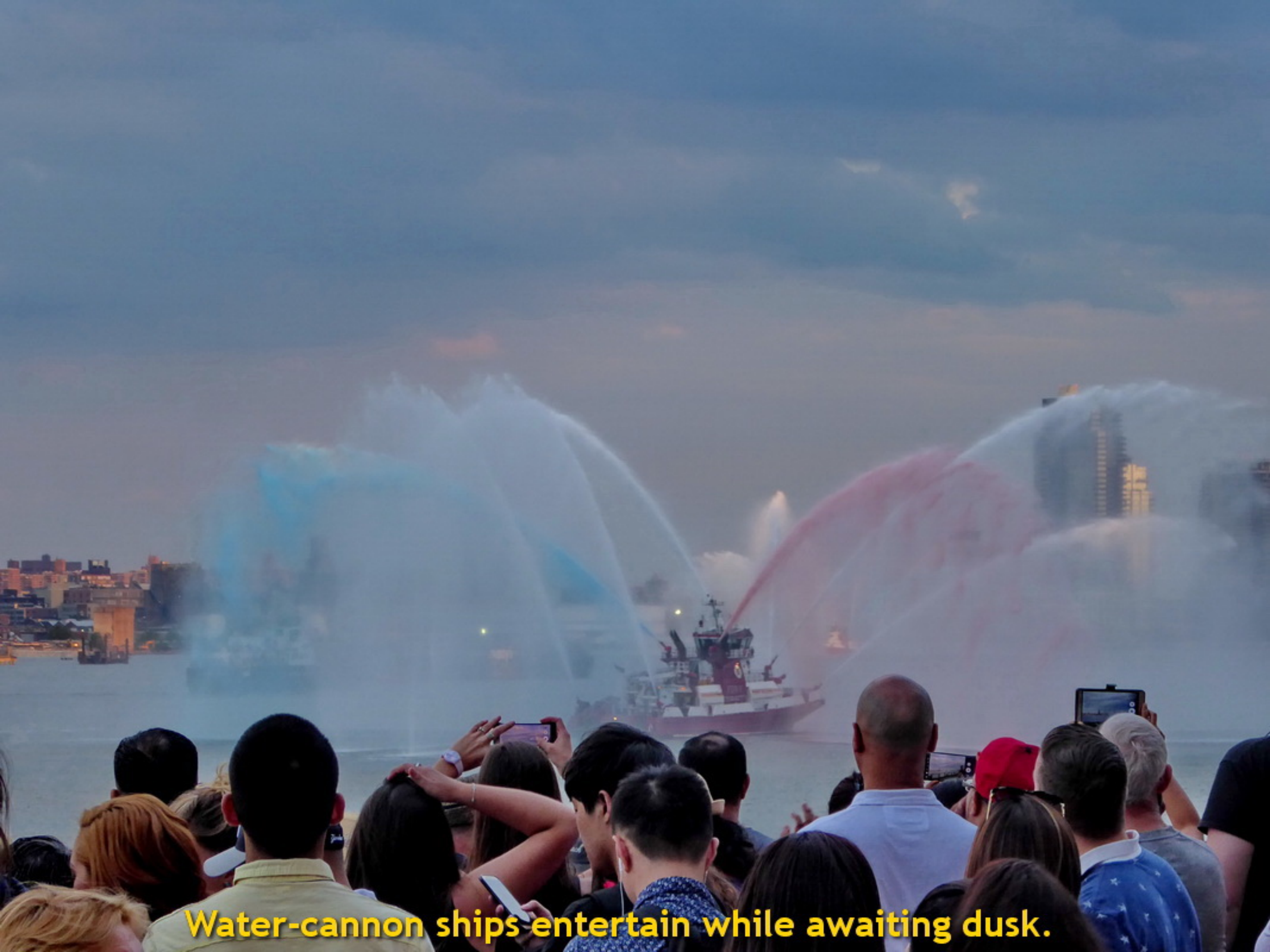
Water-cannon ships entertain while awaiting dusk.