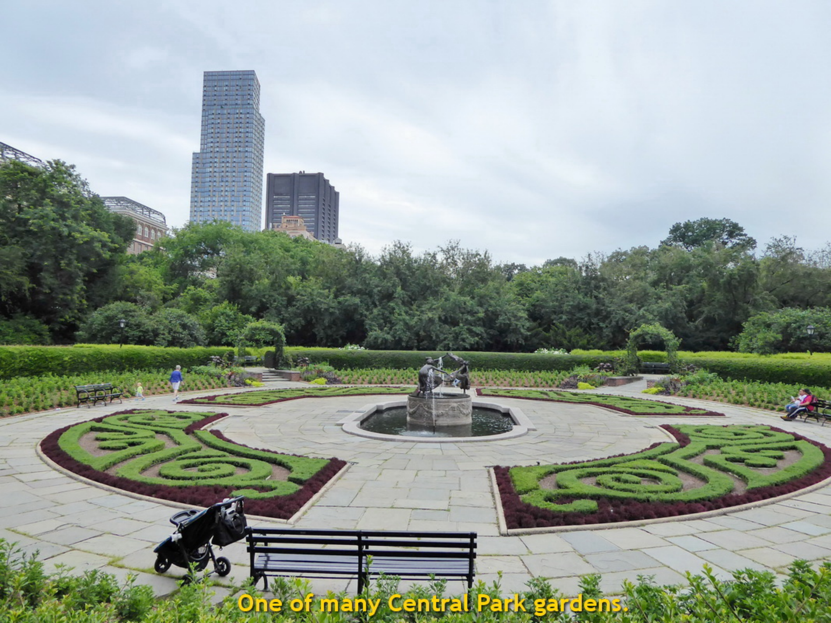
One of many Central Park gardens.