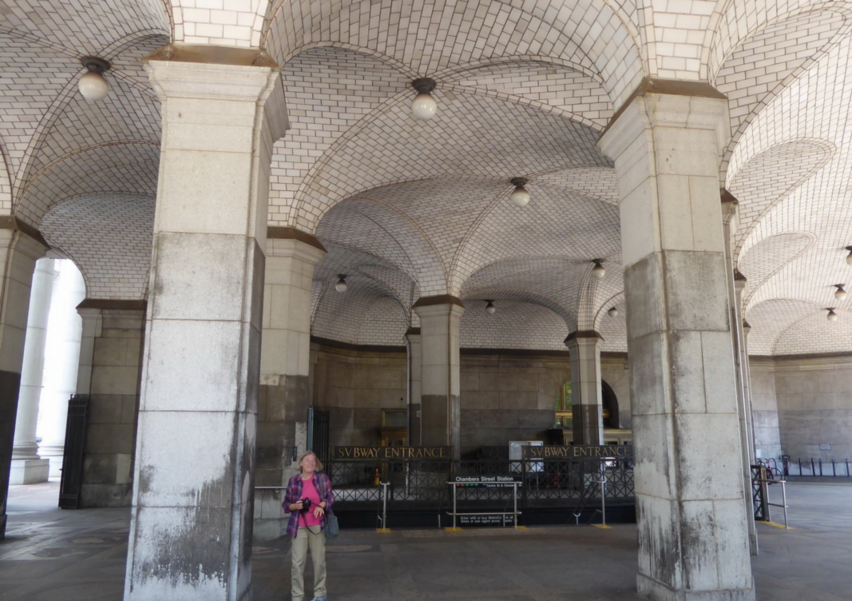
Other stations seem to date back to the Roman era,