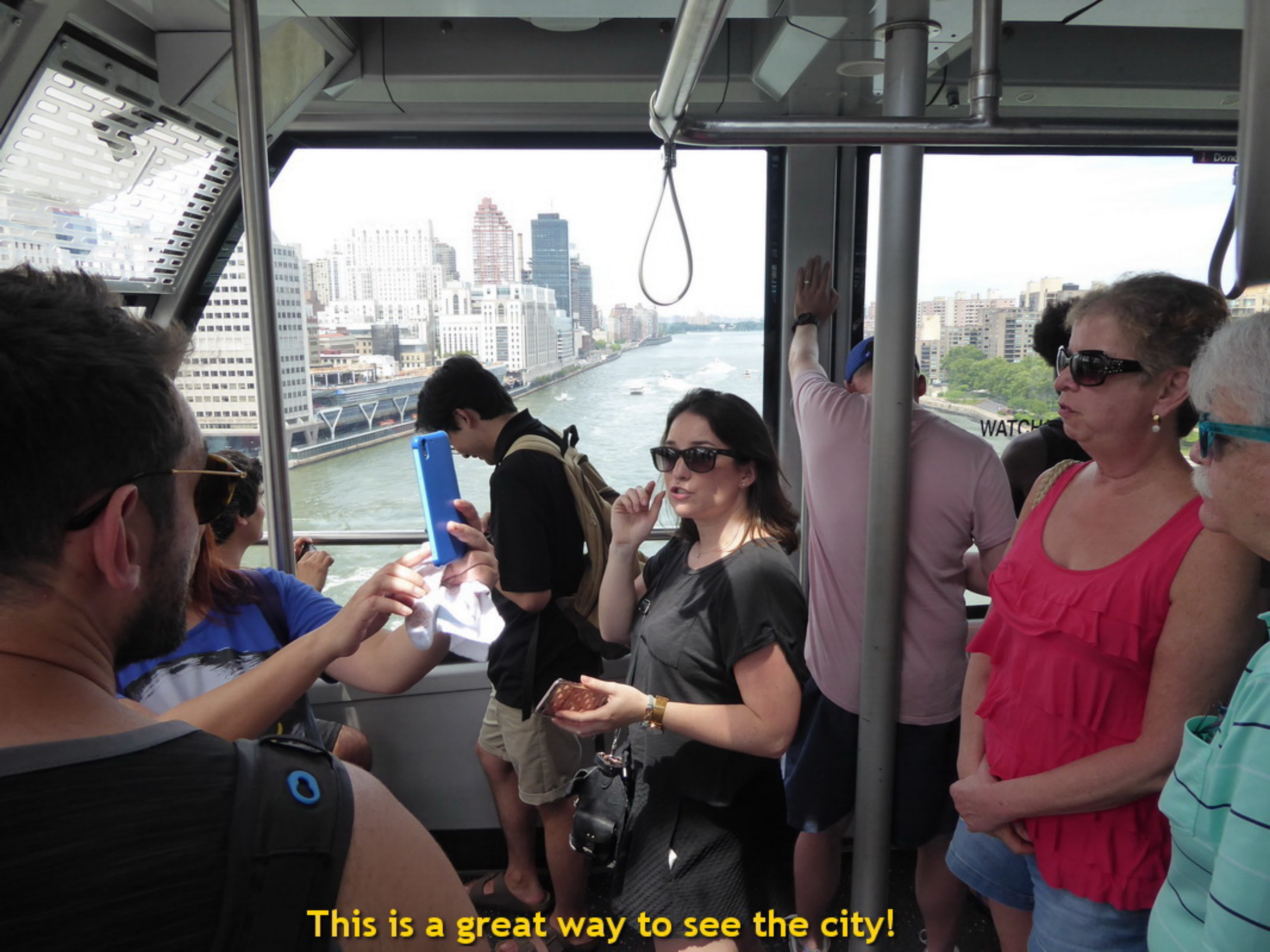
This is a great way to see the city!