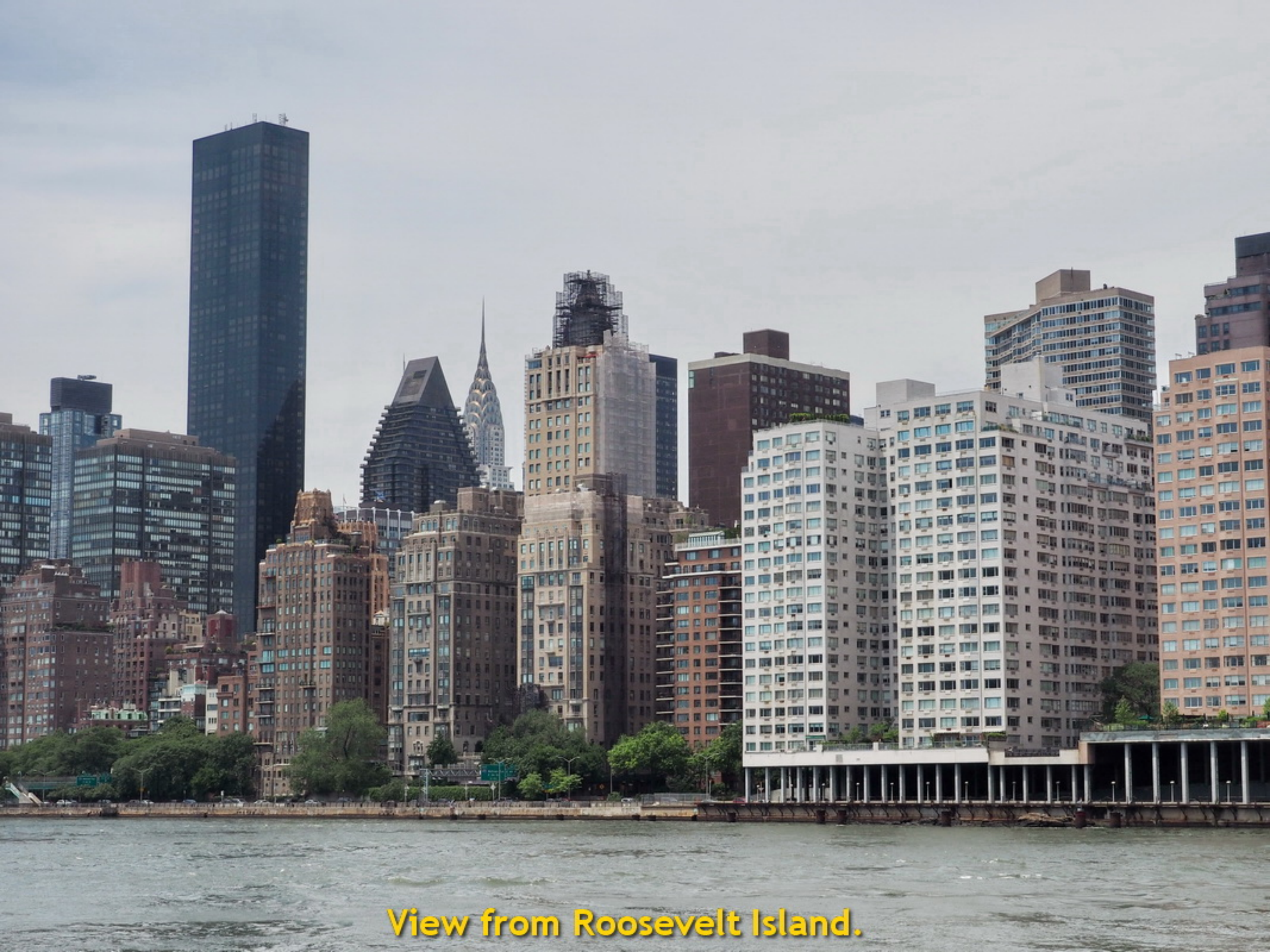
View from Roosevelt Island.