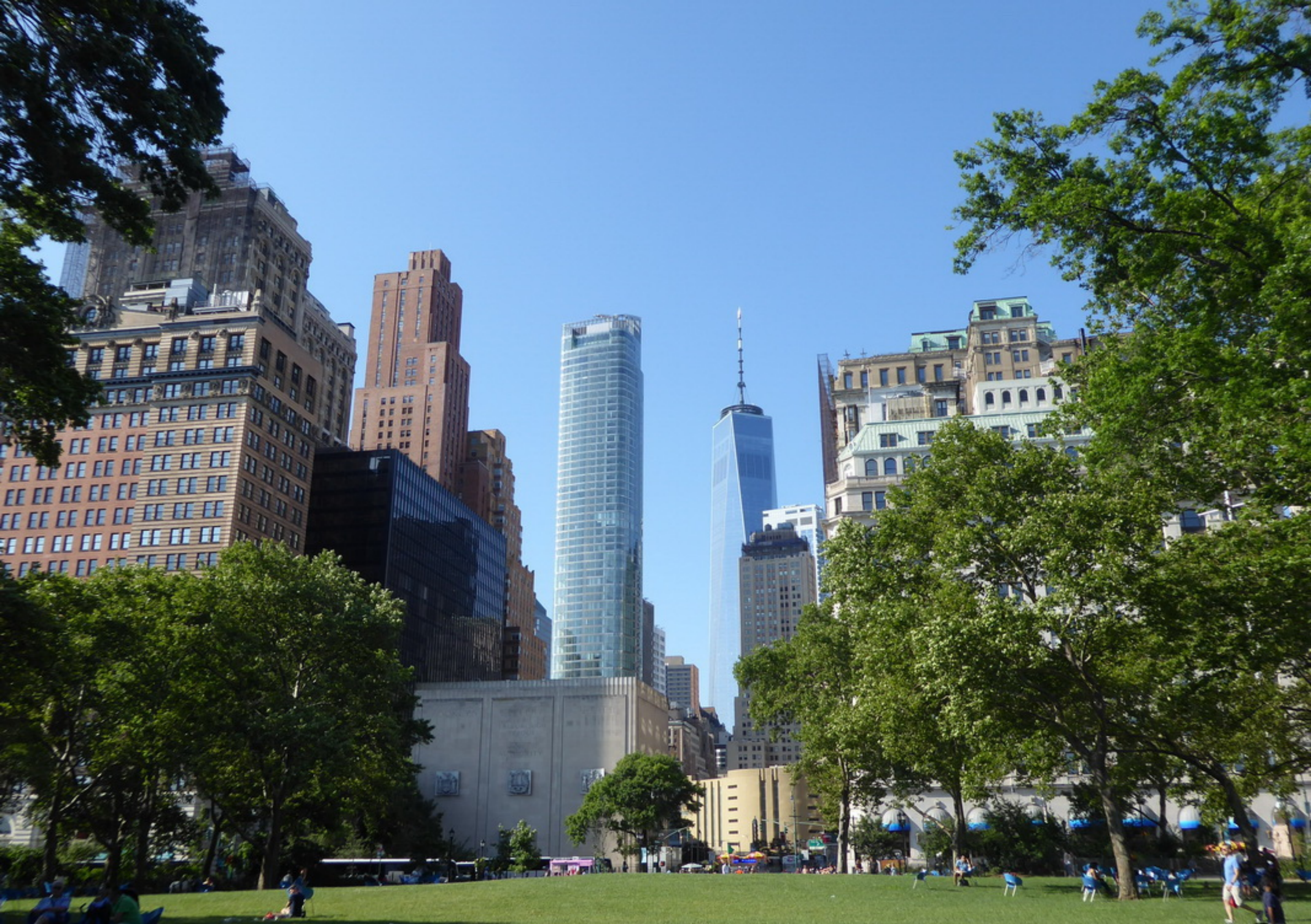
View from Battery Park.