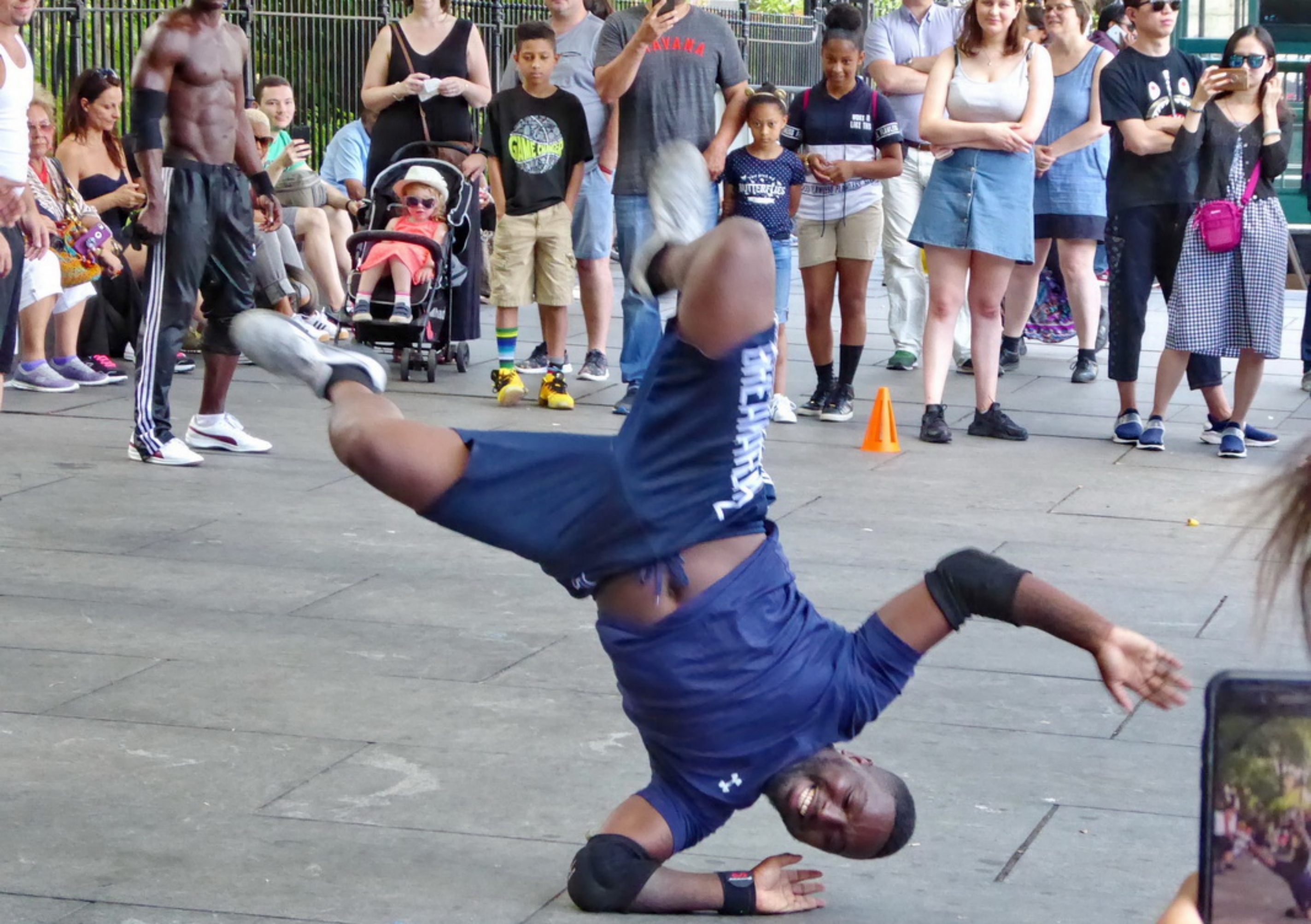
Come across an impromptu street-dance performance...