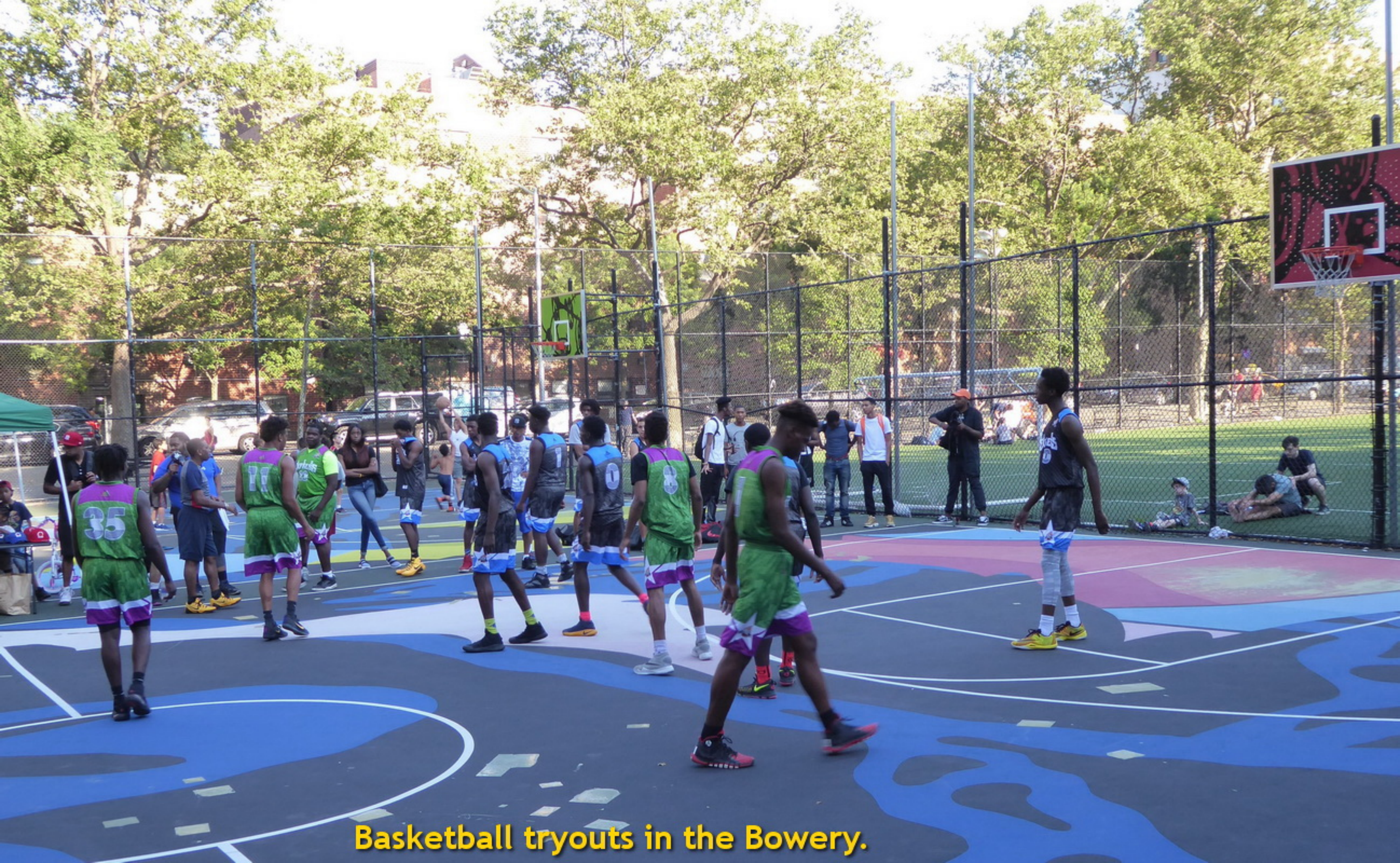
Basketball tryouts in the Bowery.