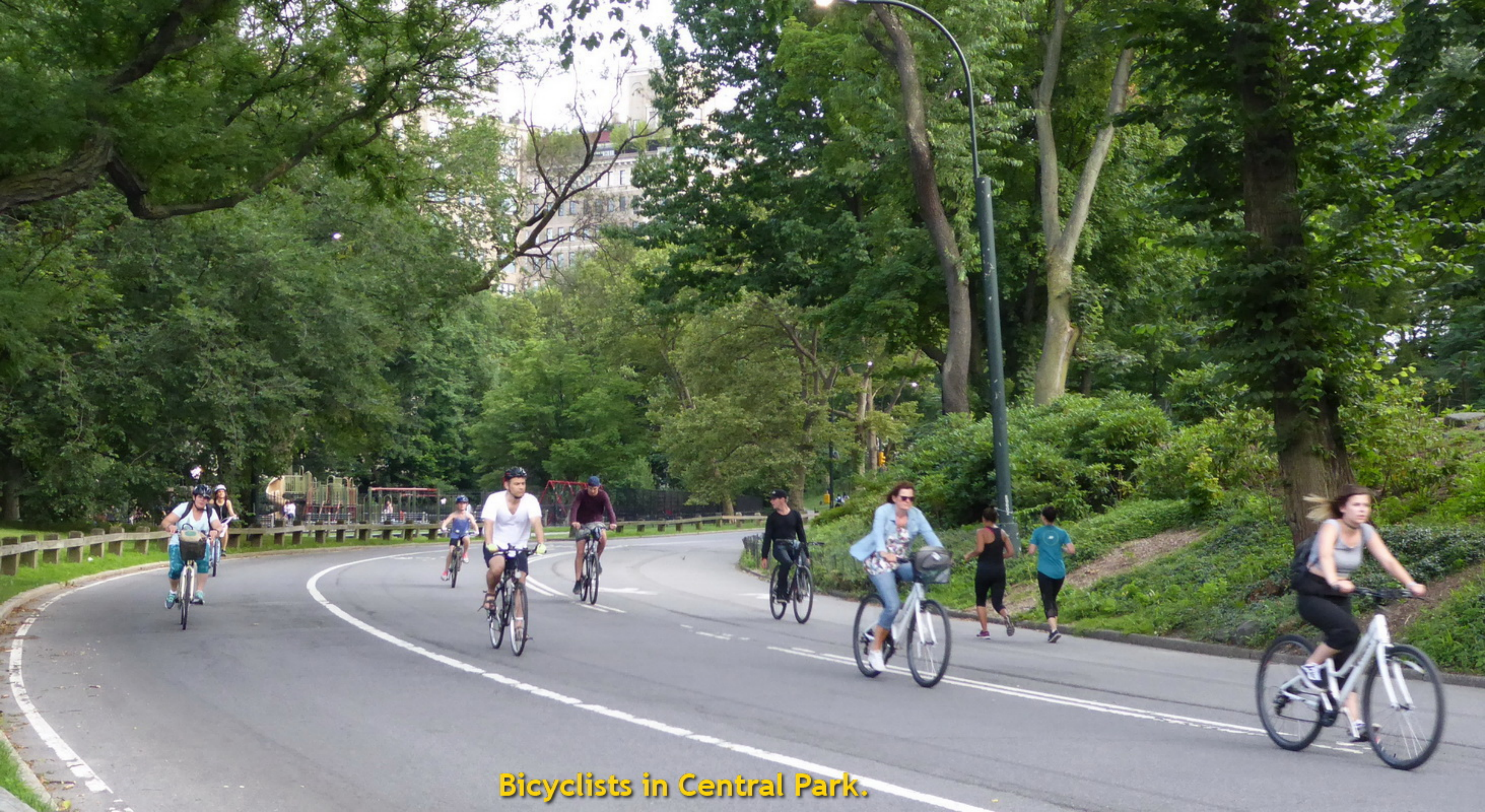
Bicyclists in Central Park.