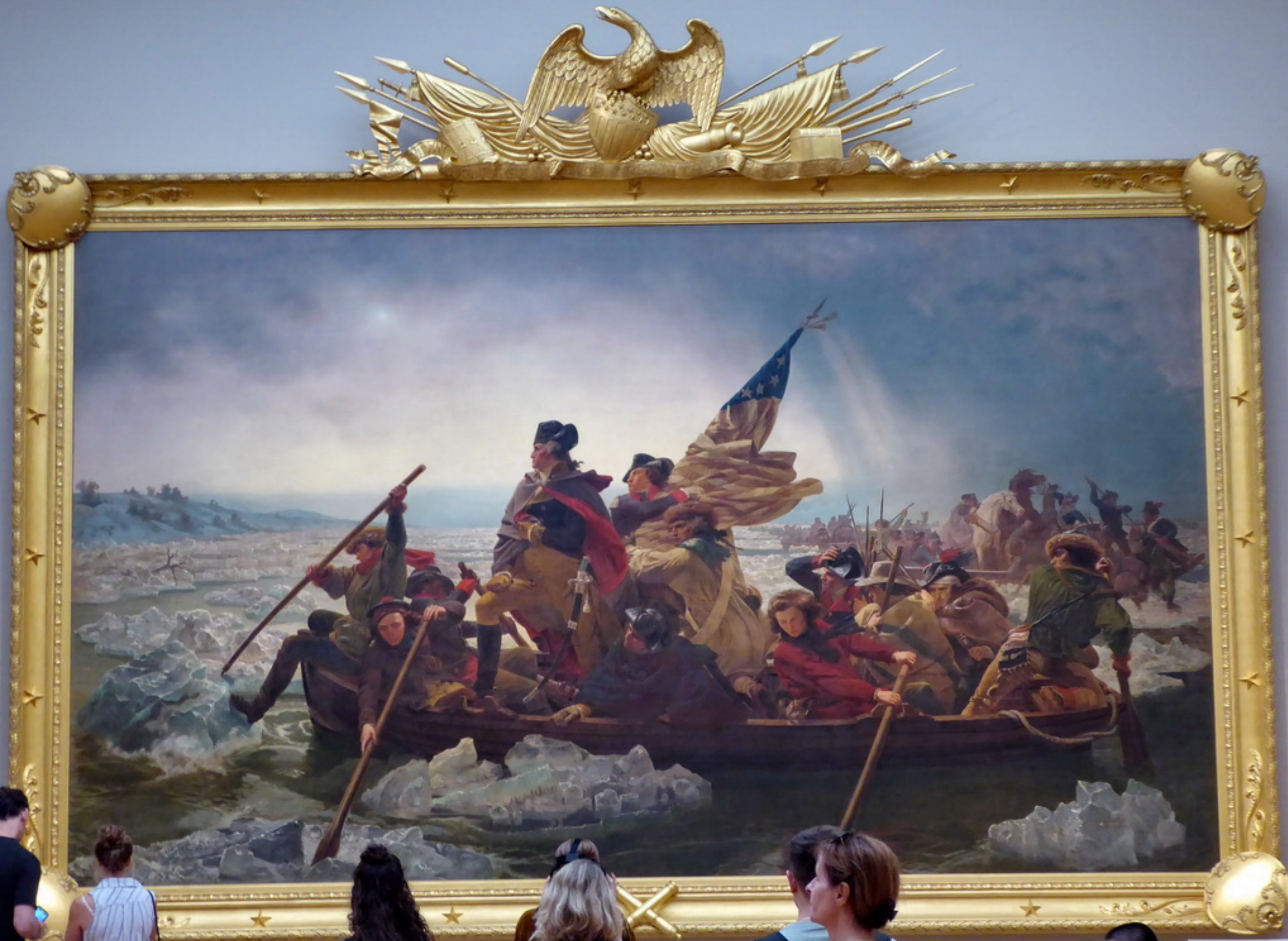
"Washington Crossing the Delaware" (!)