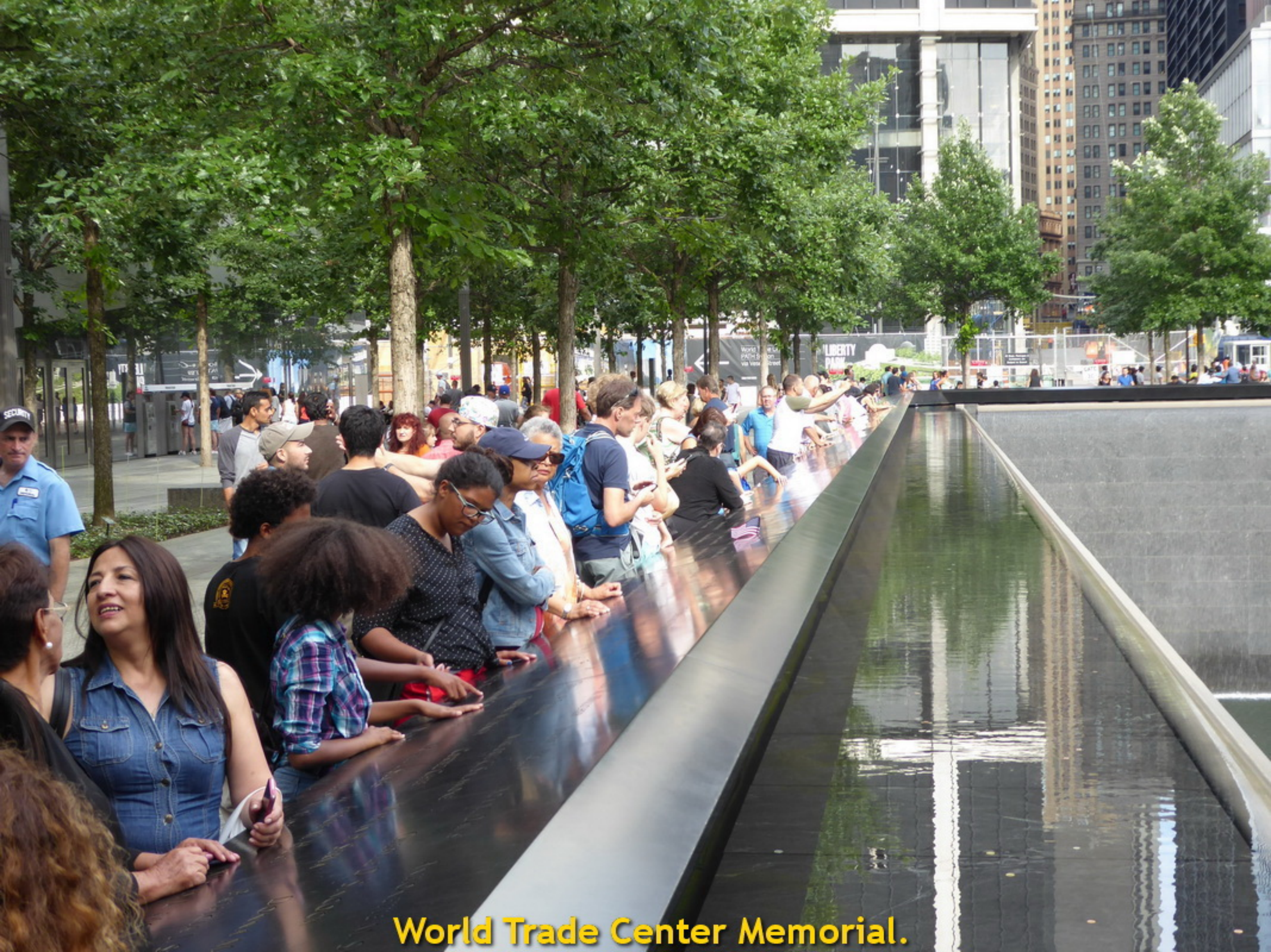
World Trade Center Memorial.