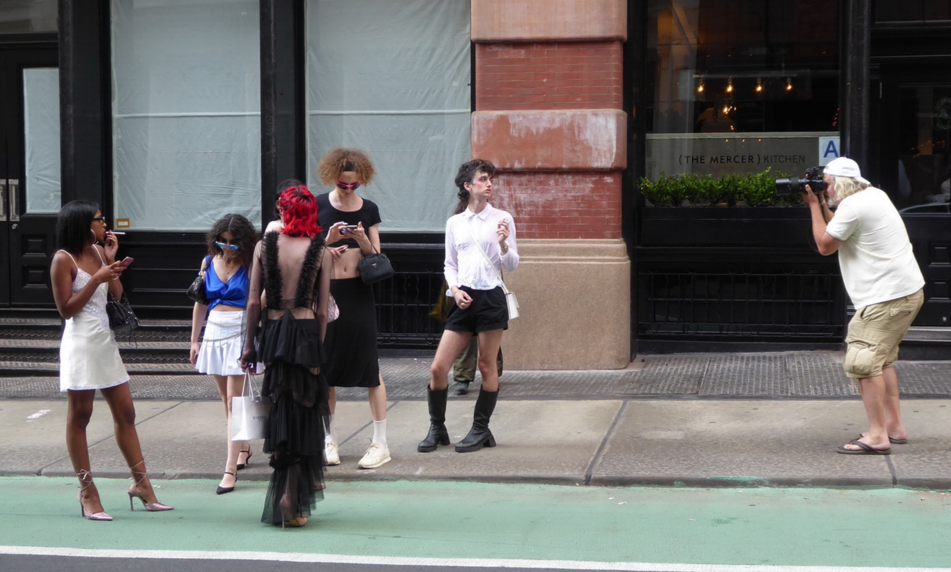
A sidewalk photo-shoot.