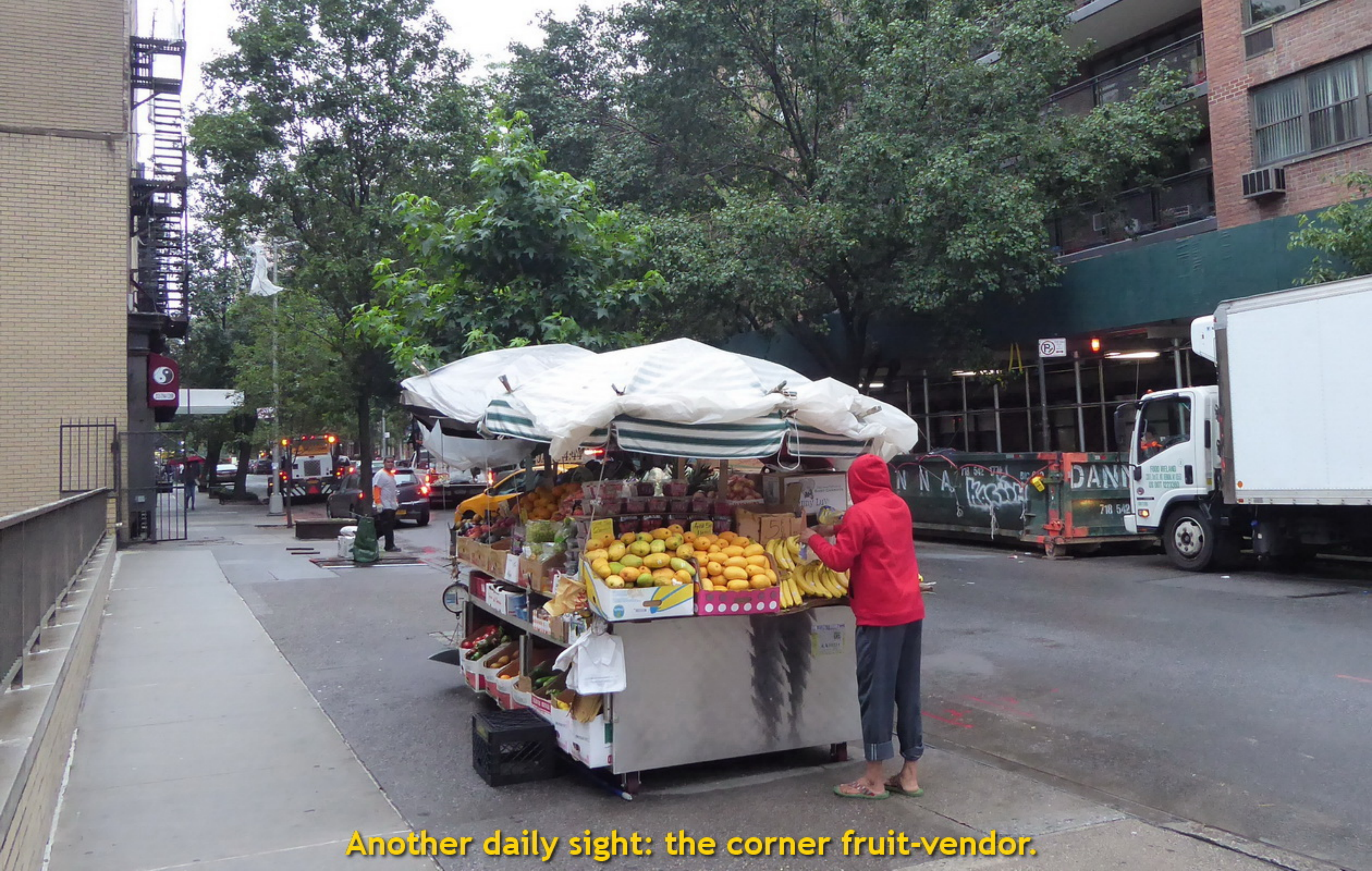
Another daily sight: the corner fruit-vendor.