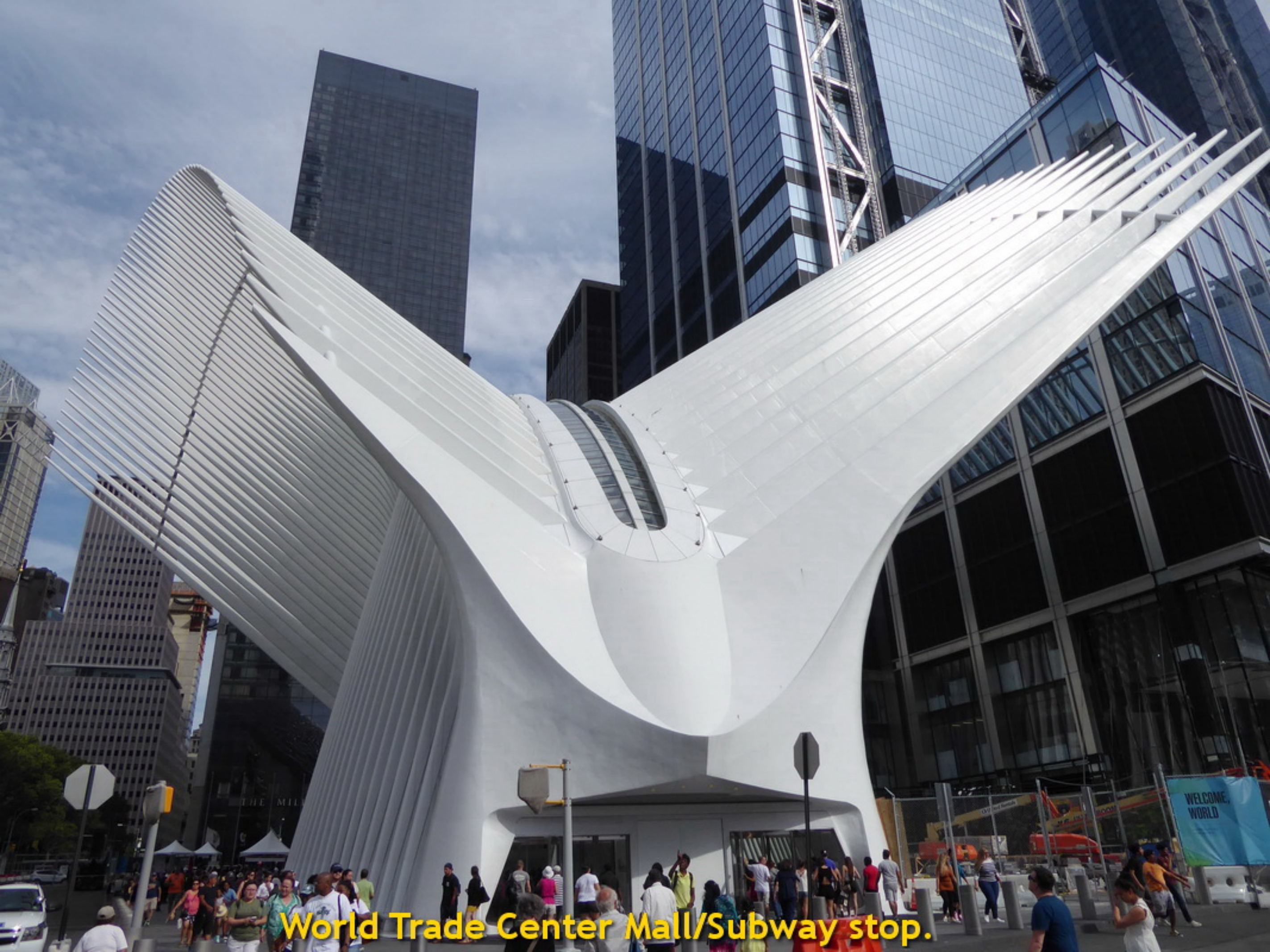
World Trade Center Mall/Subway stop.