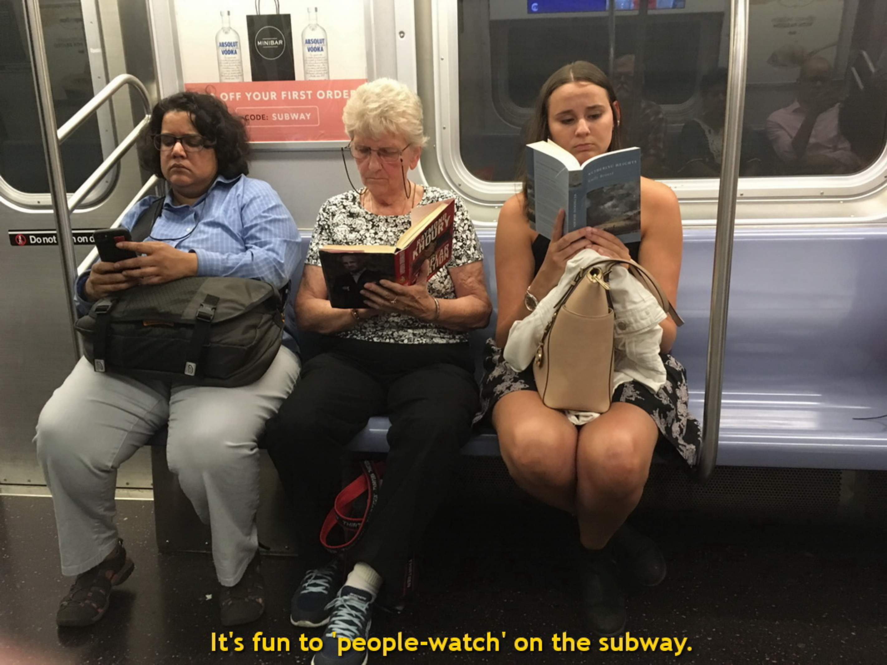
It's fun to 'people-watch' on the subway.