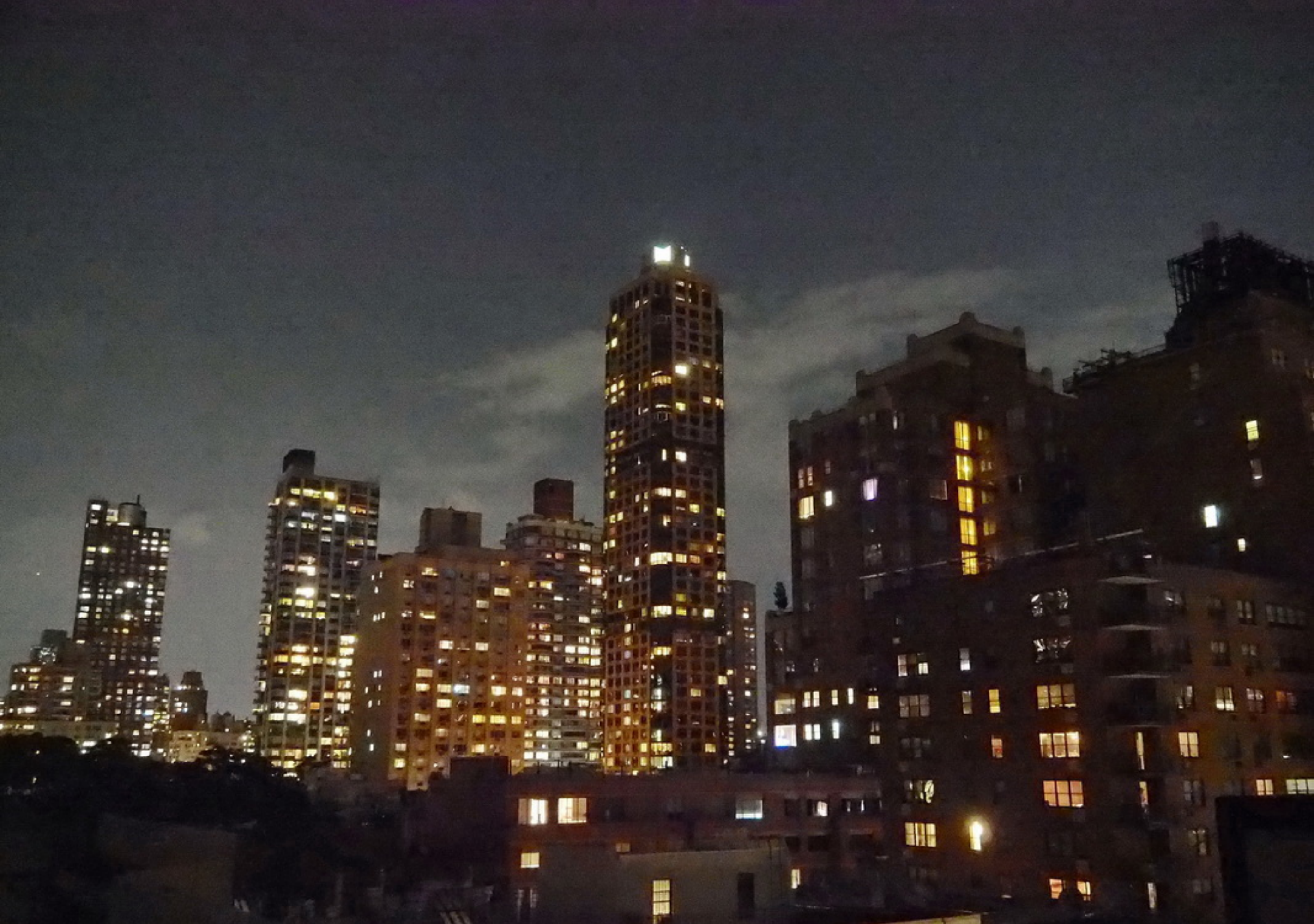
The night-time view from the roof of our place.