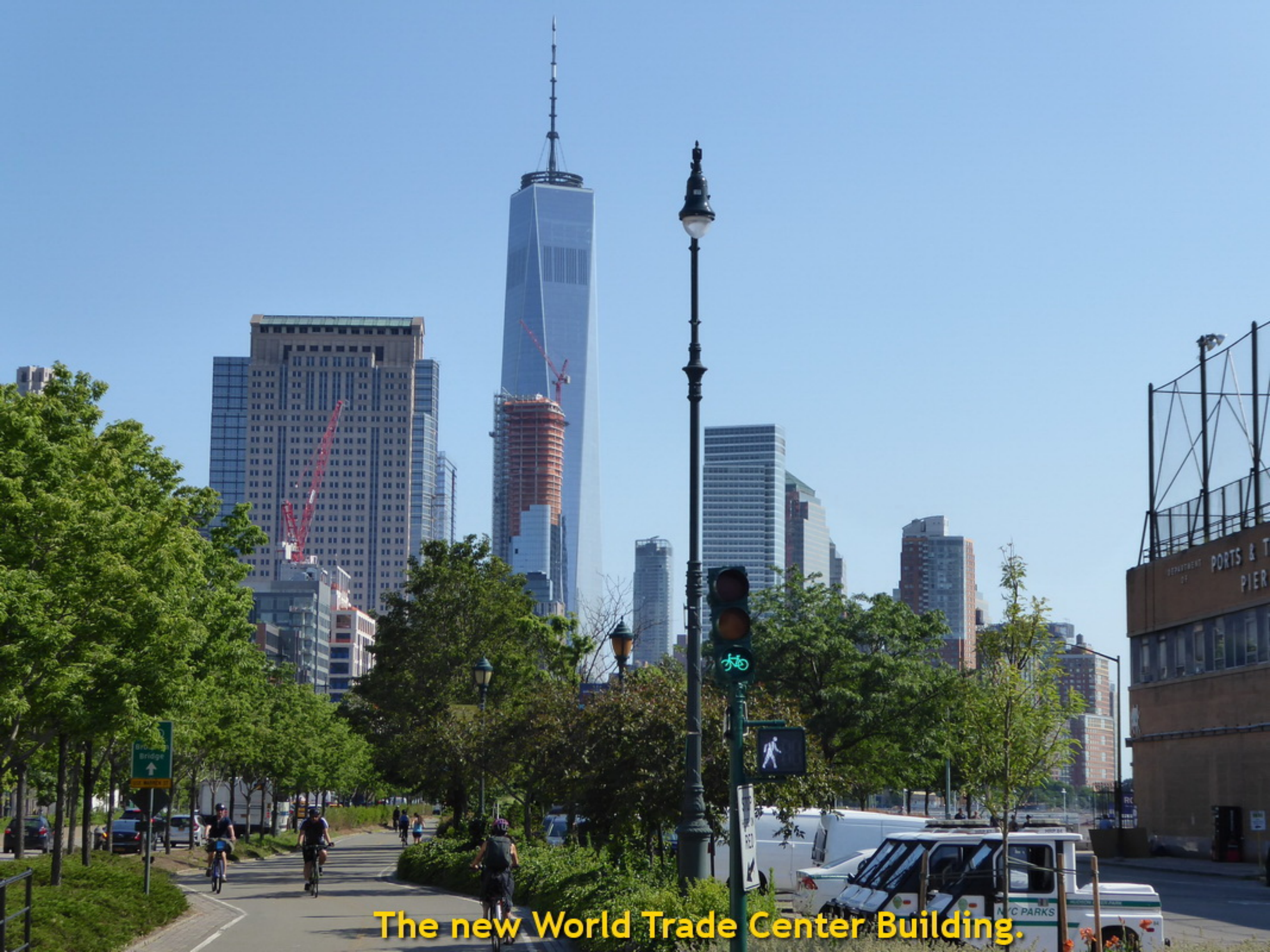
The new World Trade Center Building.