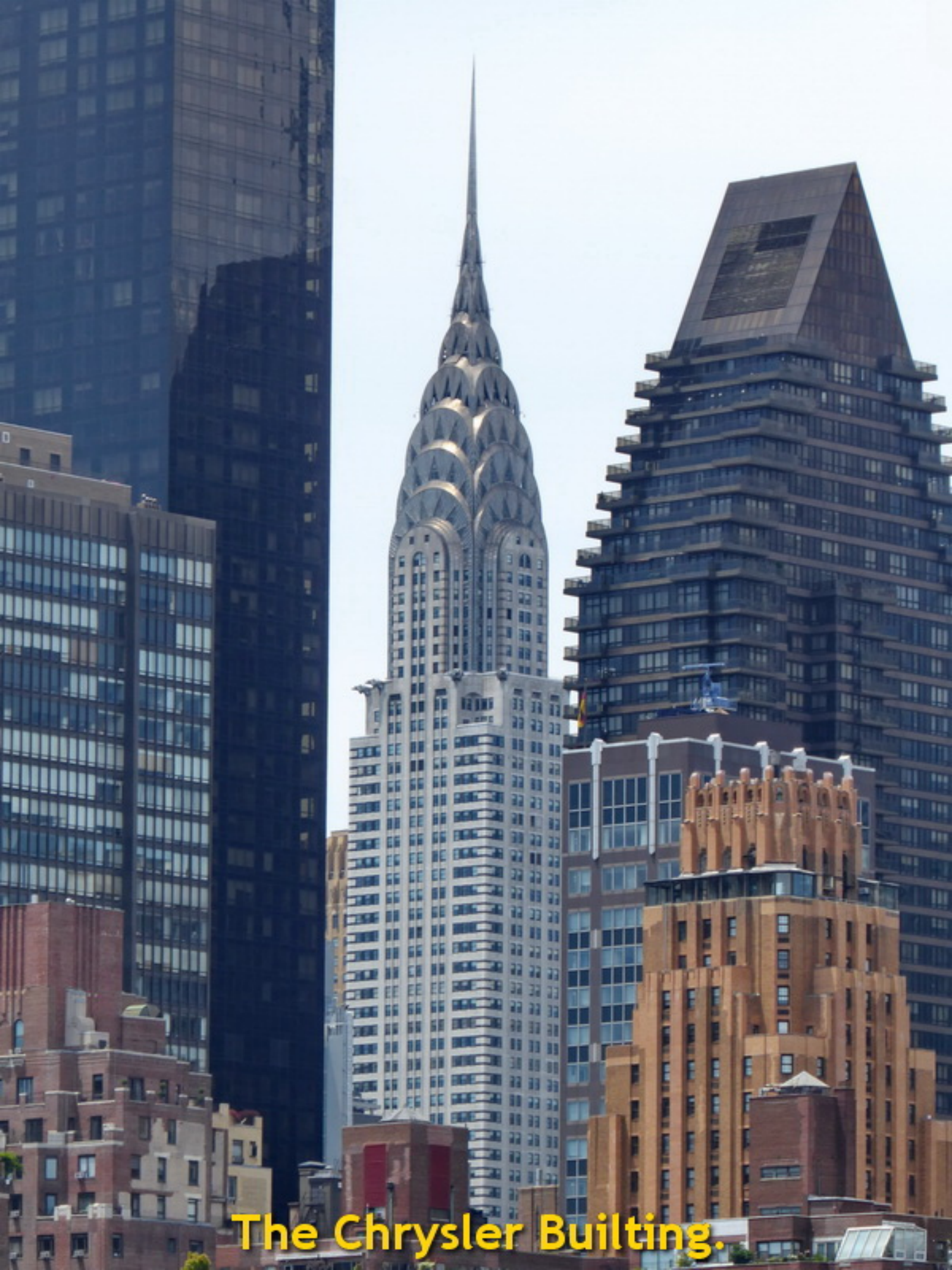
The Chrysler Building.