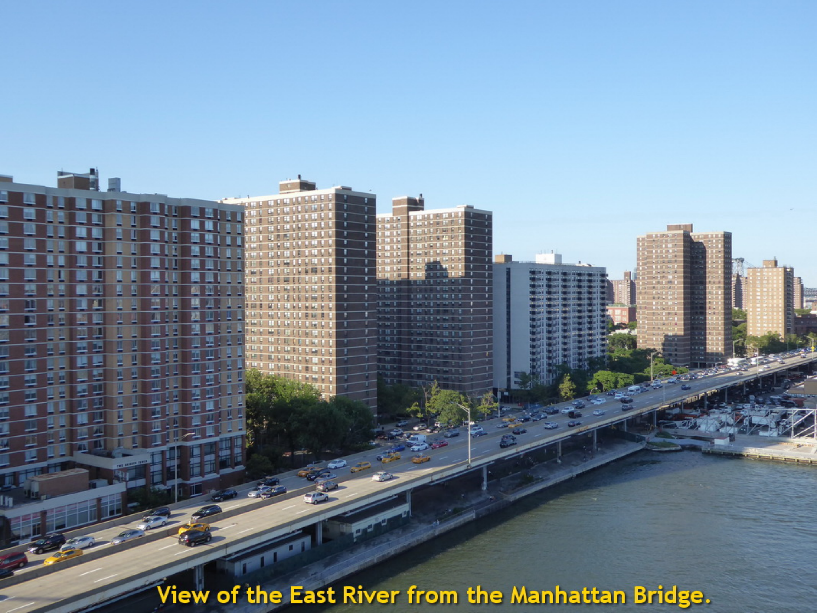
View of the East River from the Manhattan Bridge.