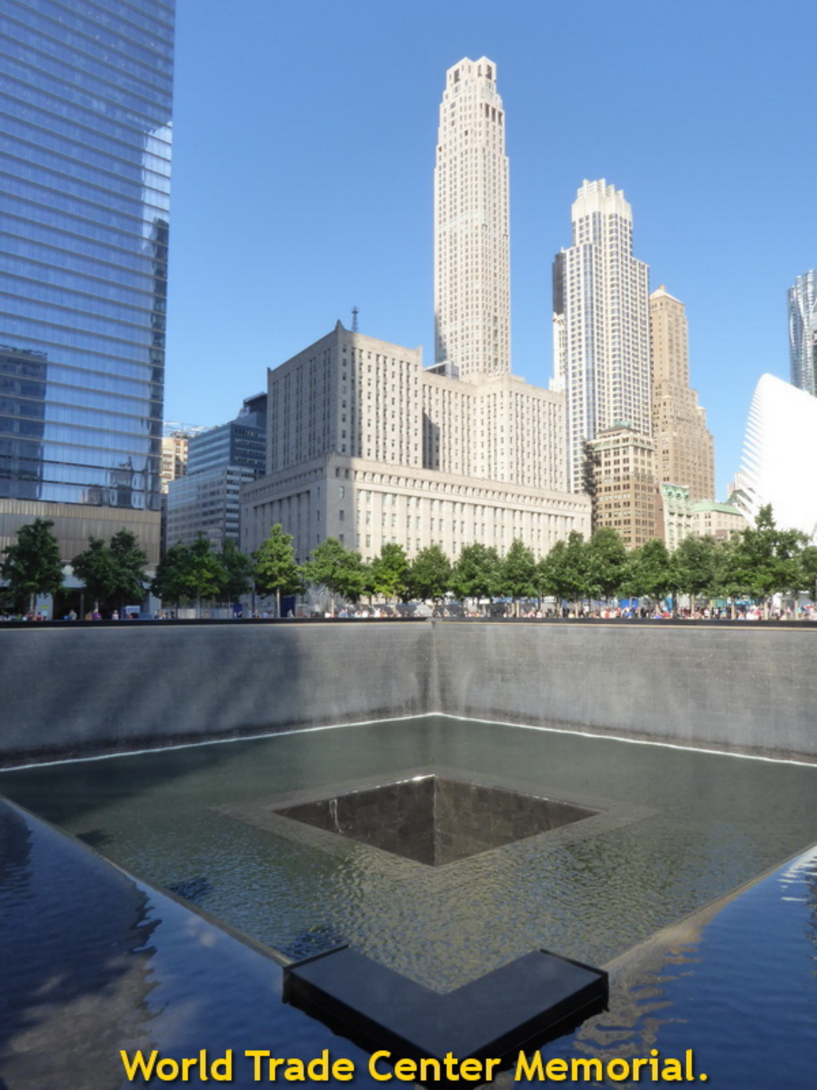
World Trade Center Memorial.