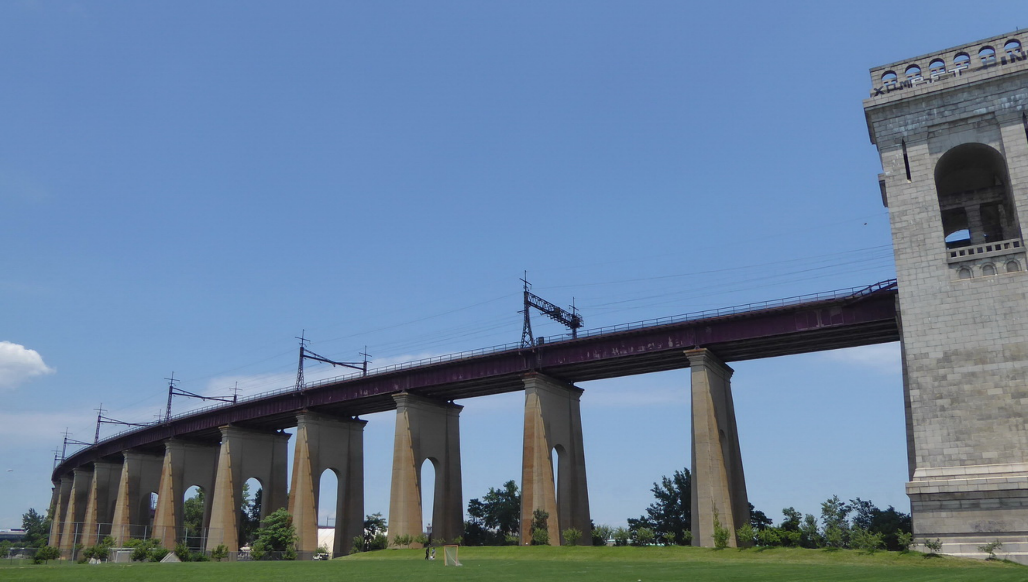
Train tracks to the "Hell Gate Bridge".