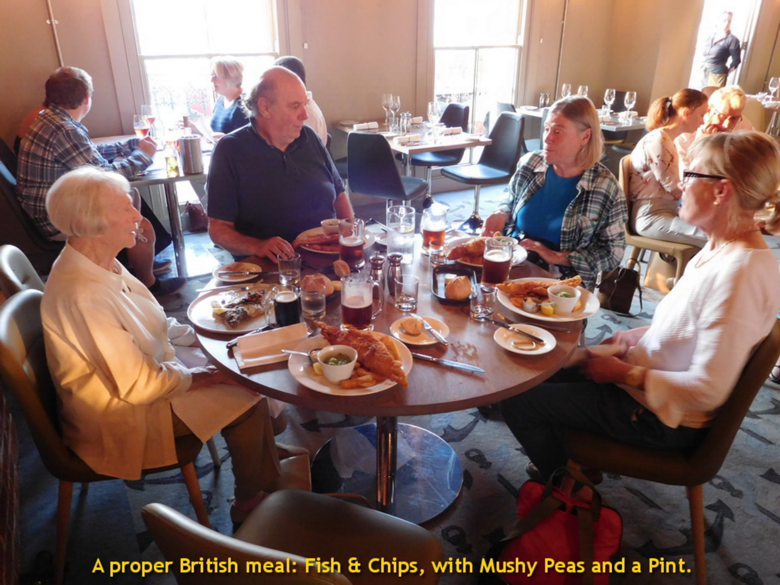
A proper British meal: Fish & Chips, with Mushy Peas and a Pint.