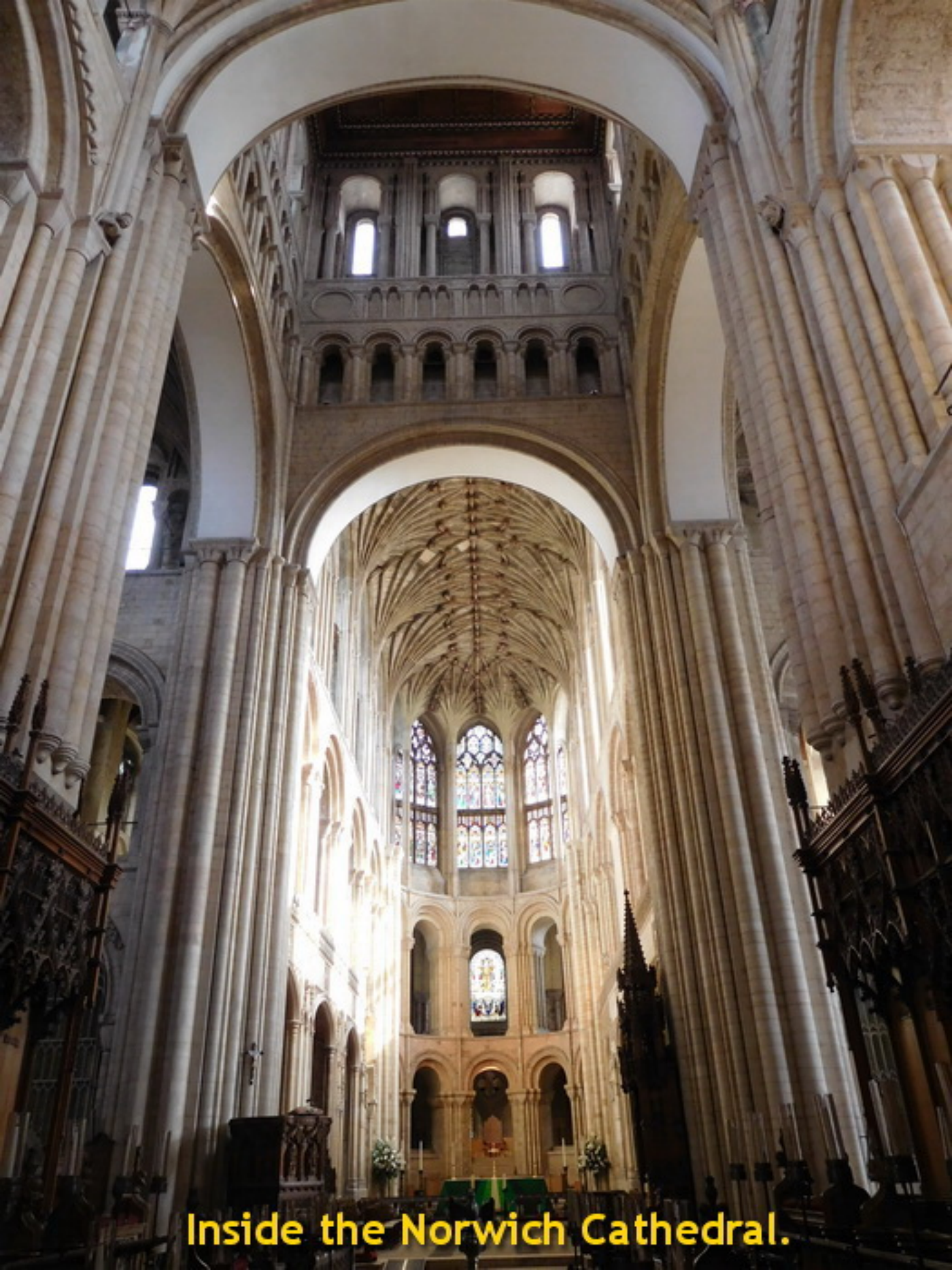
Inside the Norwich Cathedral.