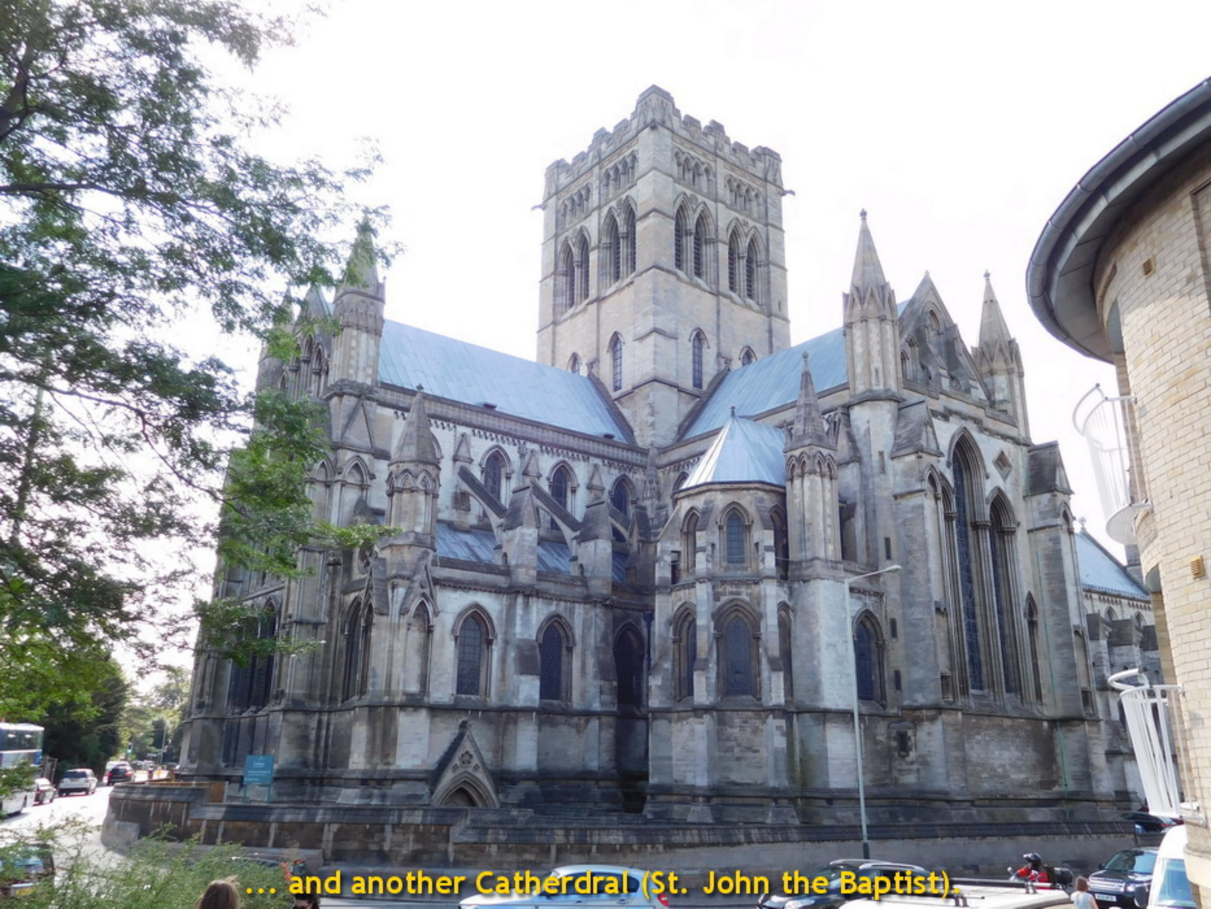
... and another Cathedral (St. John the Baptist).