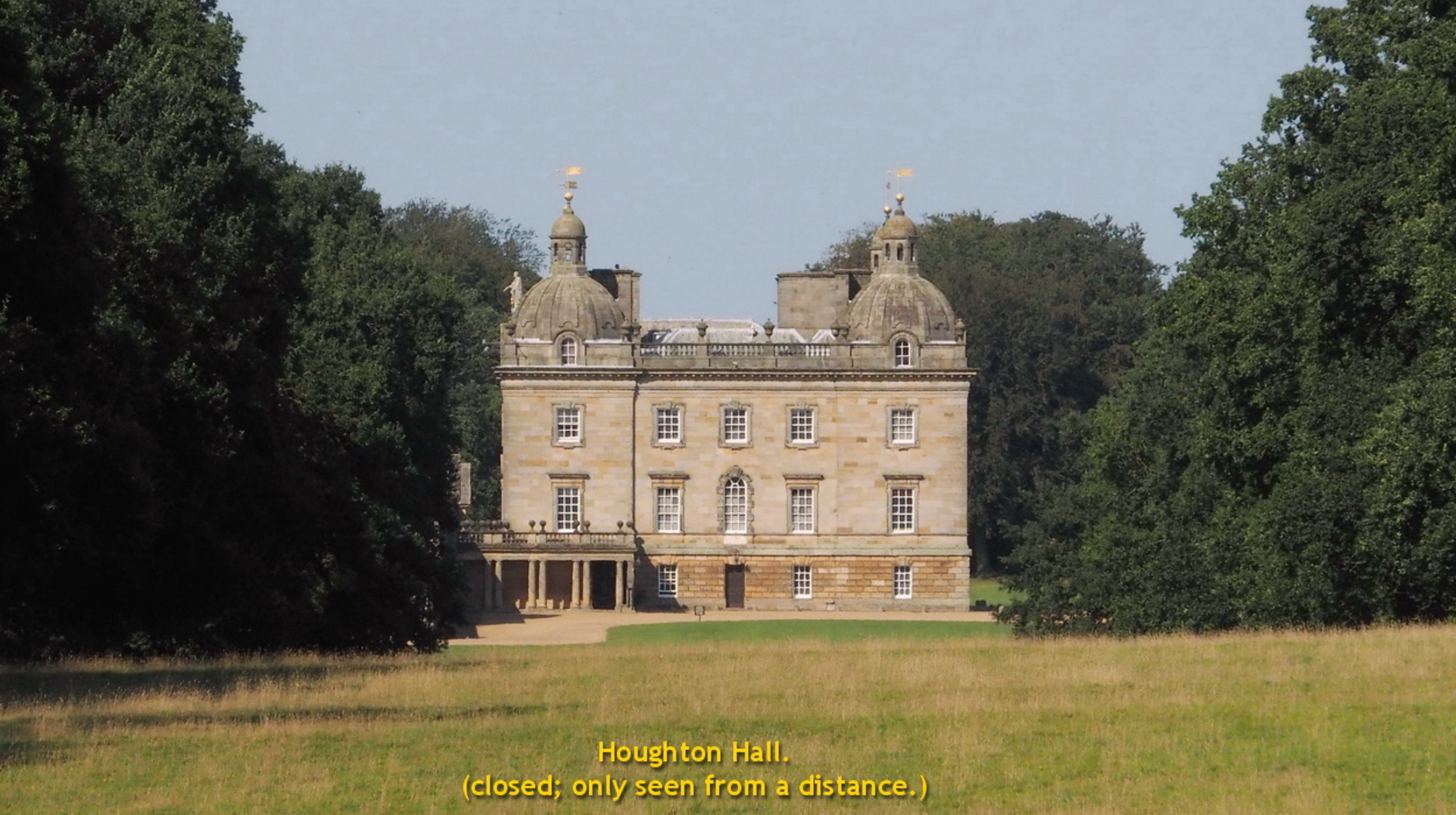
Houghton Hall. (closed; only seen from a distance.)