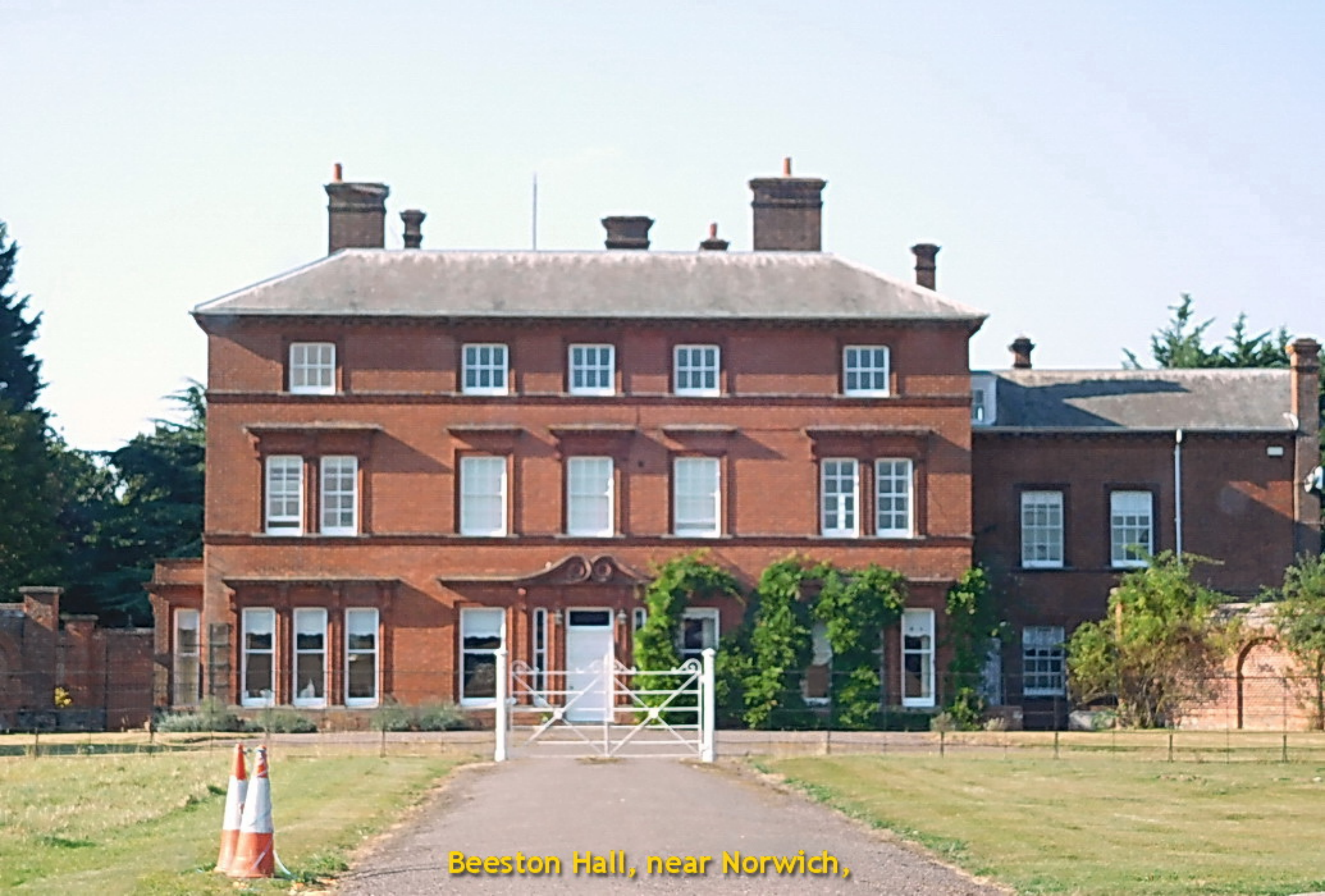
Beeston Hall, near Norwich,