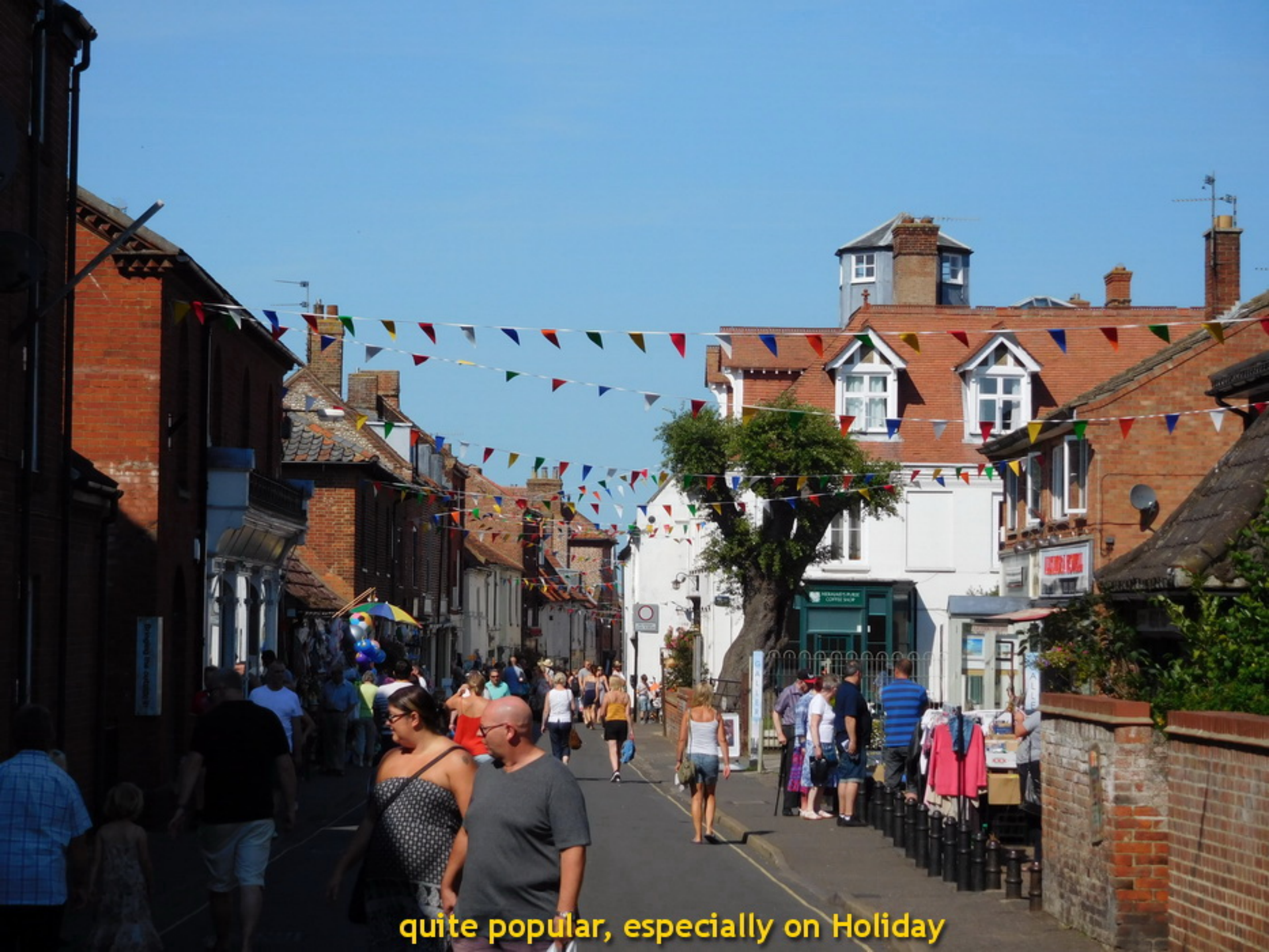
quite popular, especially on Holiday