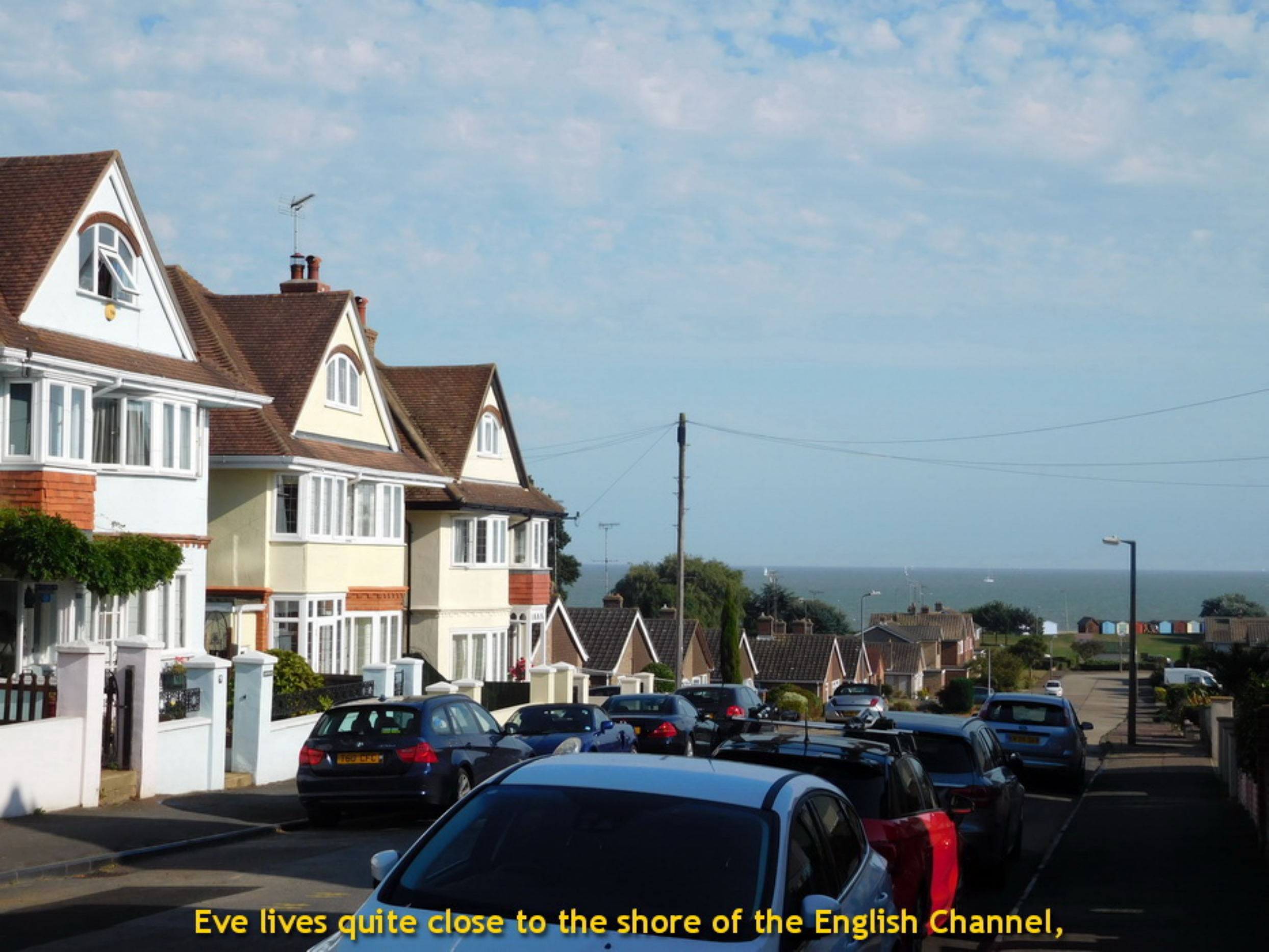
Eve lives quite close to the shore of the English Channel,