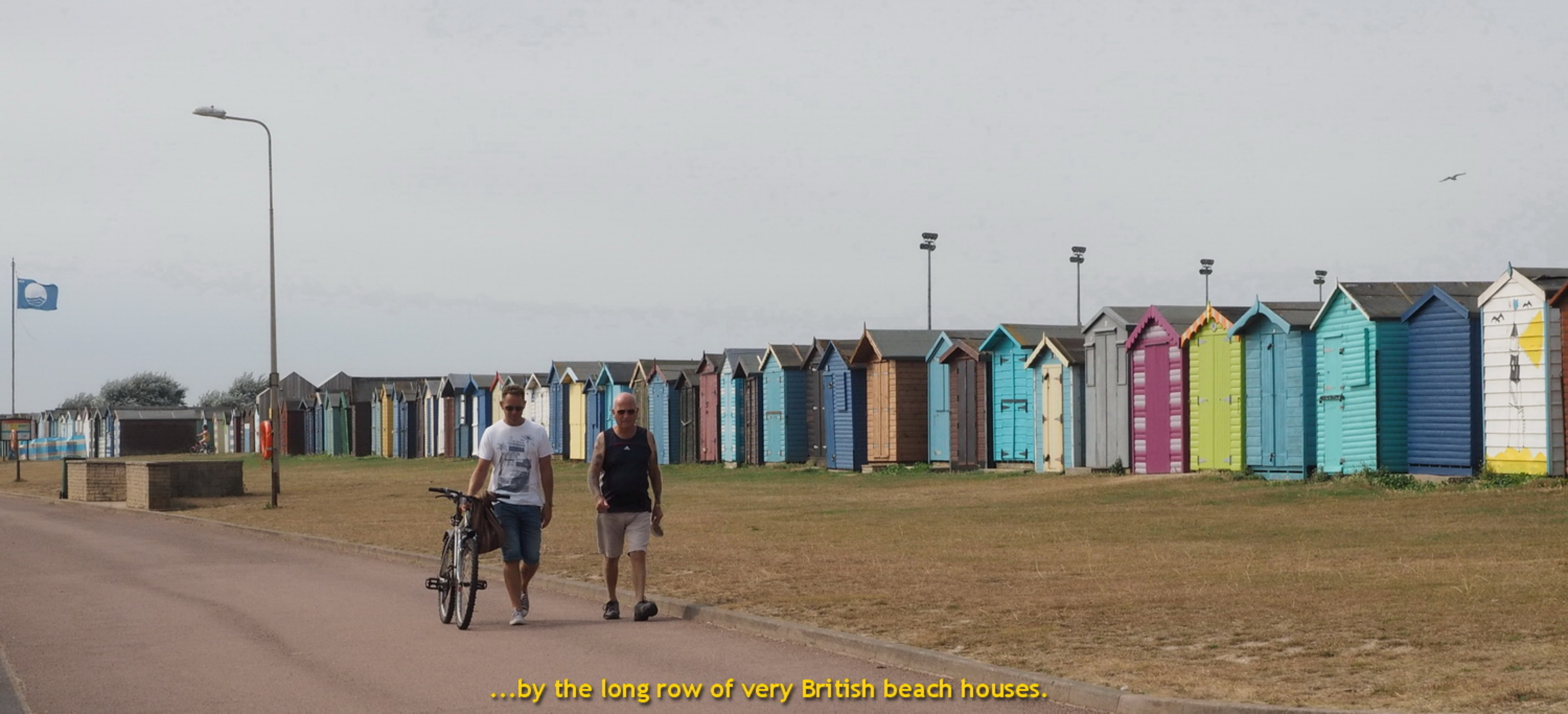
...by the long row of very British beach houses.