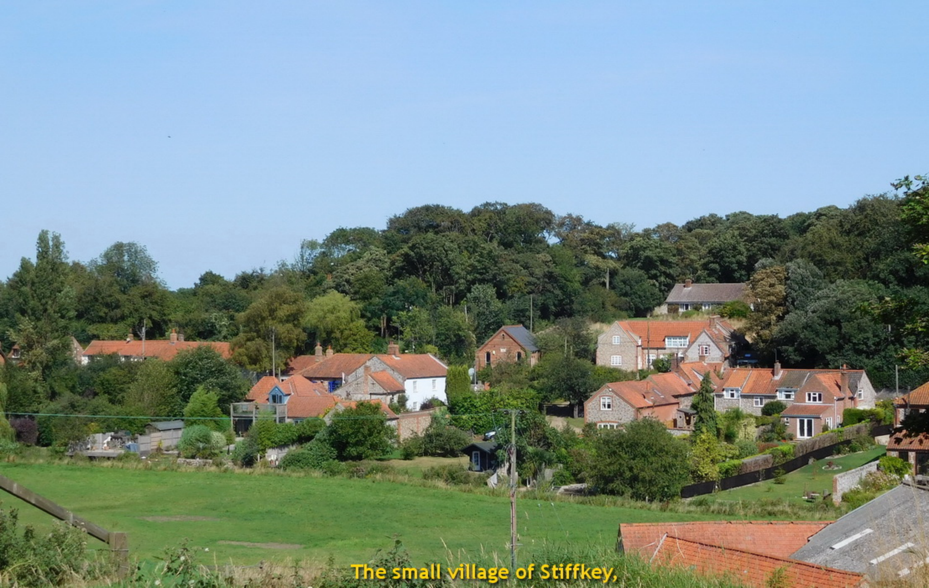
The small village of Stiffkey,