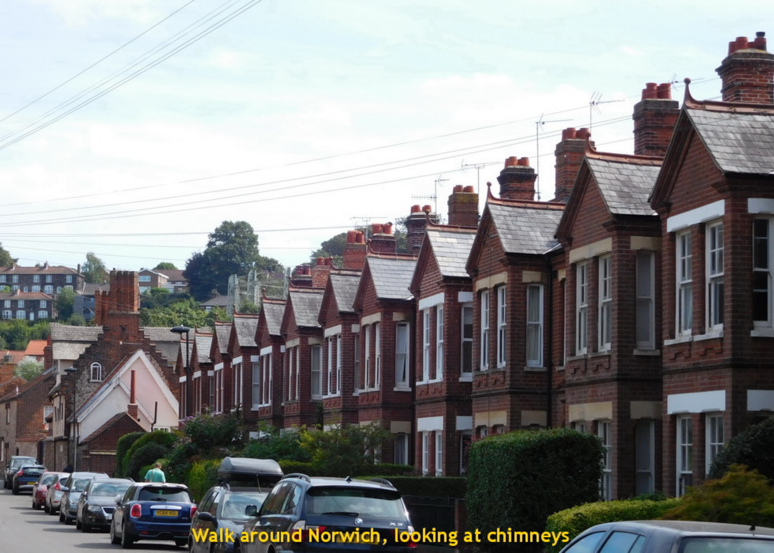
Walk around Norwich, looking at chimneys