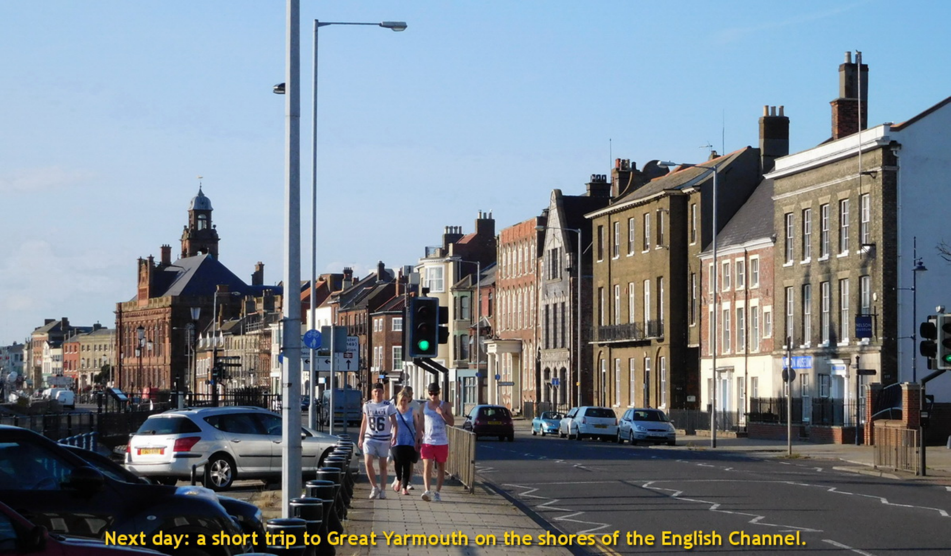
Next day: a short trip to Great Yarmouth on the shores of the English Channel.