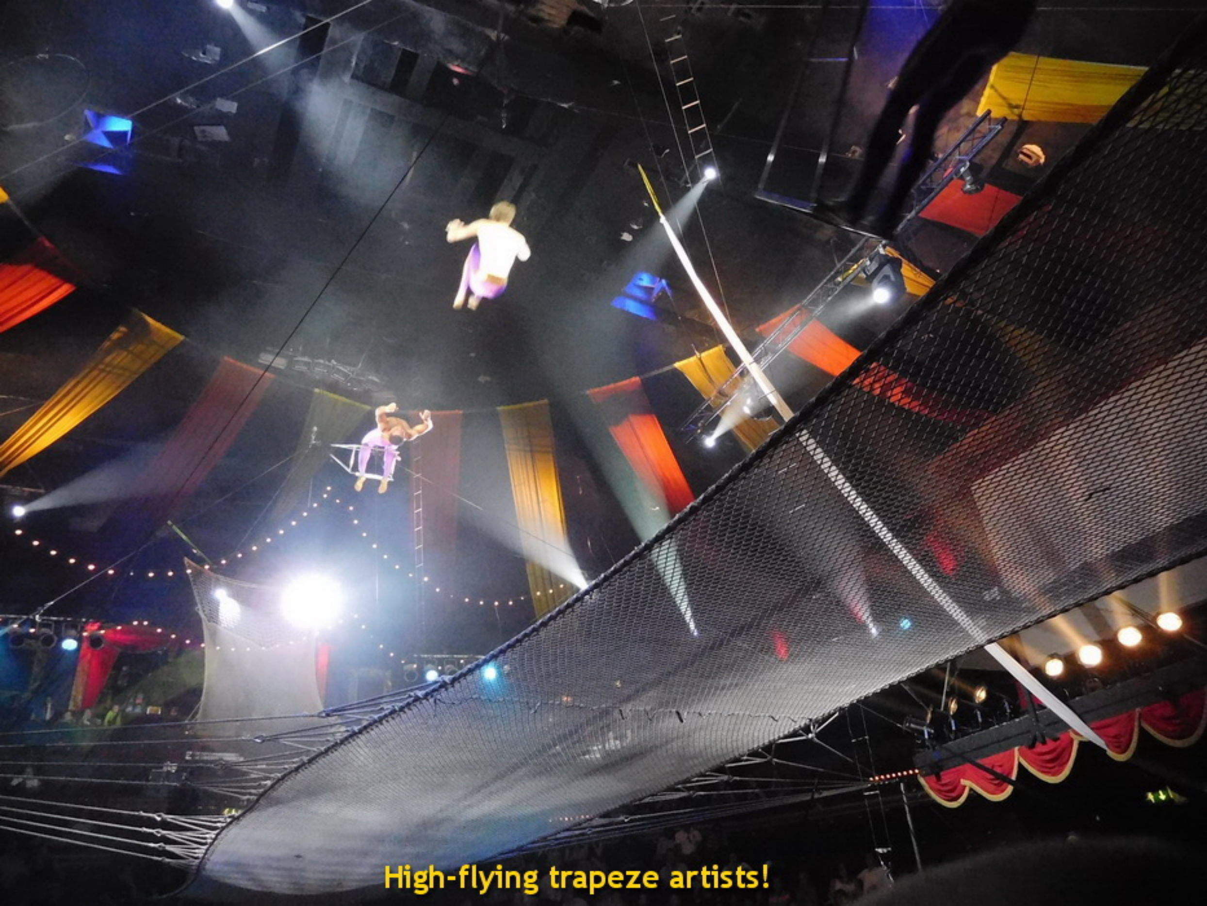
High-flying trapeze artists!