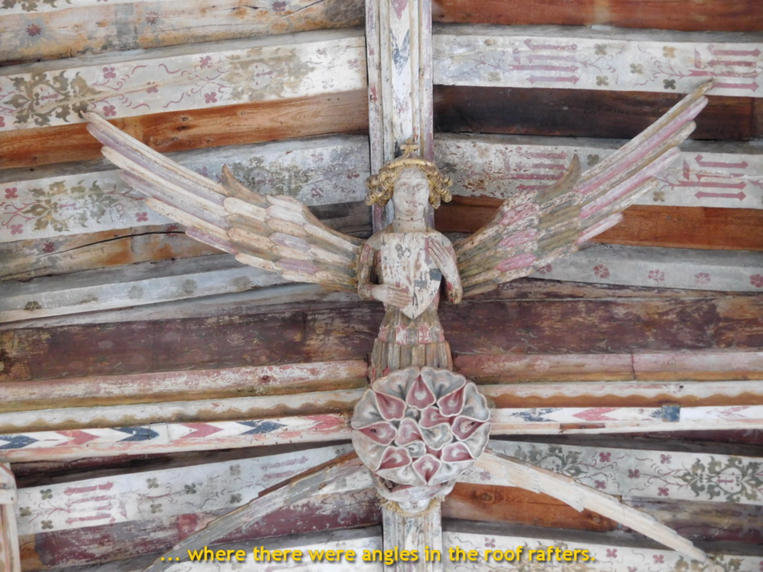
... where there were angles in the roof rafters.