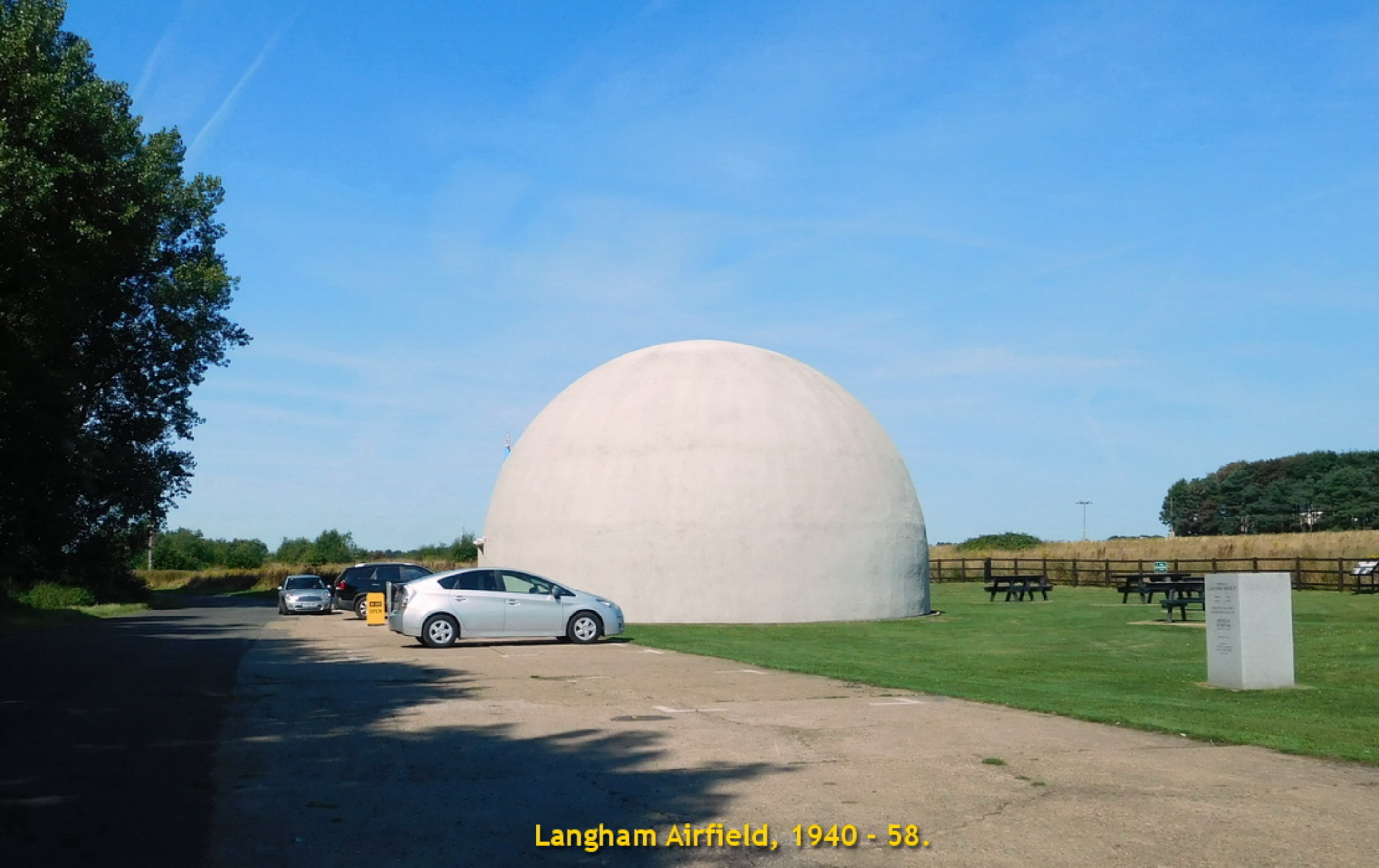
Langham Airfield, 1940 - 58.