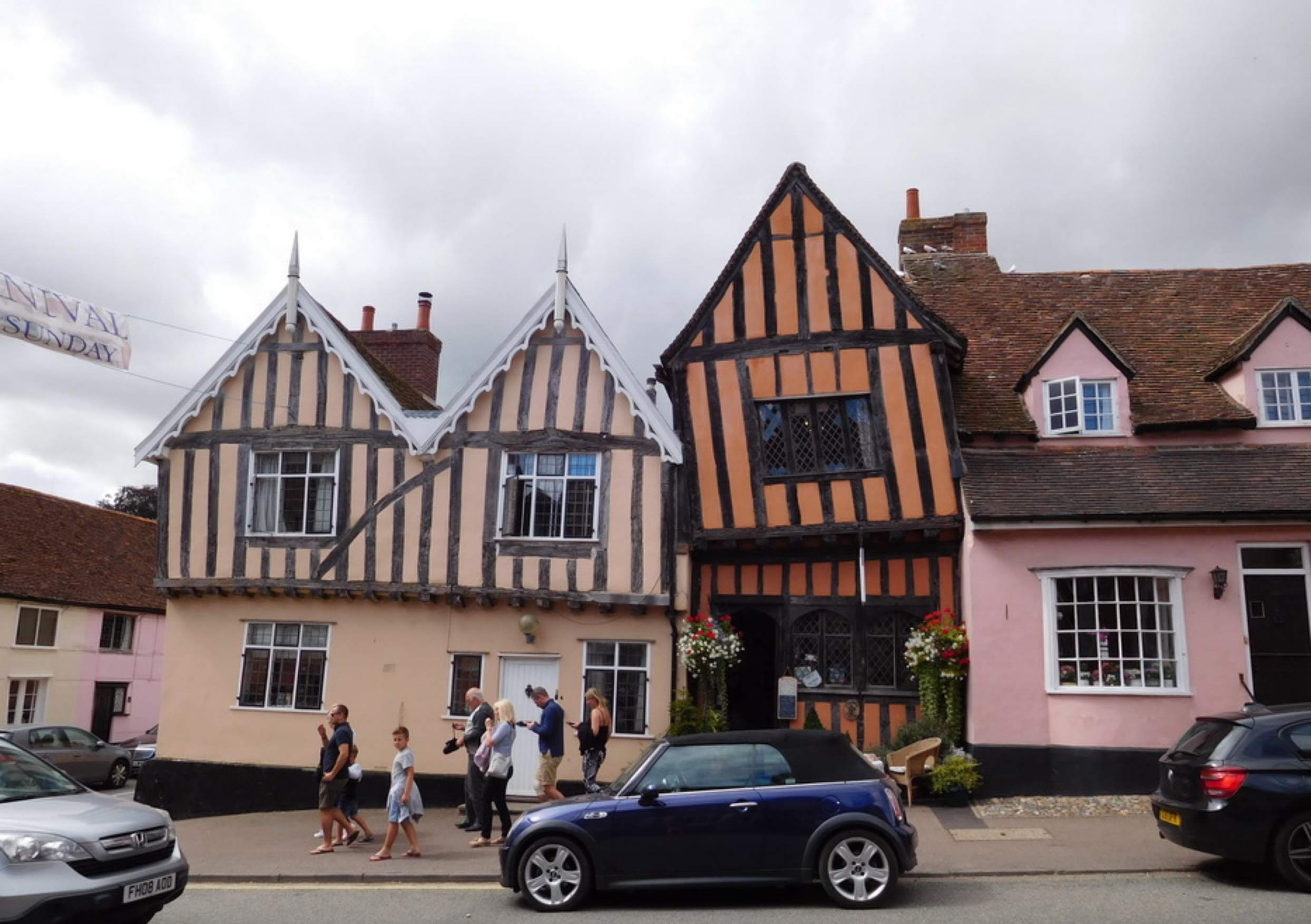
... filled with old homes that have withstood (sort of!) the test of time.