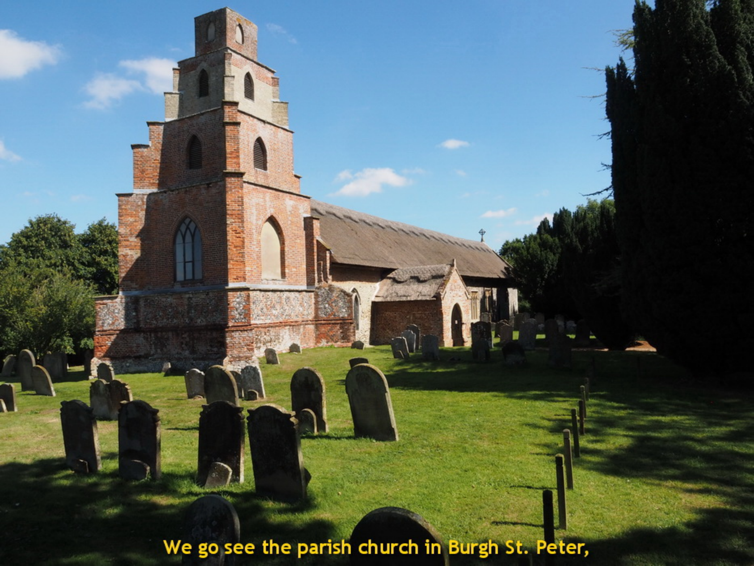
We go see the parish church in Burgh St. Peter,