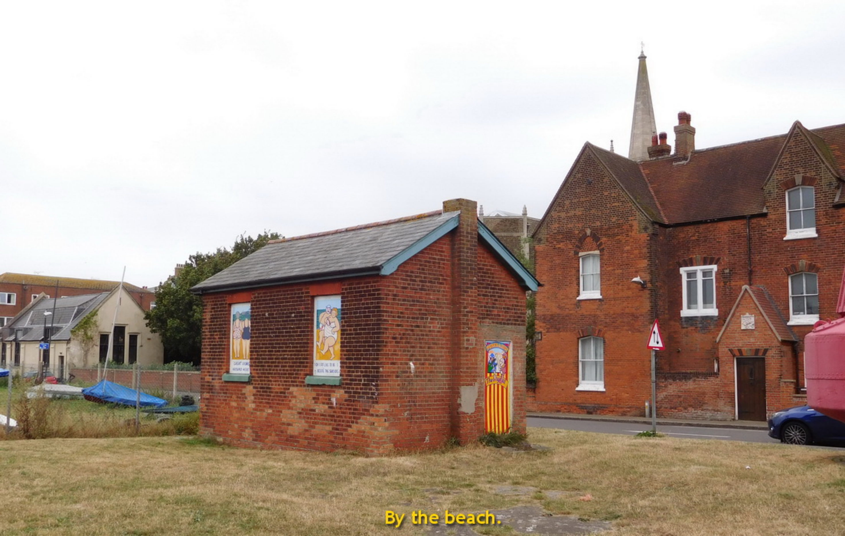
By the beach.