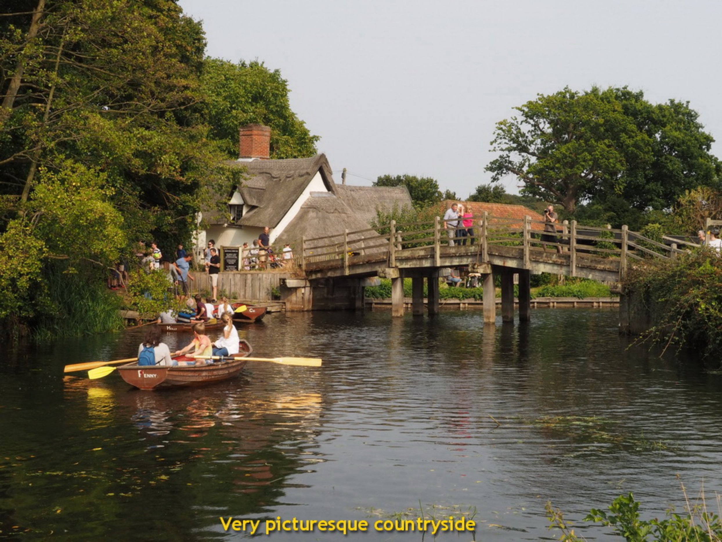
Very picturesque countryside