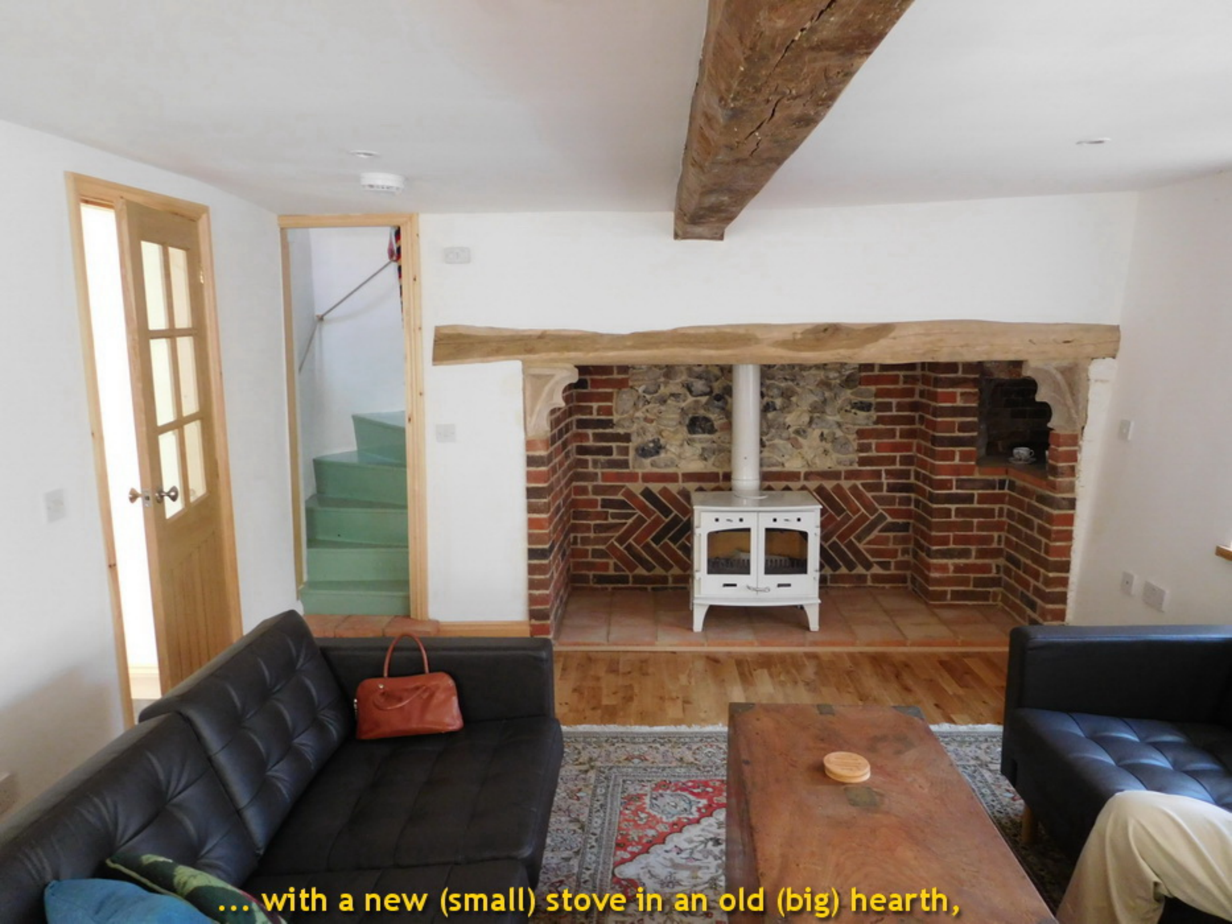
... with a new (small) stove in an old (big) hearth,