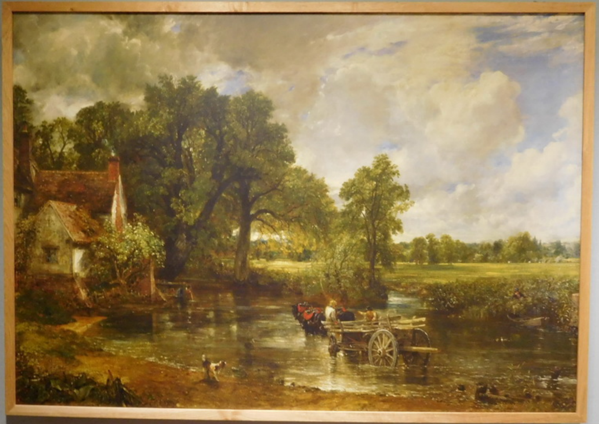
Travel to Flatford, where John Constable painted "Hay Wain" in the 1820's