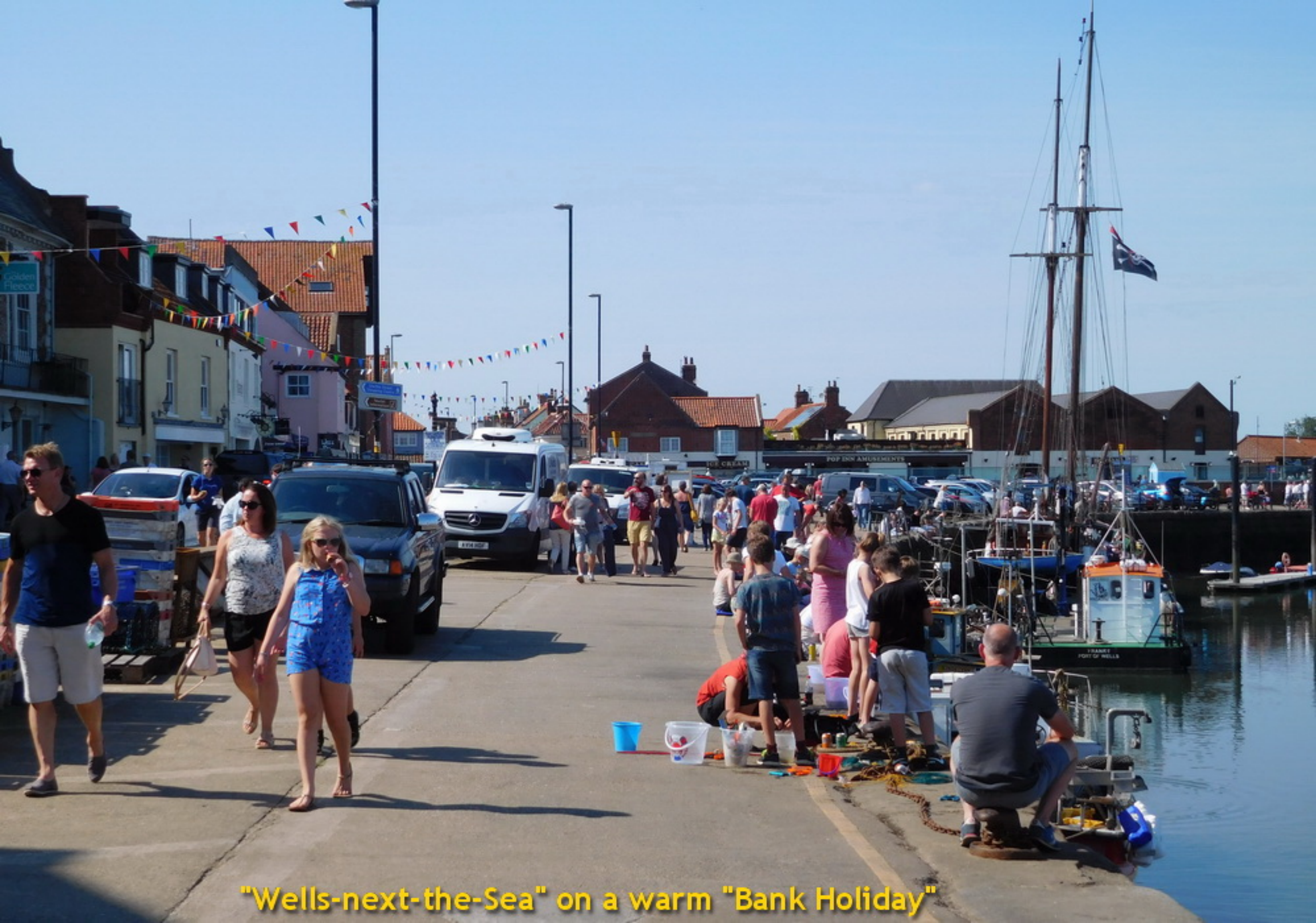
"Wells-next-the-Sea" on a warm "Bank Holiday"