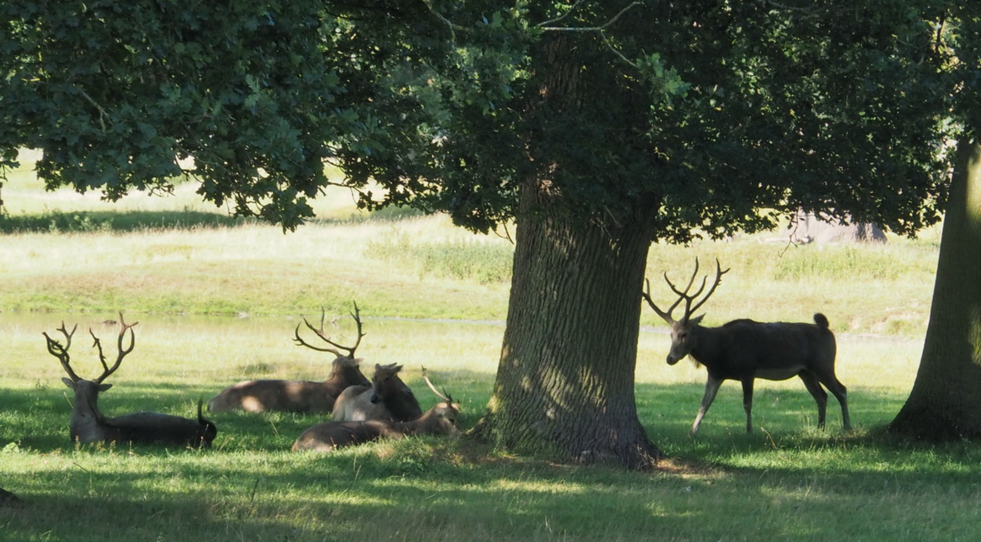
Houghton Hall is famous for the deer on the estate.