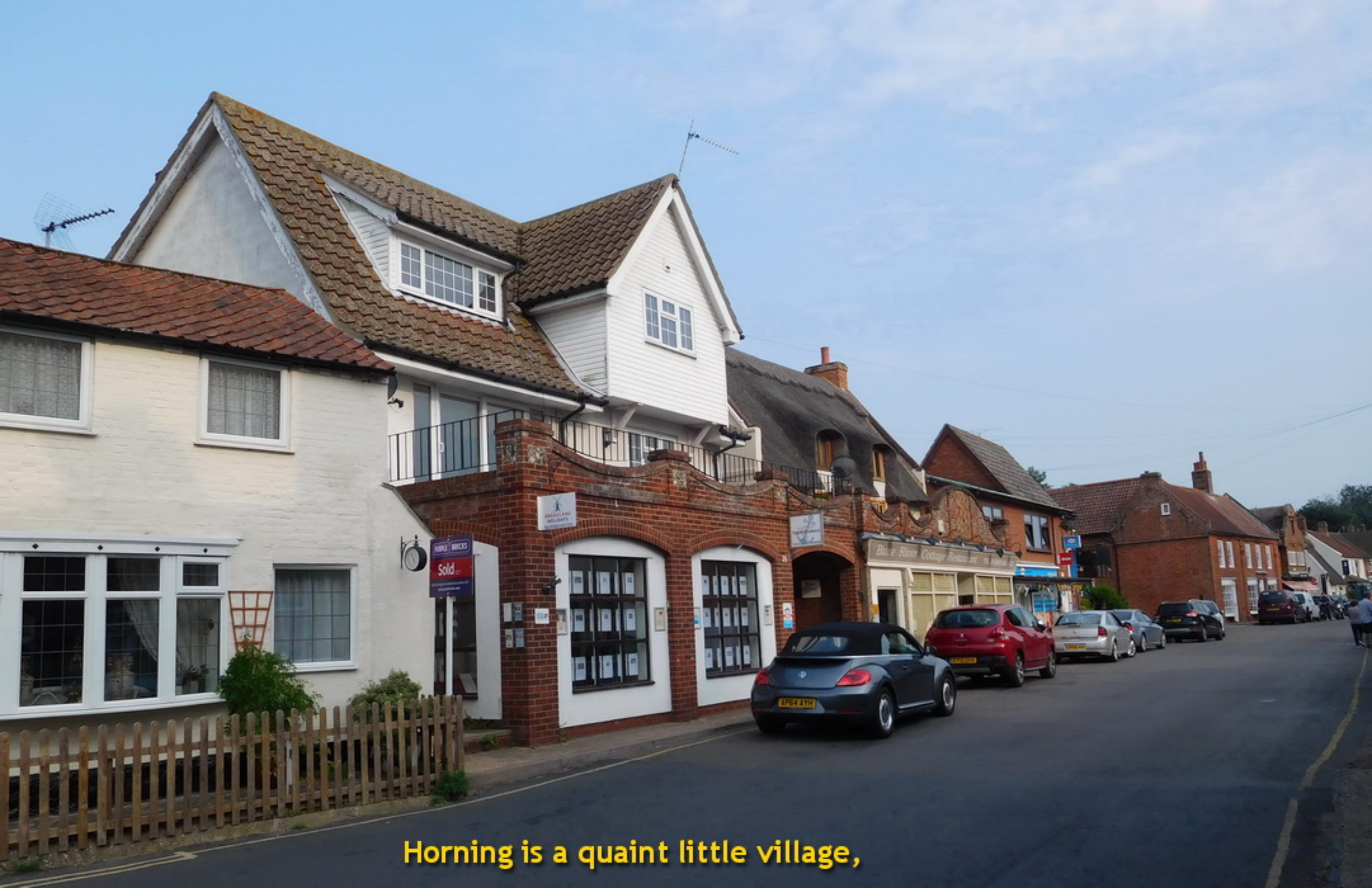
Horning is a quaint little village,