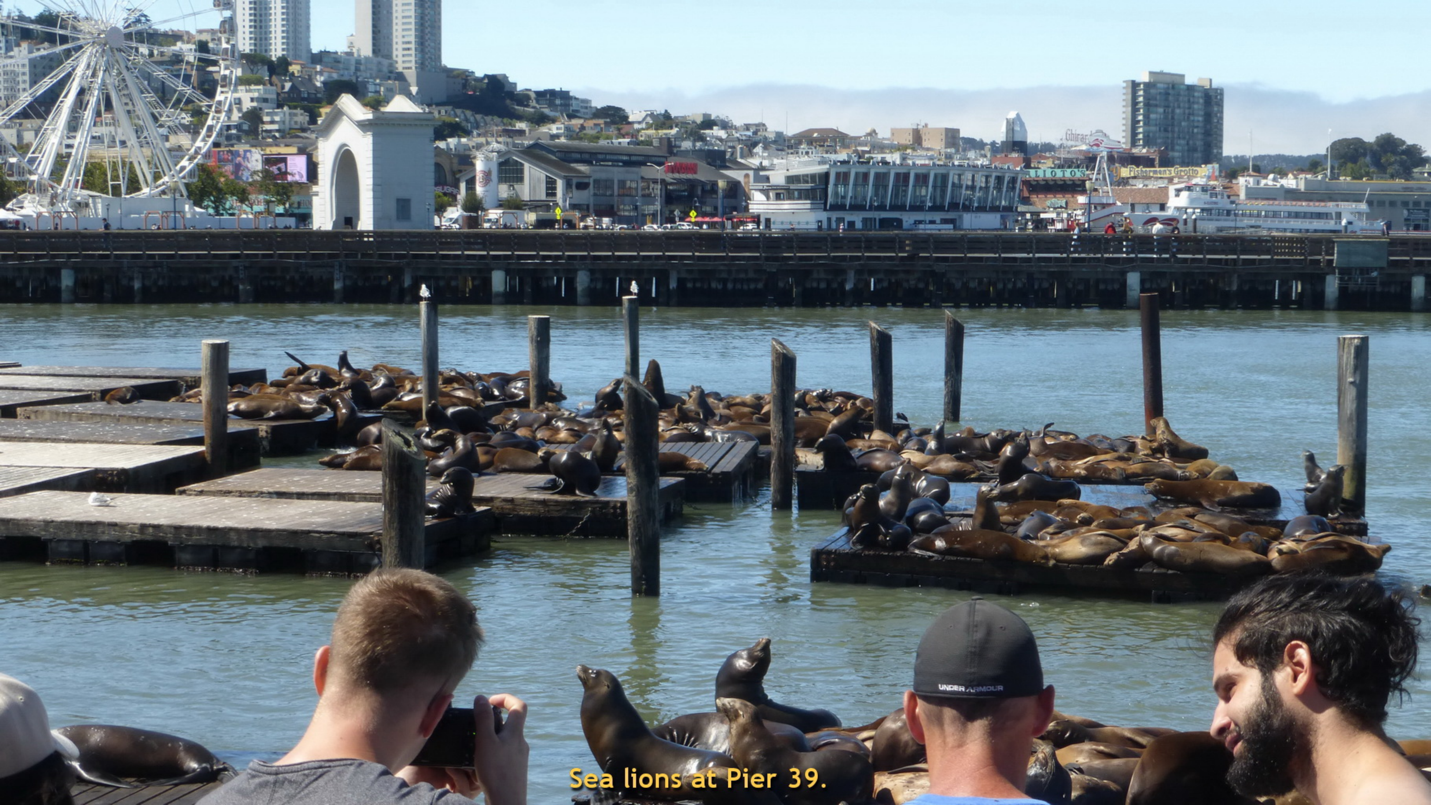
Sea lions at Pier 39.