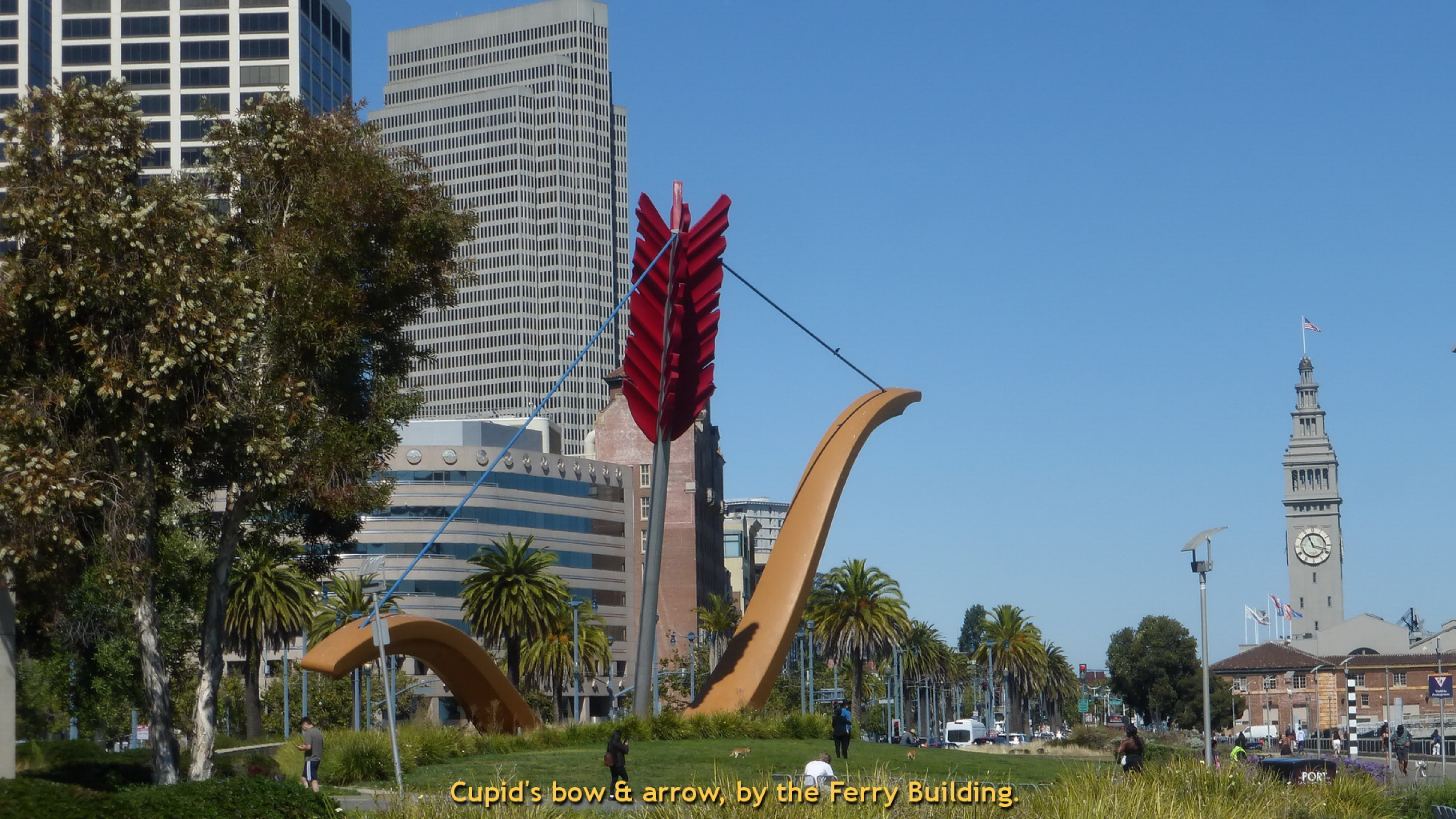
Cupid's bow & arrow, by the Ferry Building.