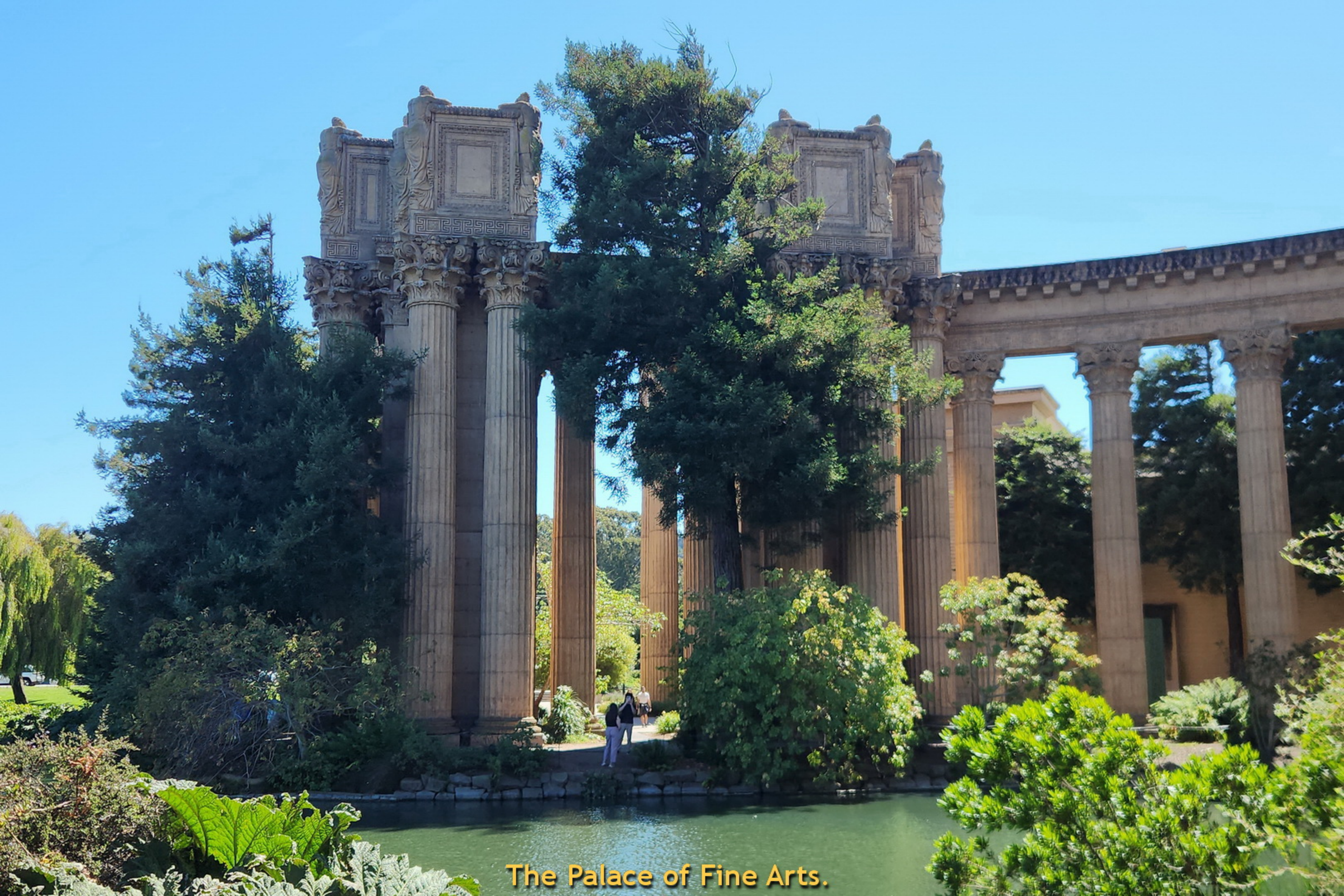
The Palace of Fine Arts.