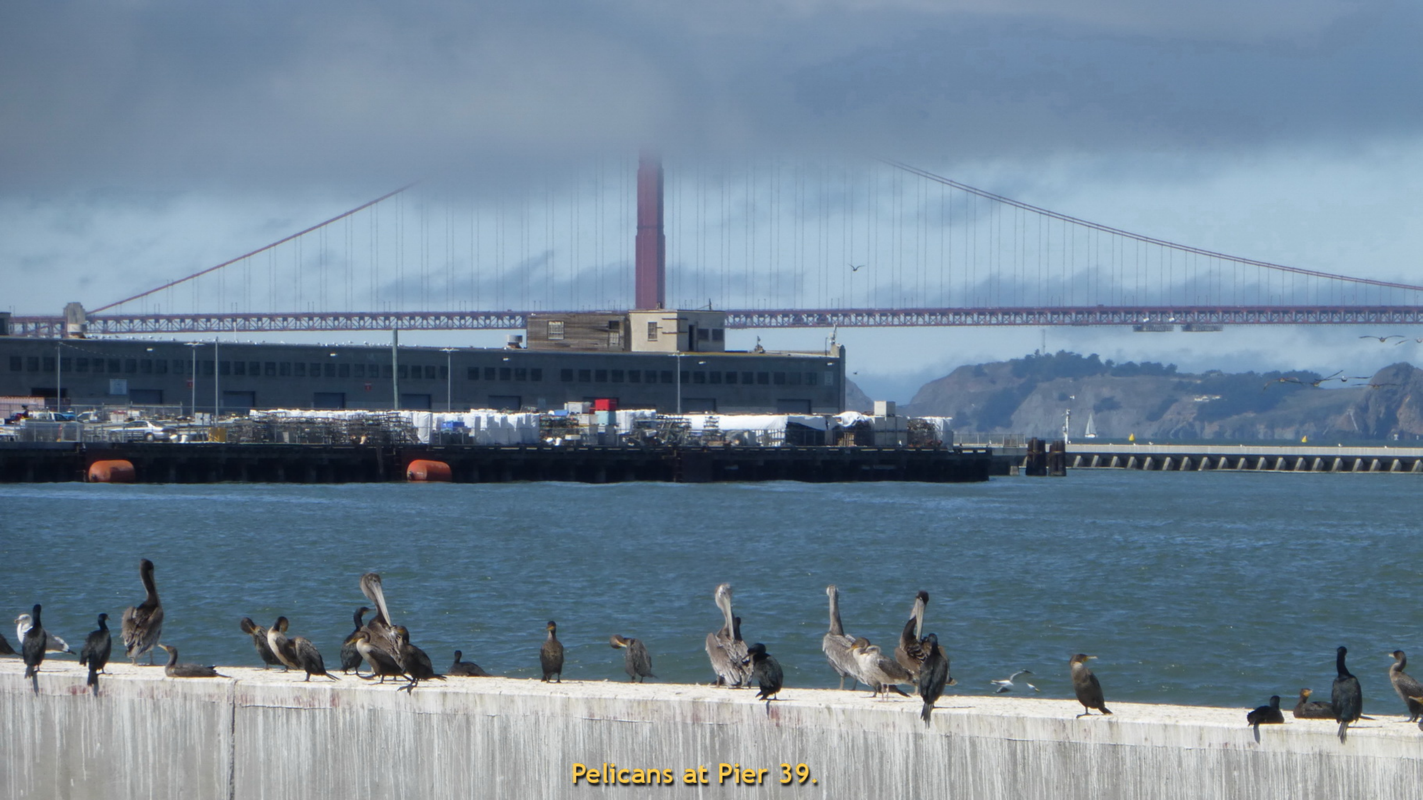
Pelicans at Pier 39.