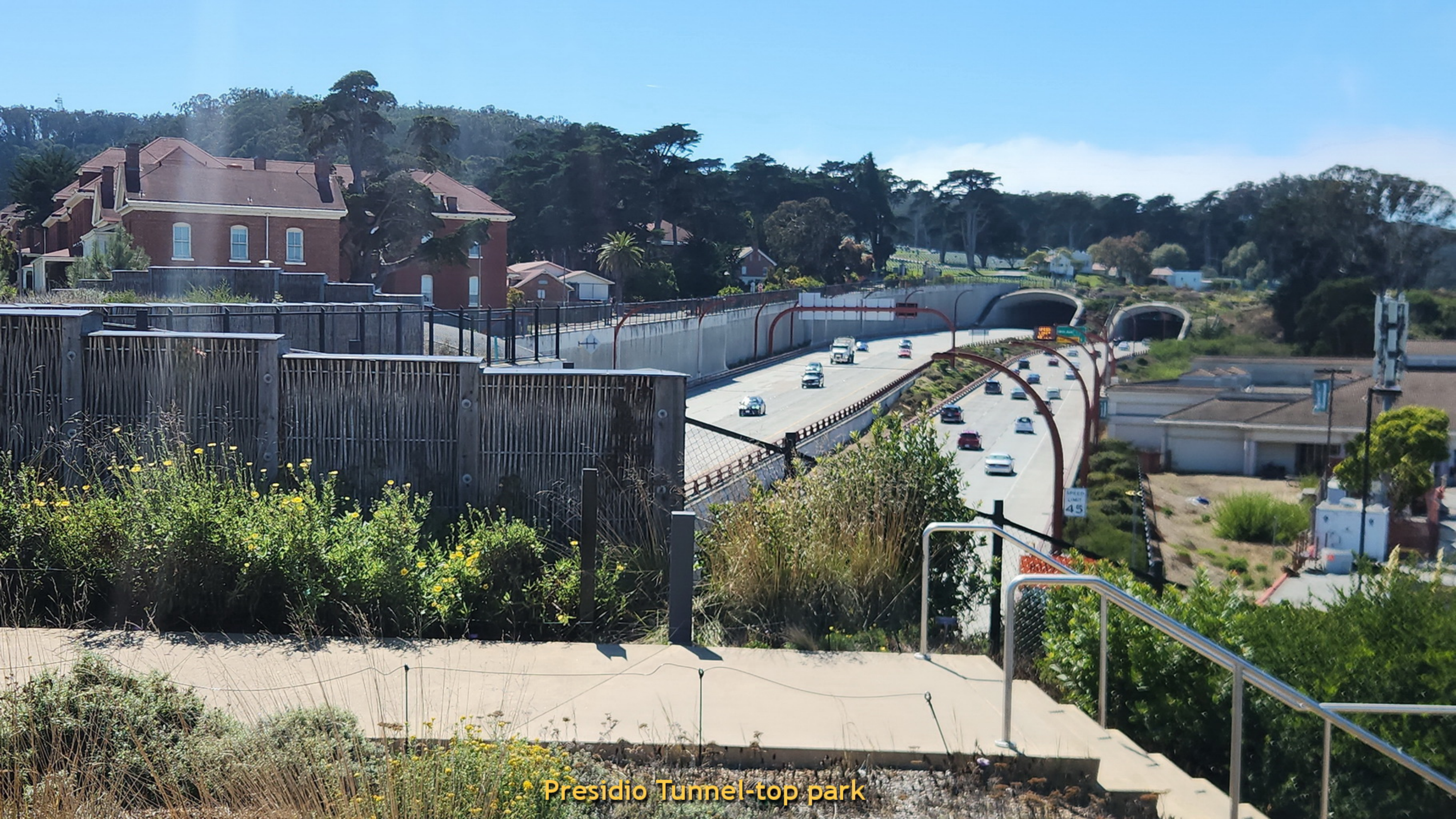
Presidio Tunnel-top park