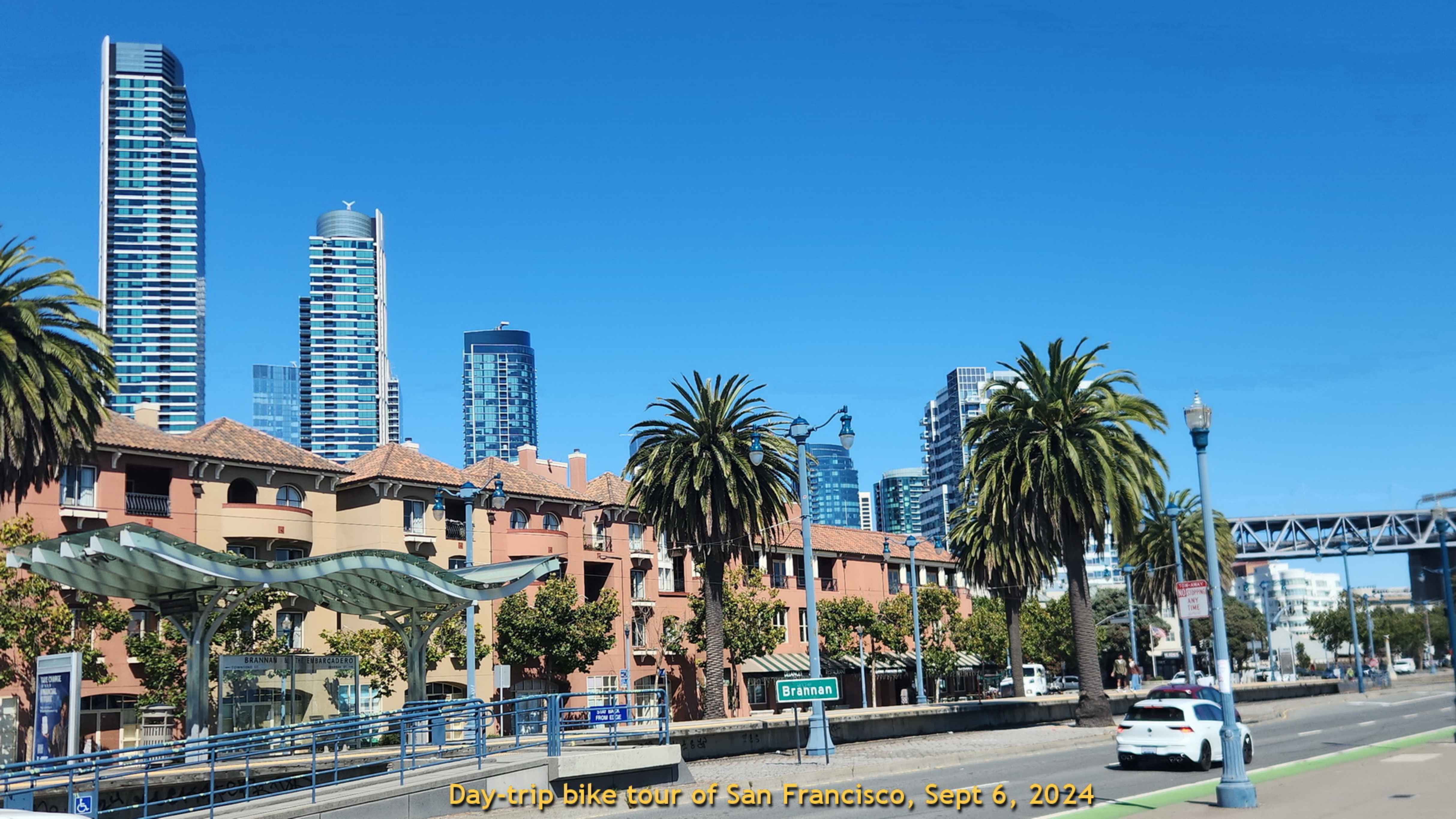
Day-trip bike tour of San Francisco, Sept 6, 2024