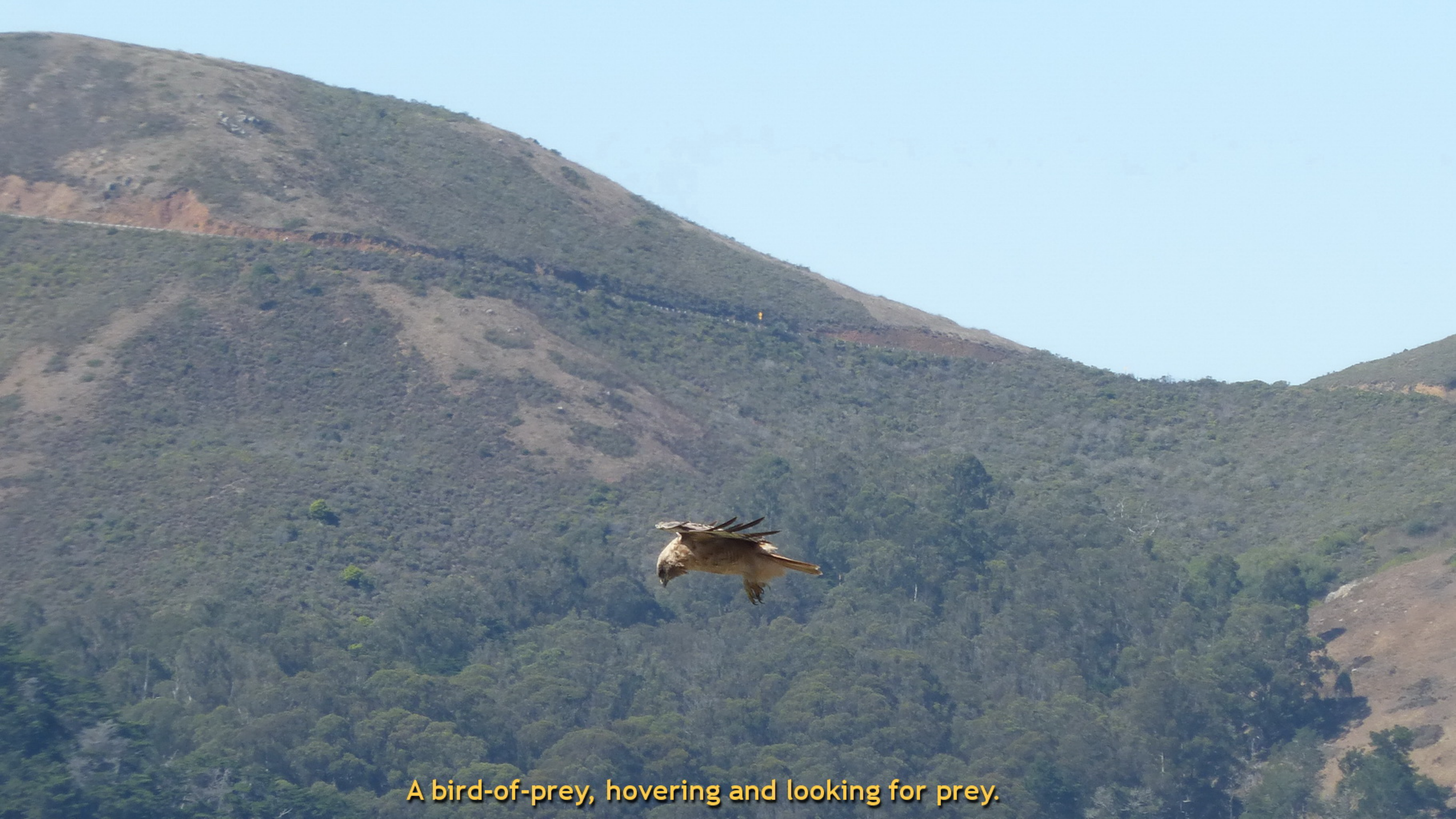
A bird-of-prey, hovering and looking for prey.