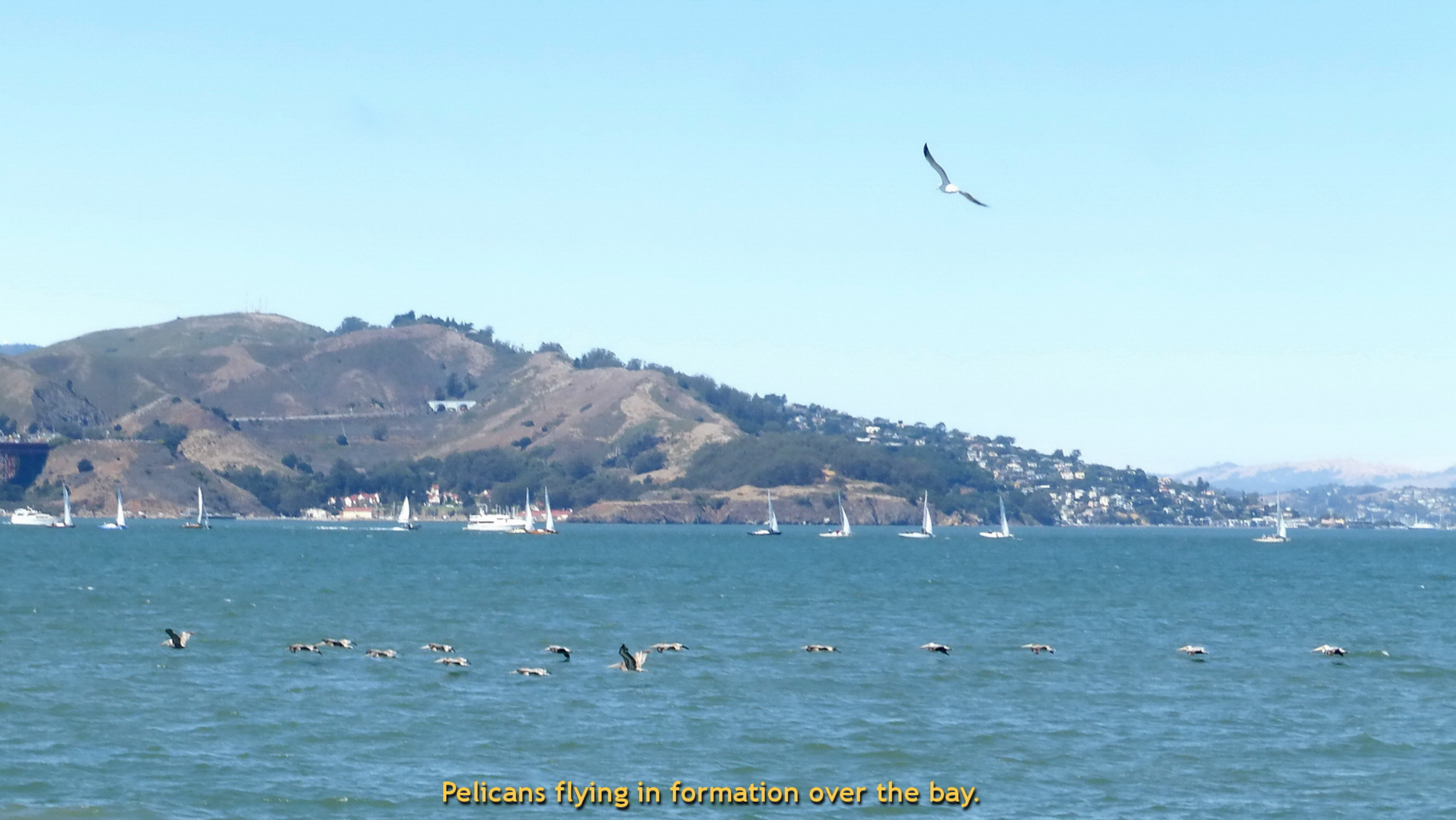
Pelicans flying in formation over the bay.