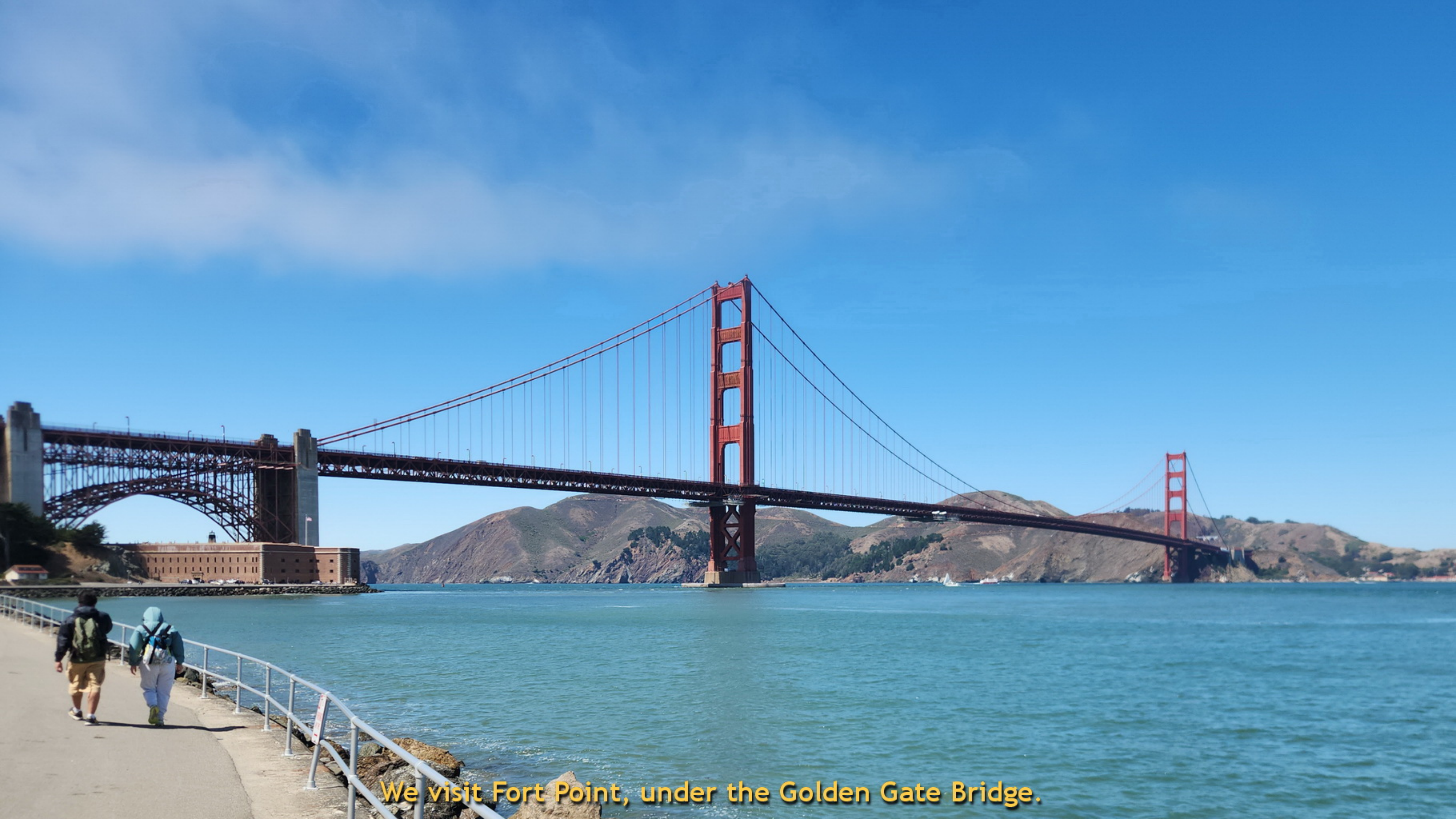
We visit Fort Point, under the Golden Gate Bridge.