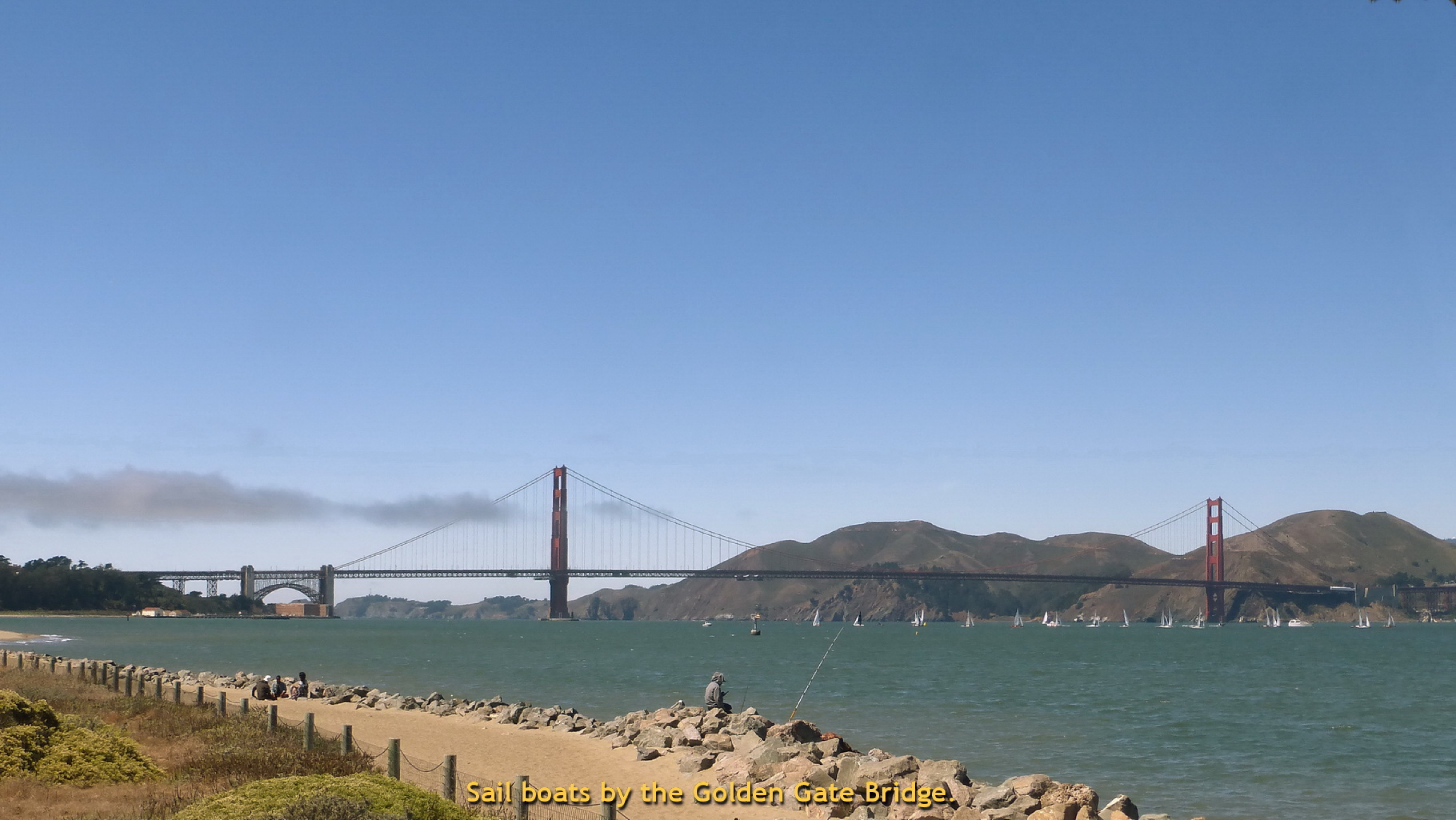
Sail boats by the Golden Gate Bridge.