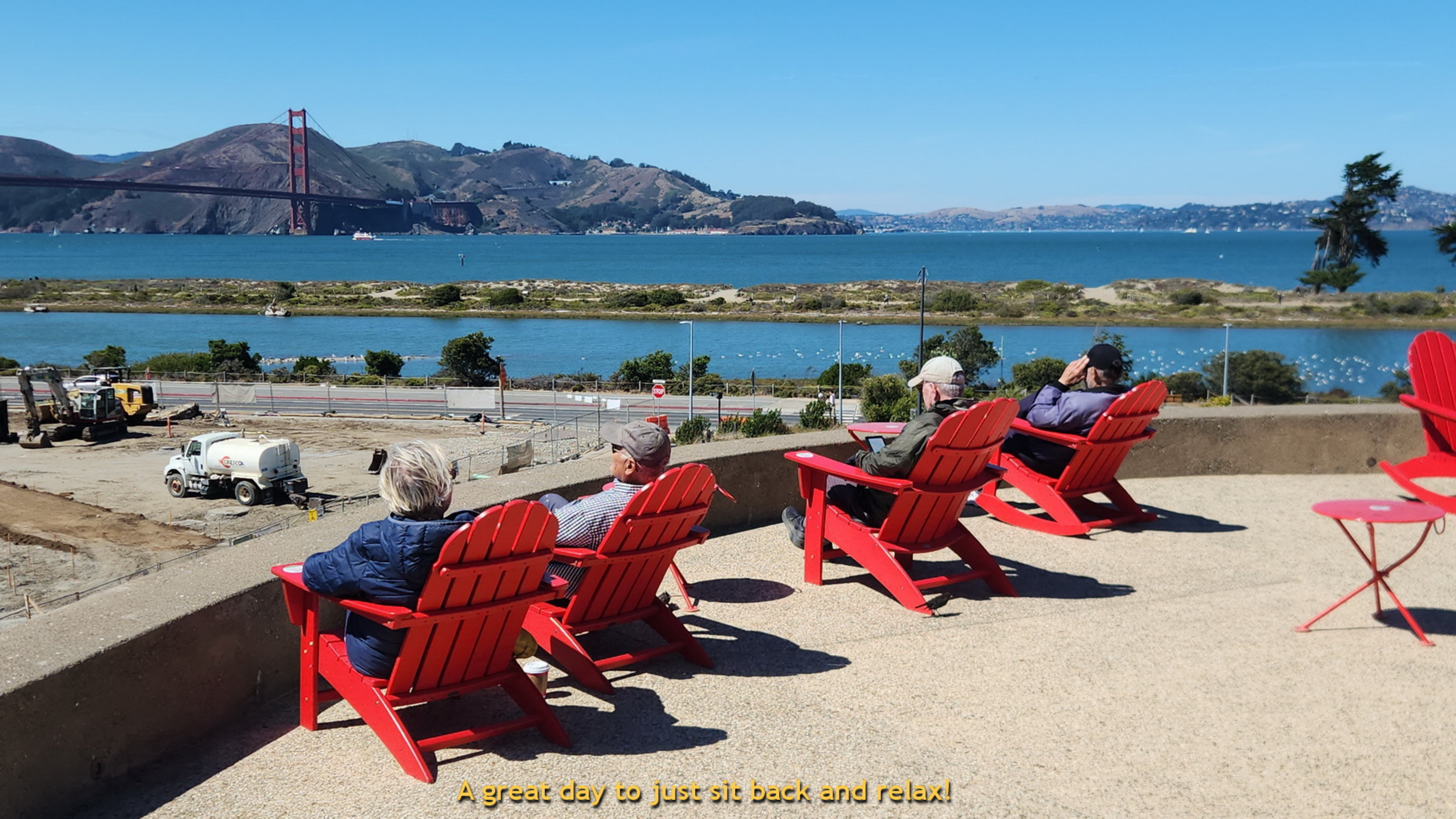
A great day to just sit back and relax!