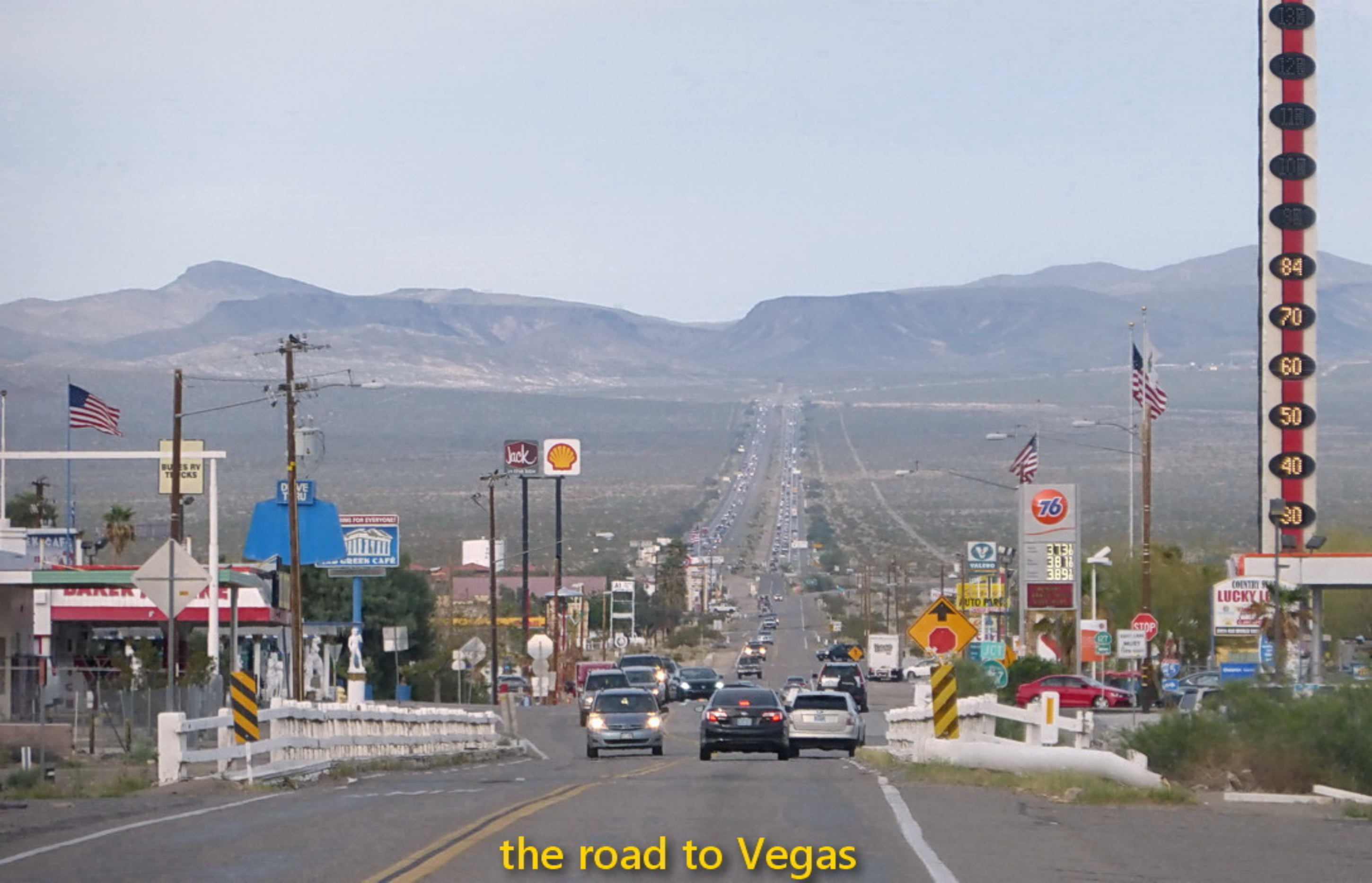
the road to Vegas