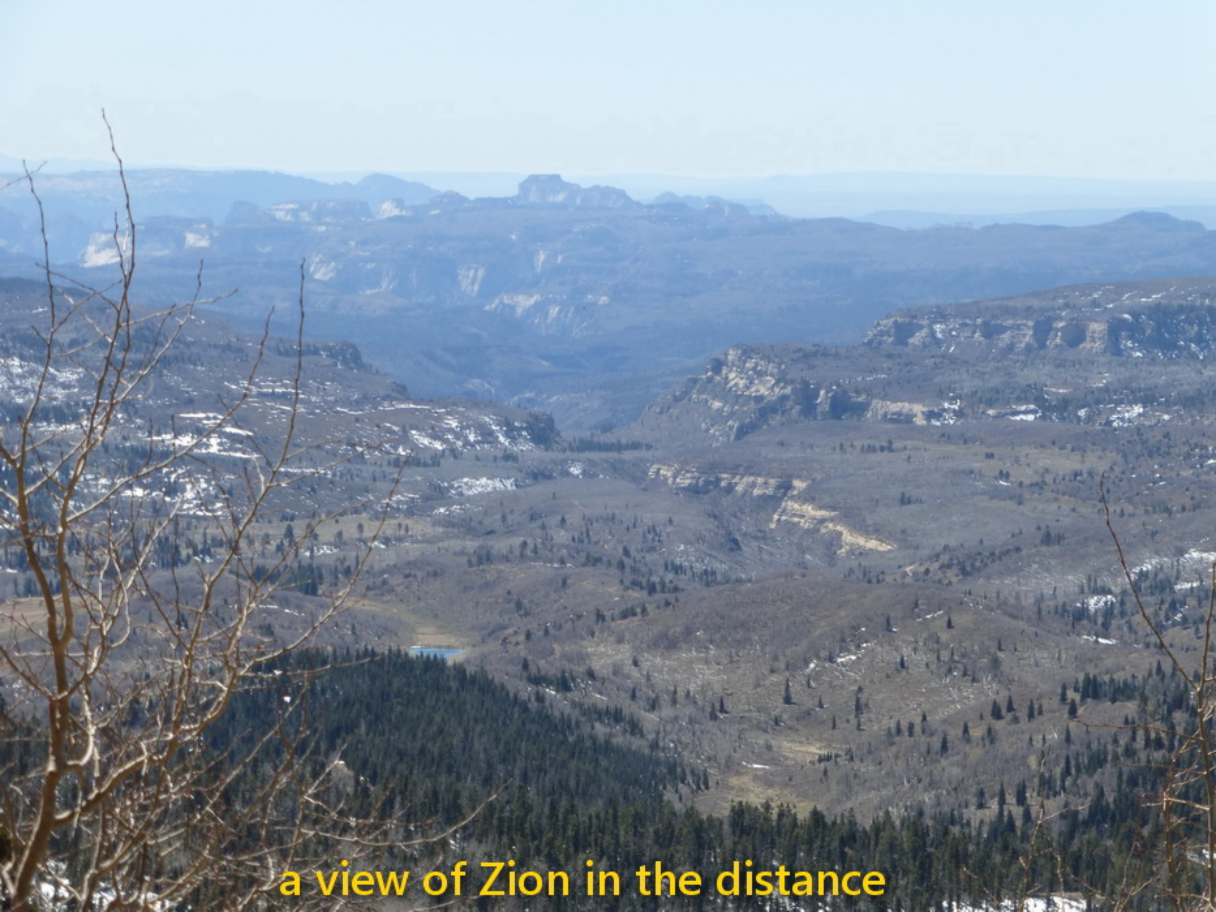
a view of Zion in the distance