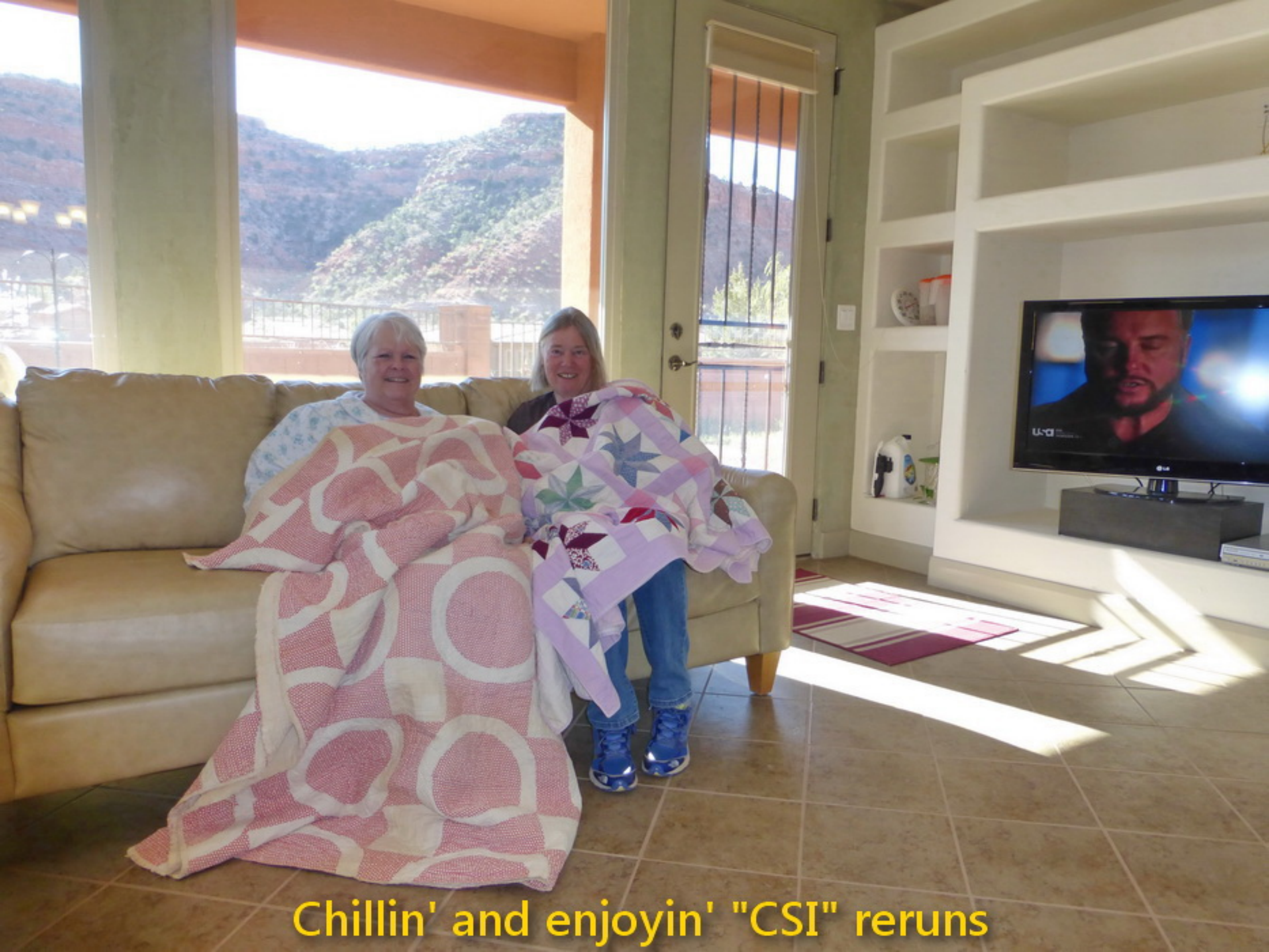
Chillin' and enjoyin' "CSI" reruns