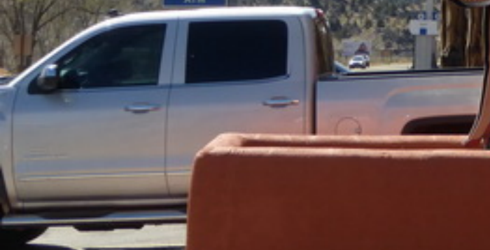
home of "Ho-made pies"