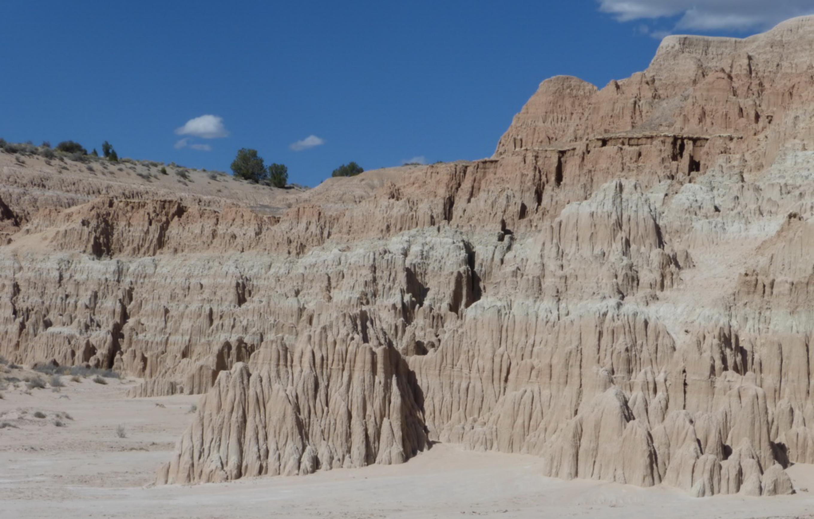
Cathedral Gorge, Nevada