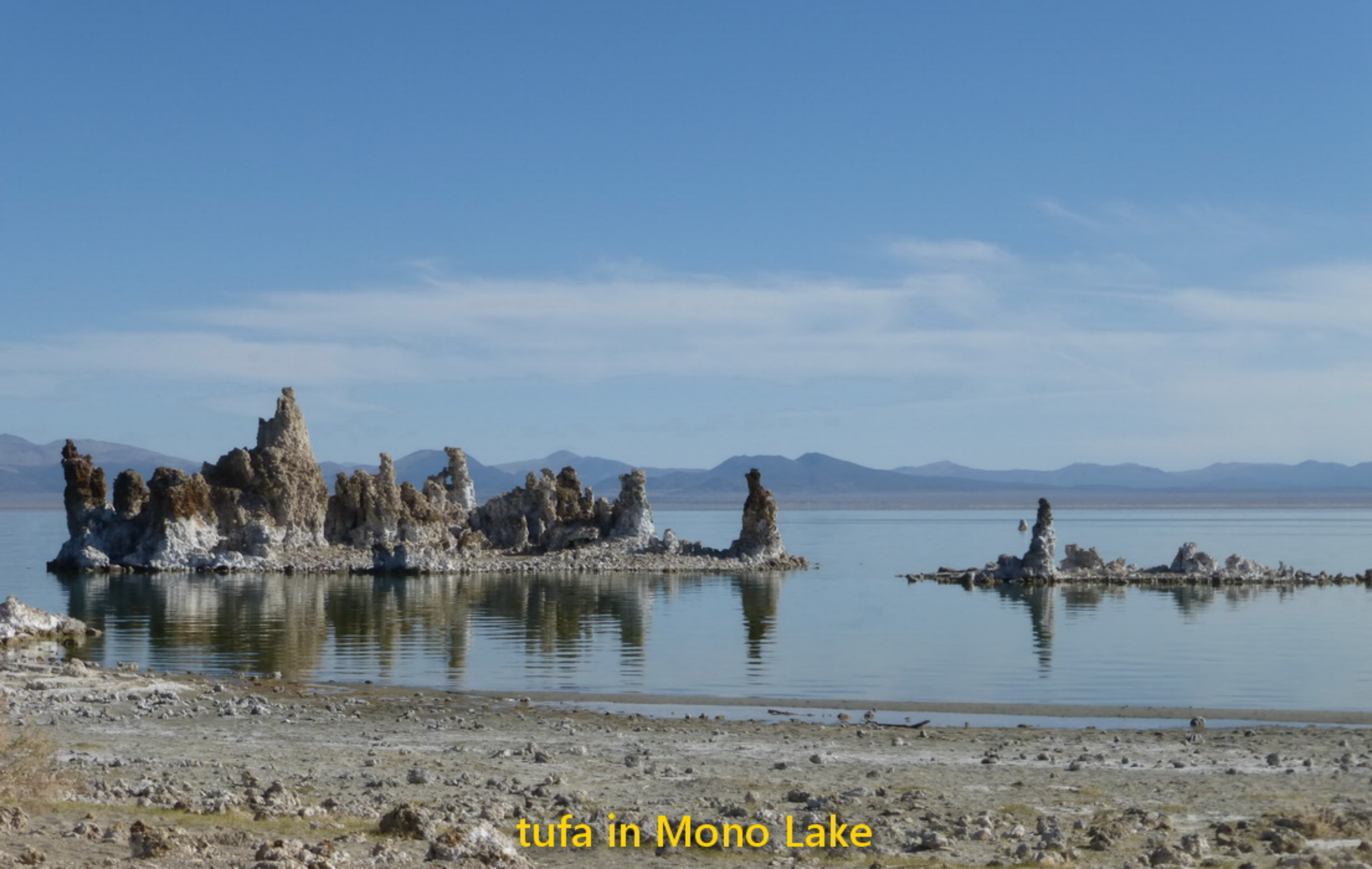
tufa in Mono Lake