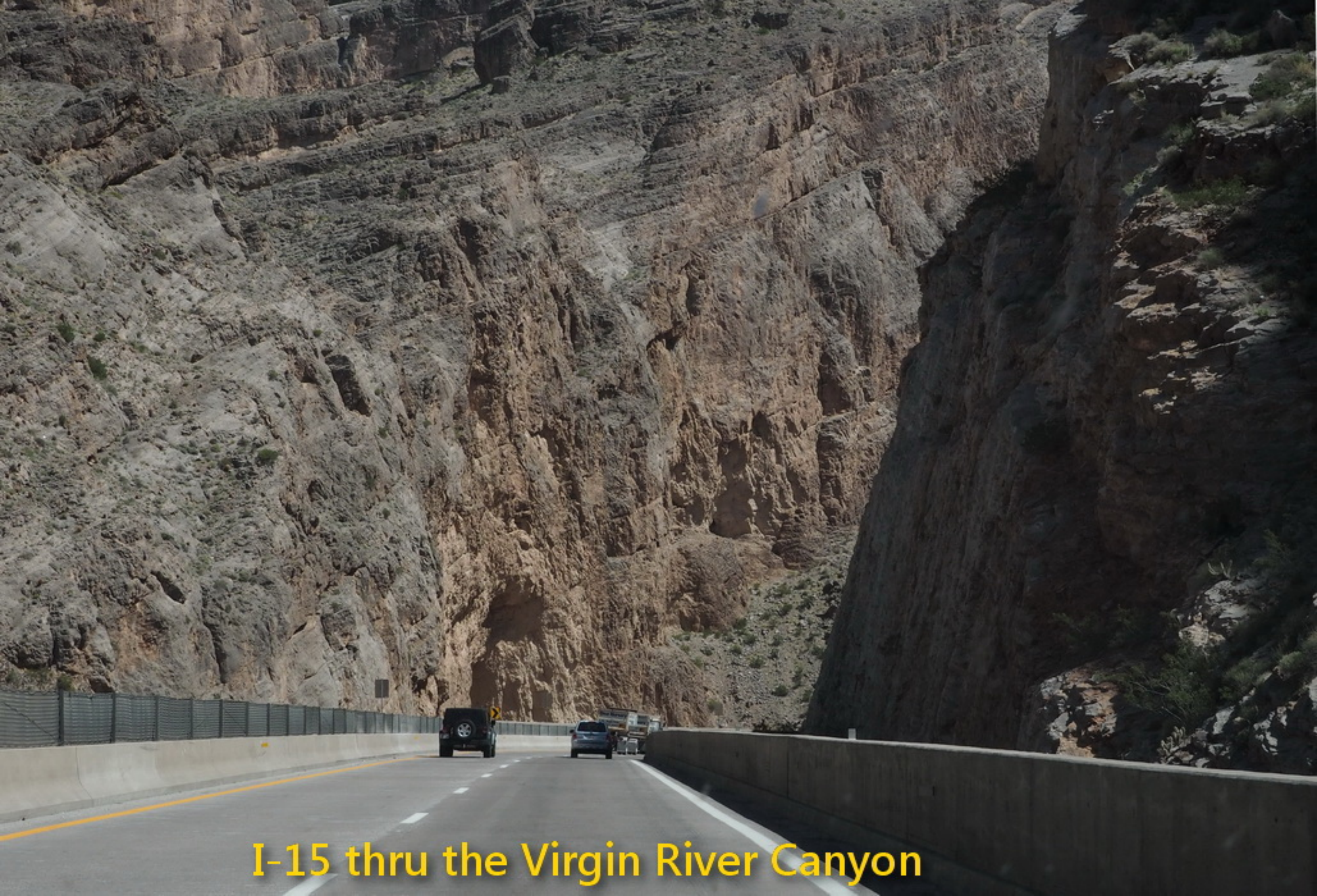
I-15 thru the Virgin River Canyon