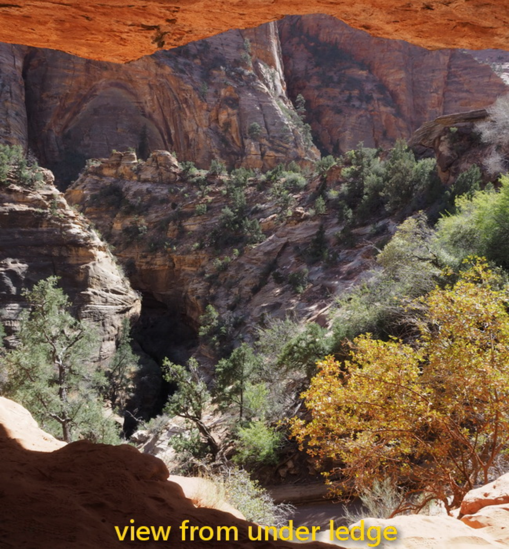
view from under ledge