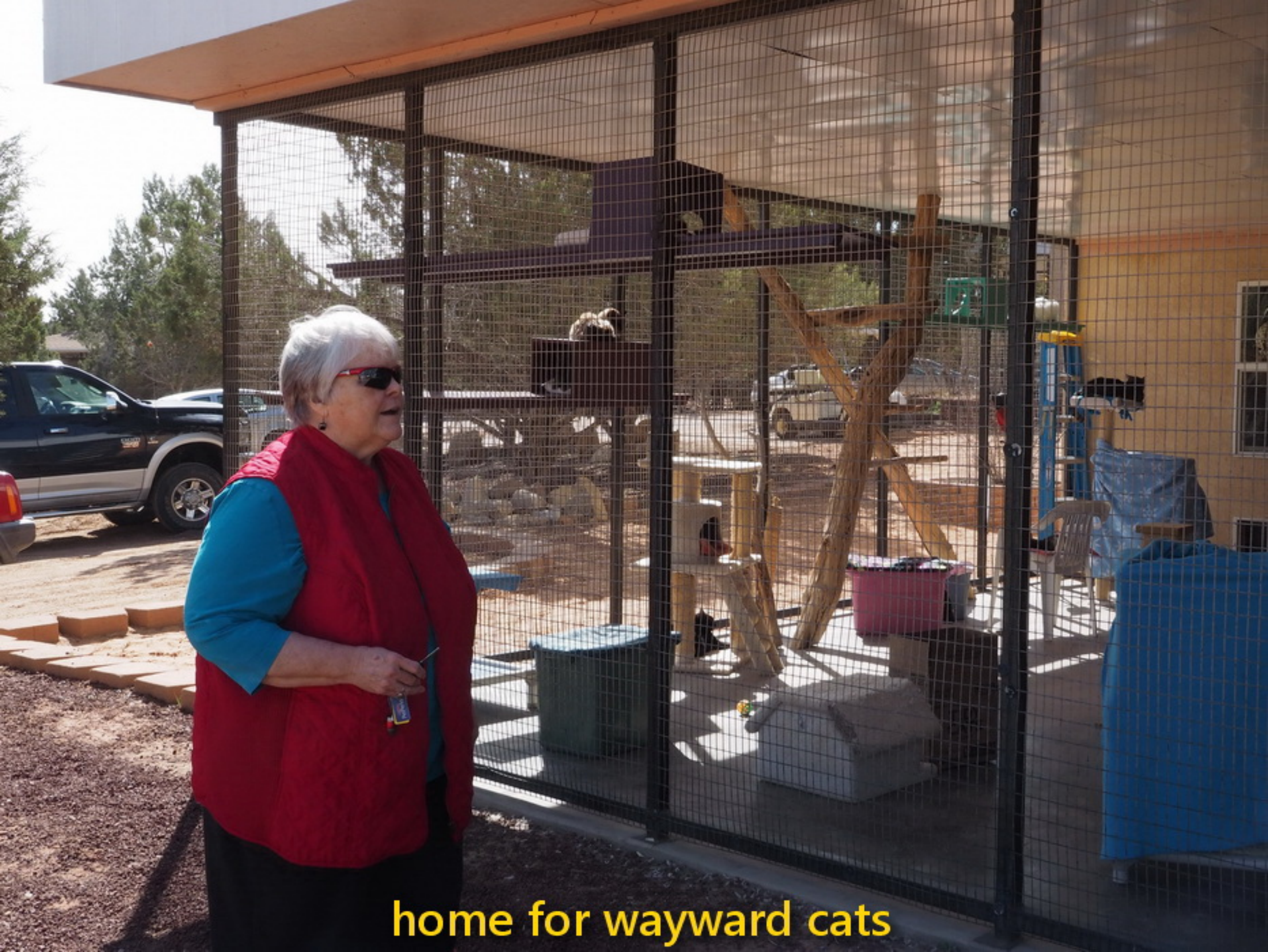
home for wayward cats