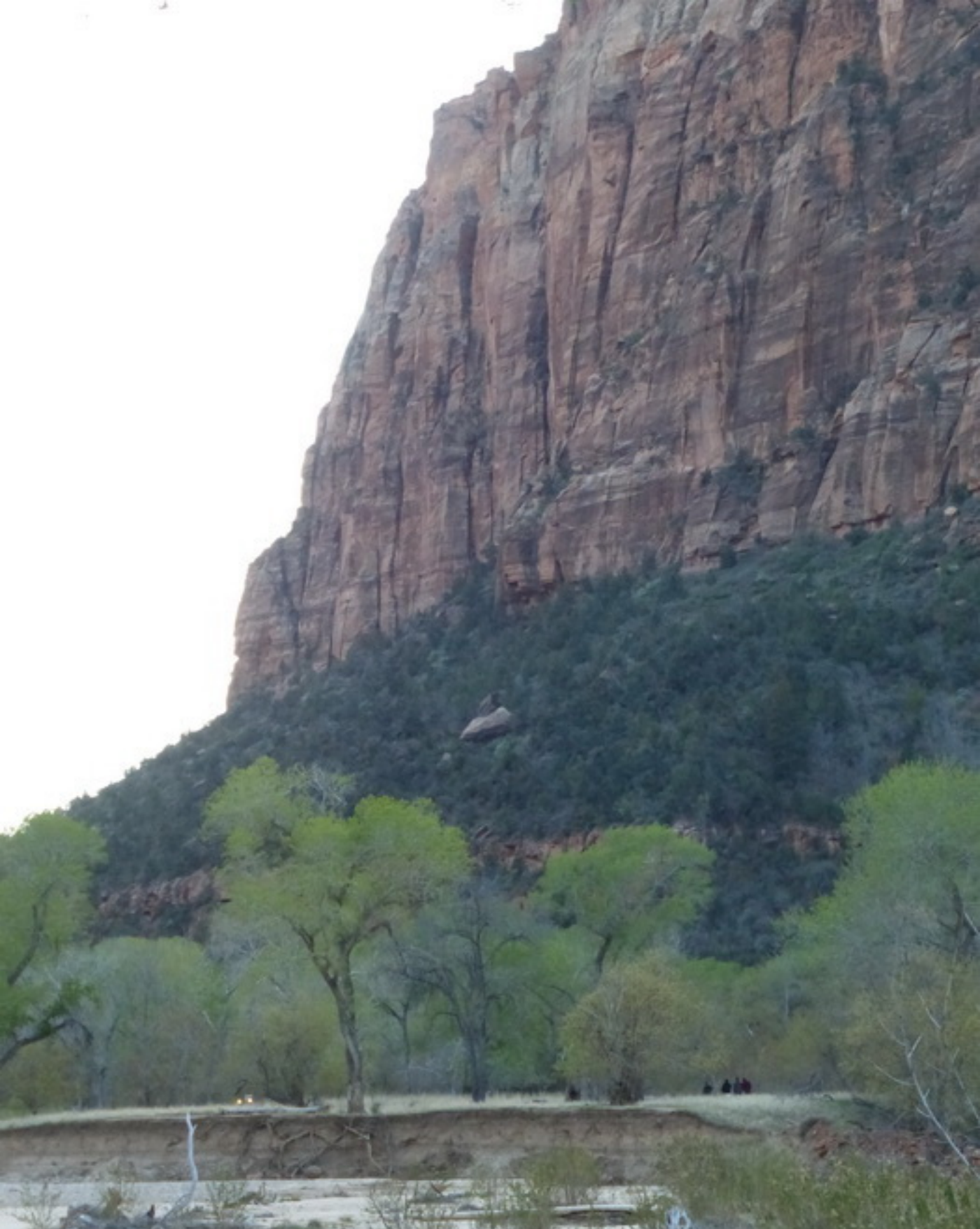
Fred Flintstone's Space Rock-et