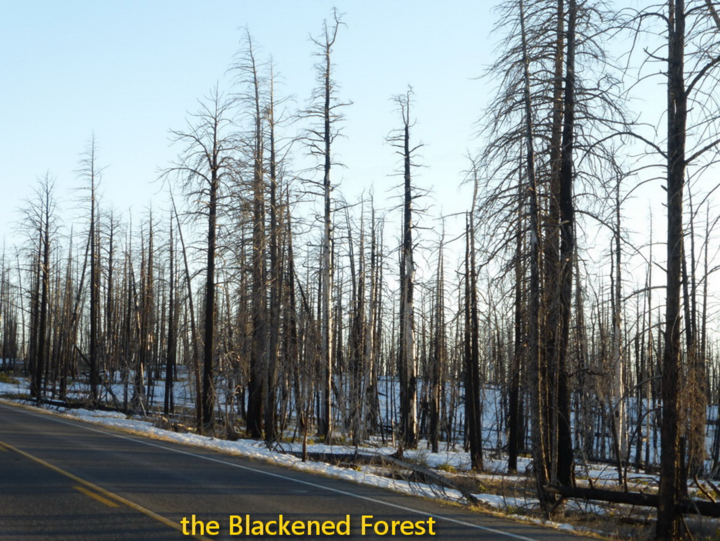
the Blackened Forest