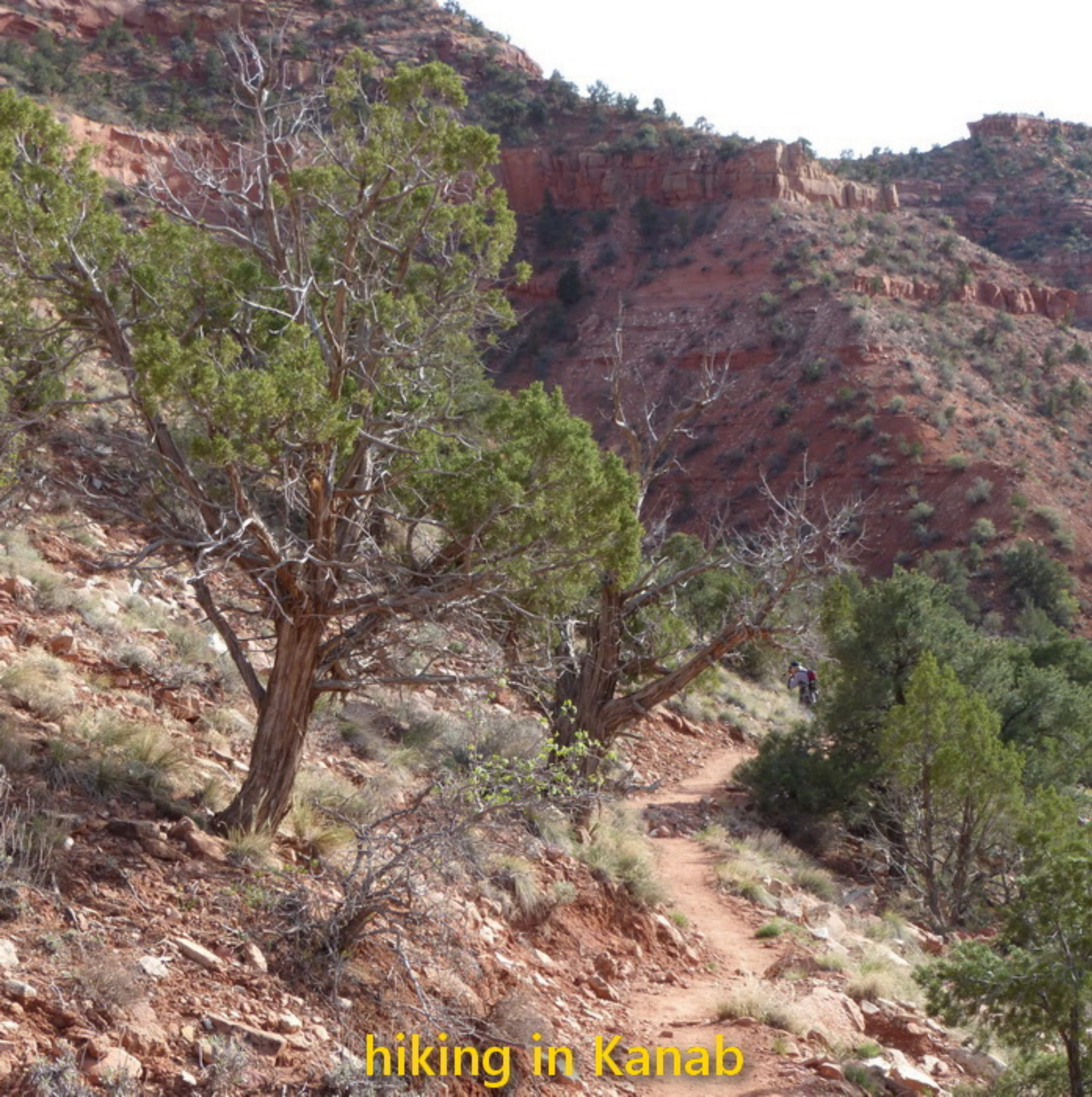
hiking in Kanab