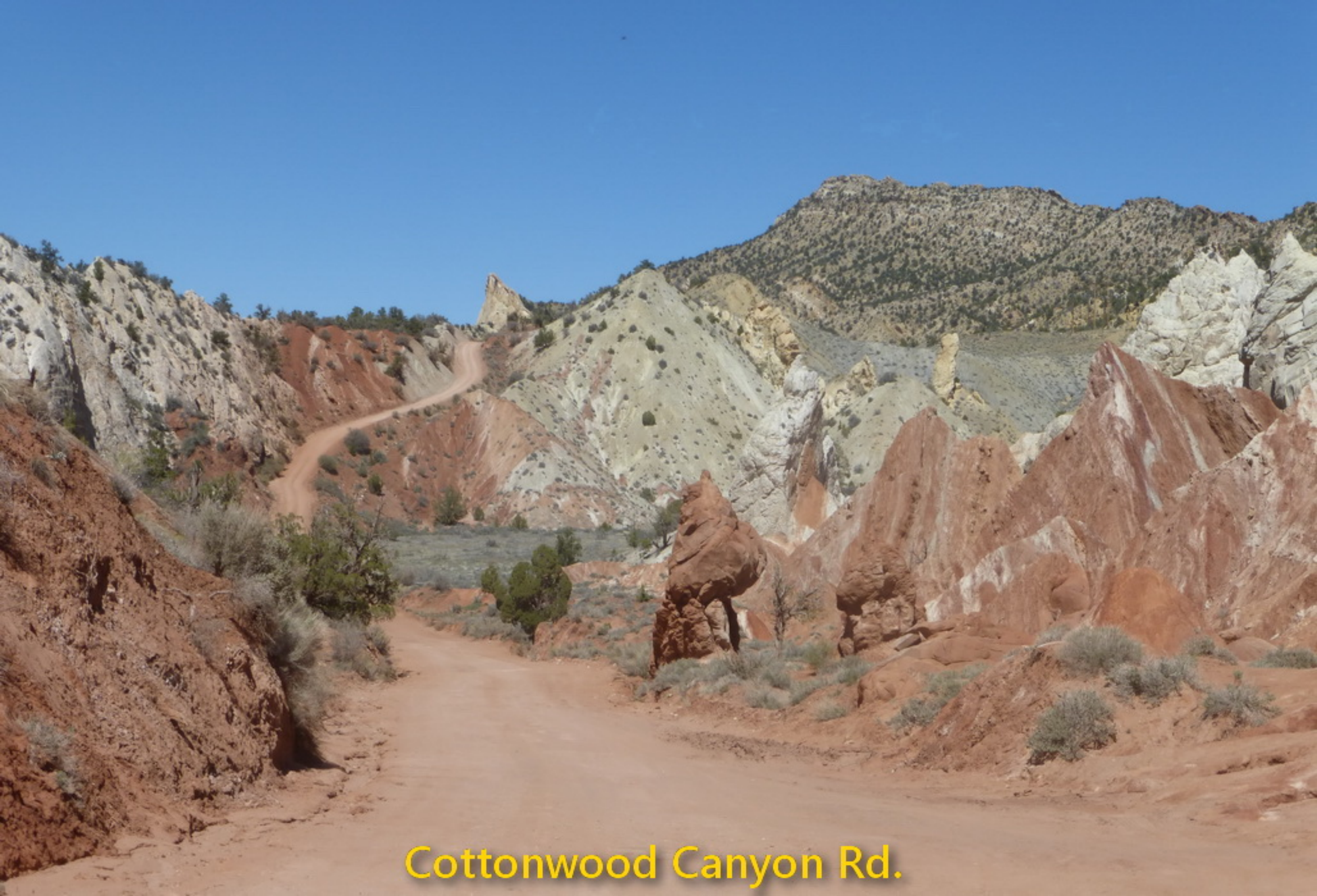
Cottonwood Canyon Rd.