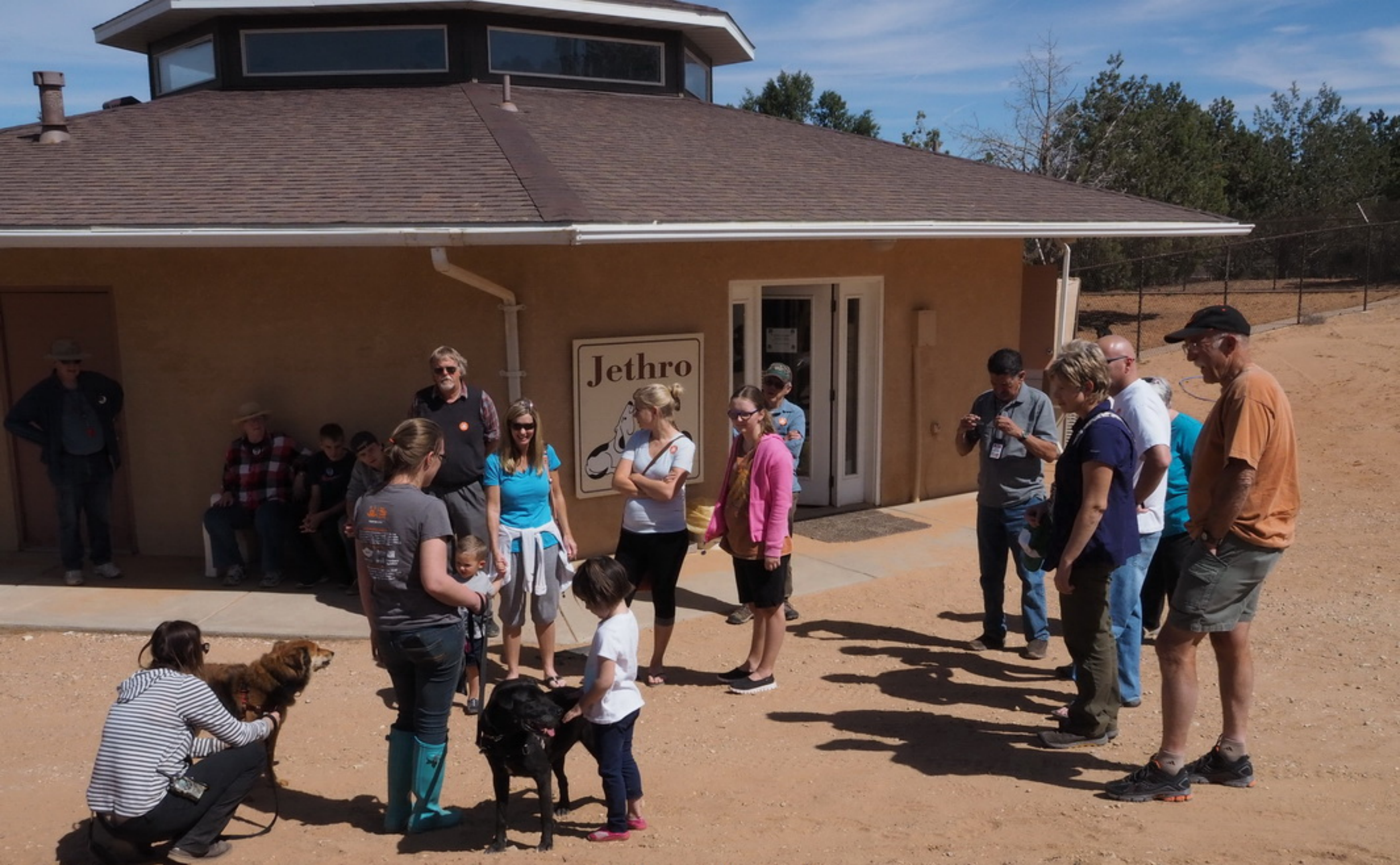
one of the dog houses