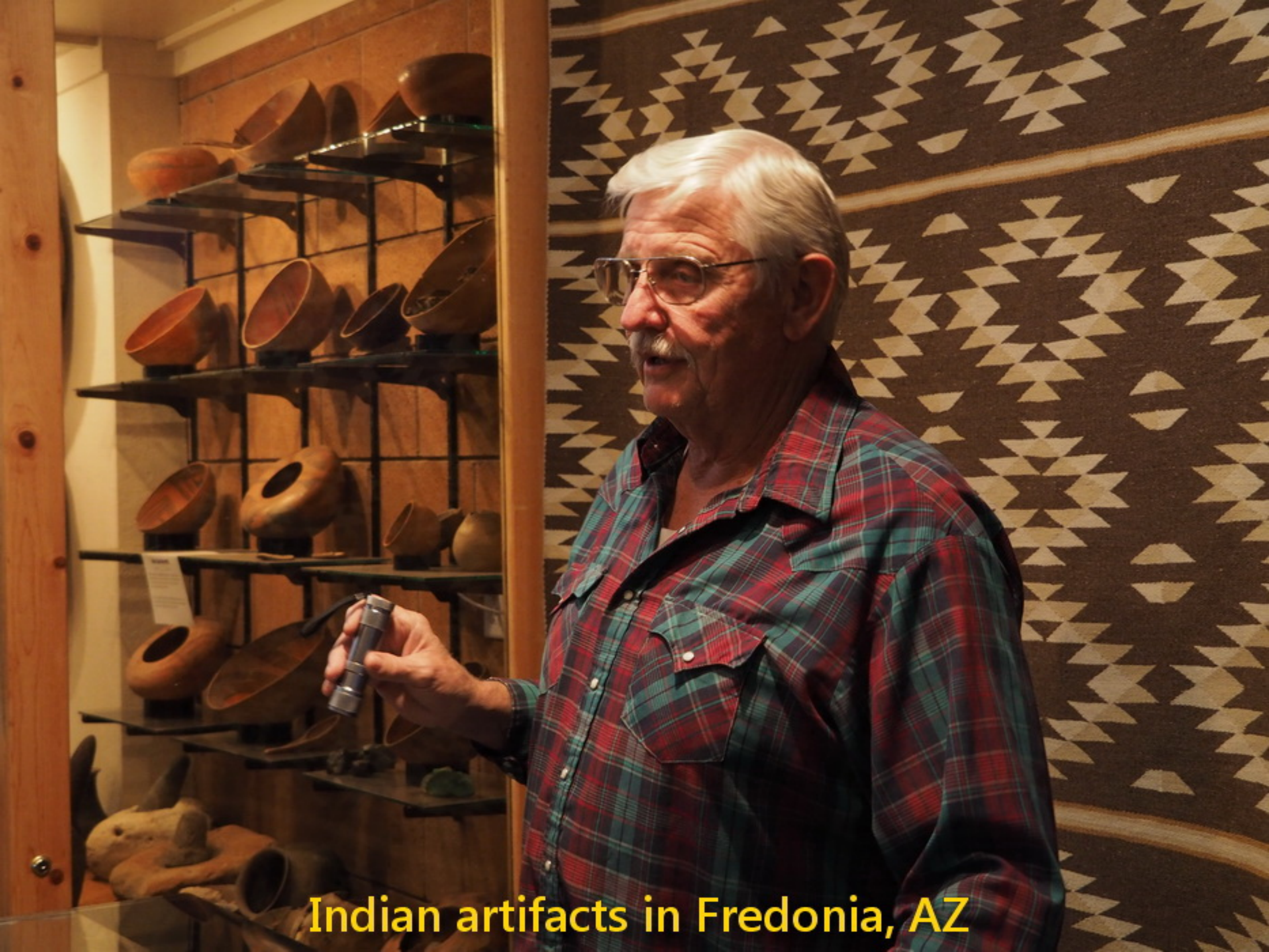
Indian artifacts in Fredonia, AZ