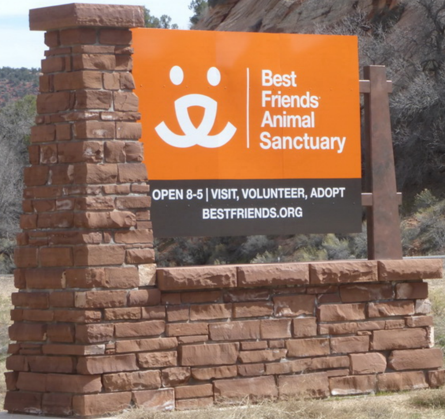
Sandy volunteers at "Best Friends"